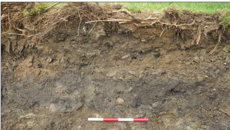
Plate 3: Representative section of soils over natural subsoil in southwest corner of site. View to east (scale 0.4m)