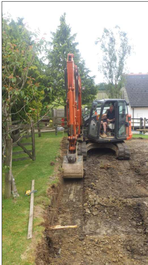
Plate 2: Working view of footings excavation. Looking south