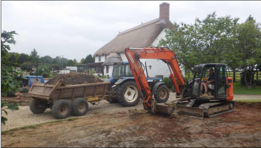
Plate 1: General view of ongoing works. Looking northwest towards Groves Fishleigh