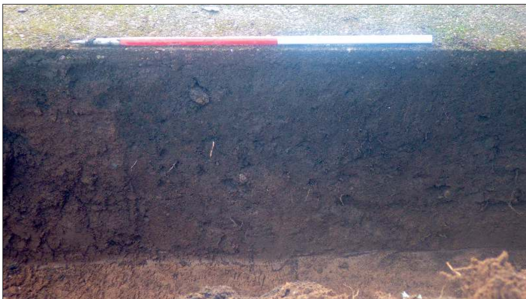
Plate 2: Representative section of Trench 1, looking south 1m scale