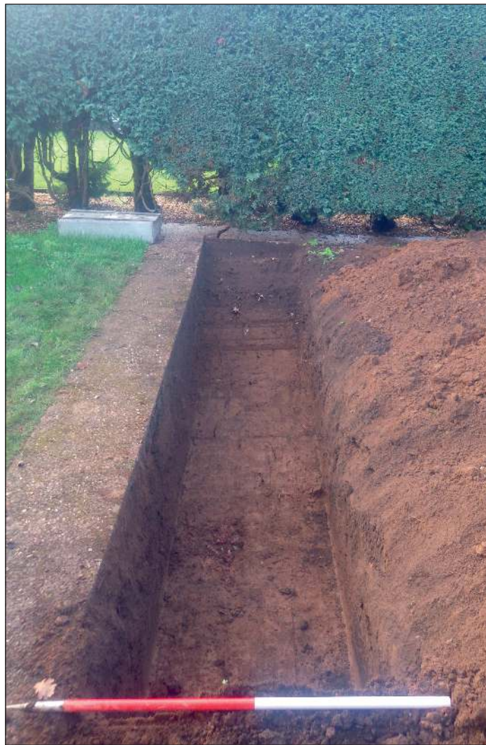
Plate 1: Trench 1, looking east 1m scale