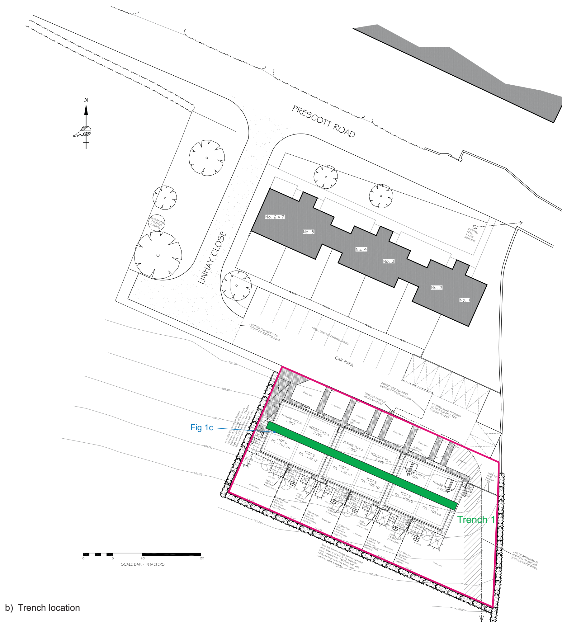
b) Trench location