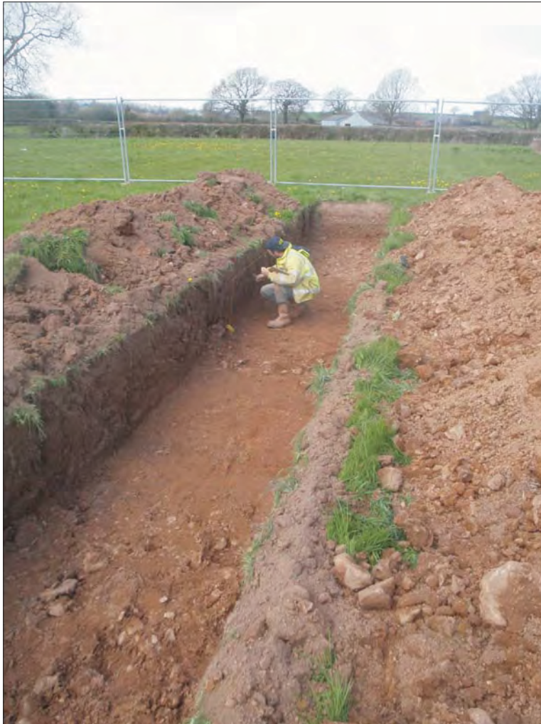
Plate 1: Recording northwest end of the trench. View from the southeast