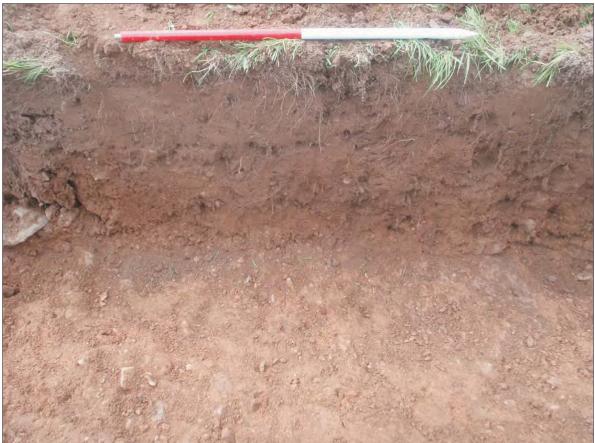
Plate 2: The general layer sequence at northwest end of trench. View from northeast (scale 1m)