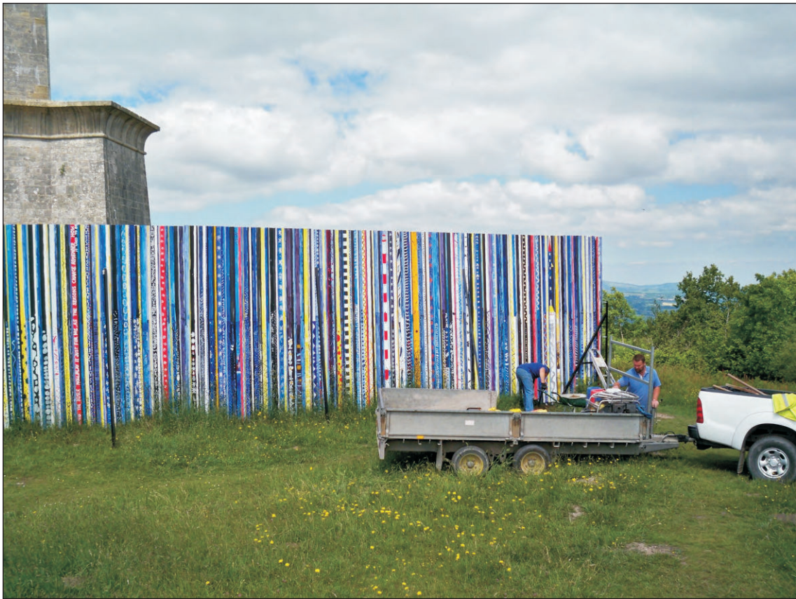
Plate 1: Excavation method, view to northwest