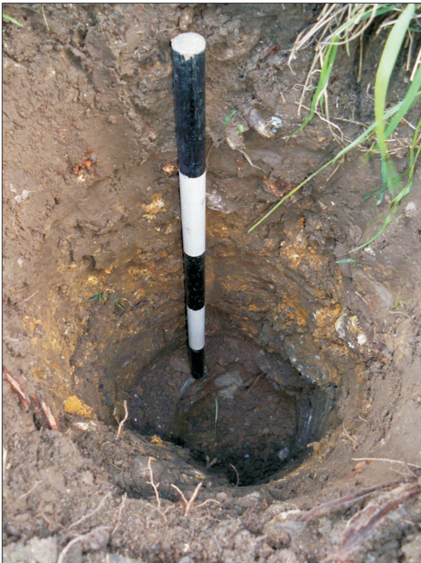
Plate 2: Detail of post pit 11. View to the north (Scale 0.5m)