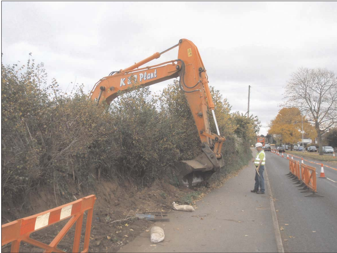
Plate 1. Translocation of hedgebank, view to southeast