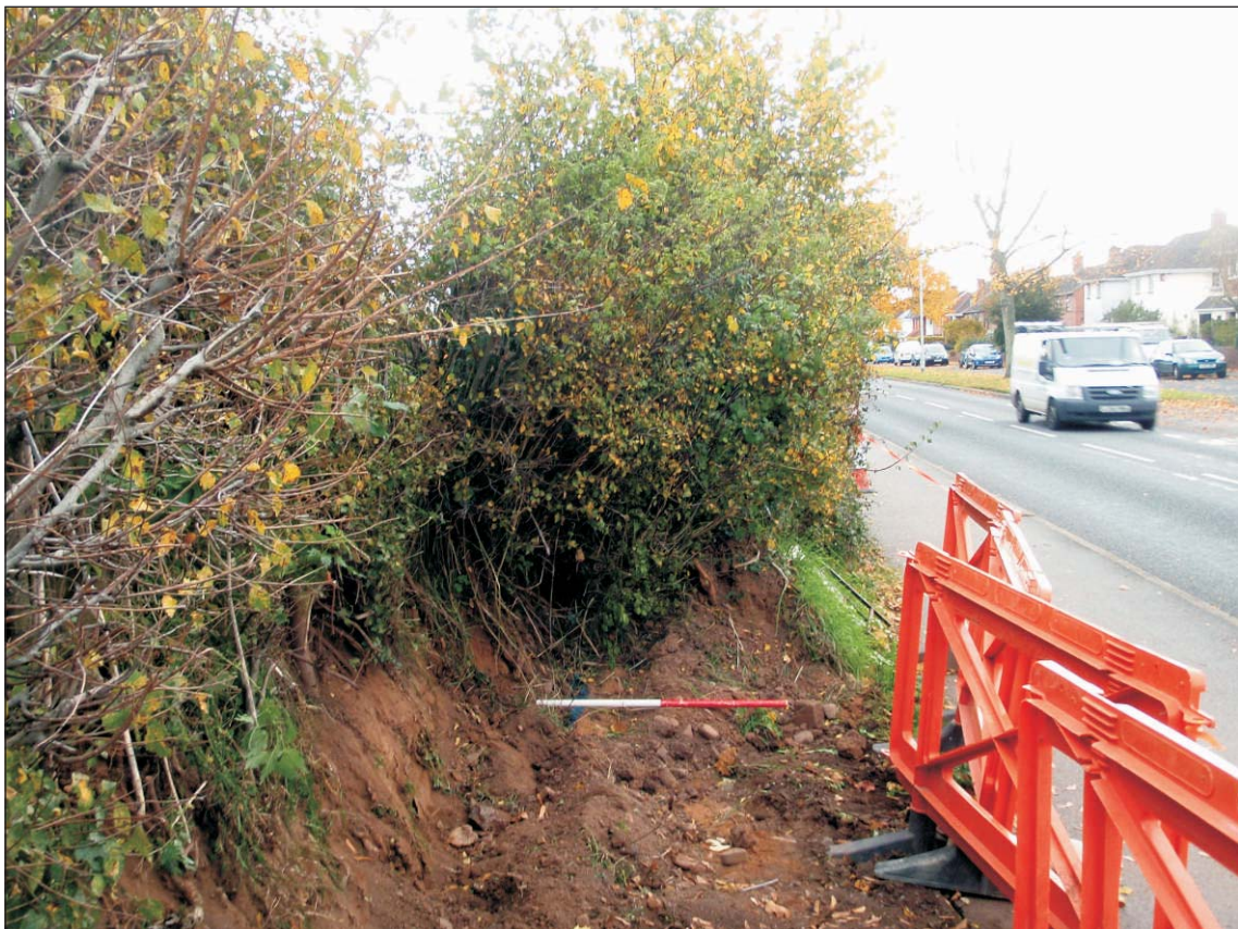
Plate 2. Section through hedgebank, view to southeast (Scale 1m)