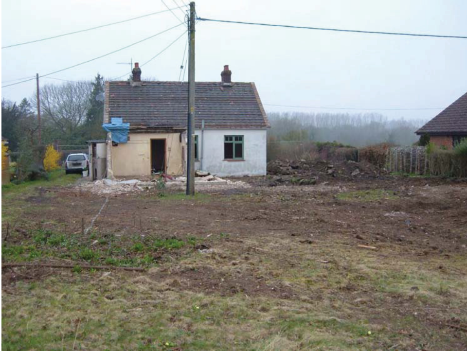
Plate 1: View to north-west prior to demolition and groundworks