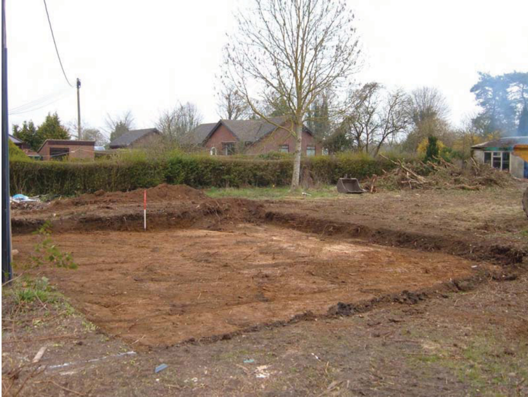
Plate 2: View to north-east showing undisturbed subsoil