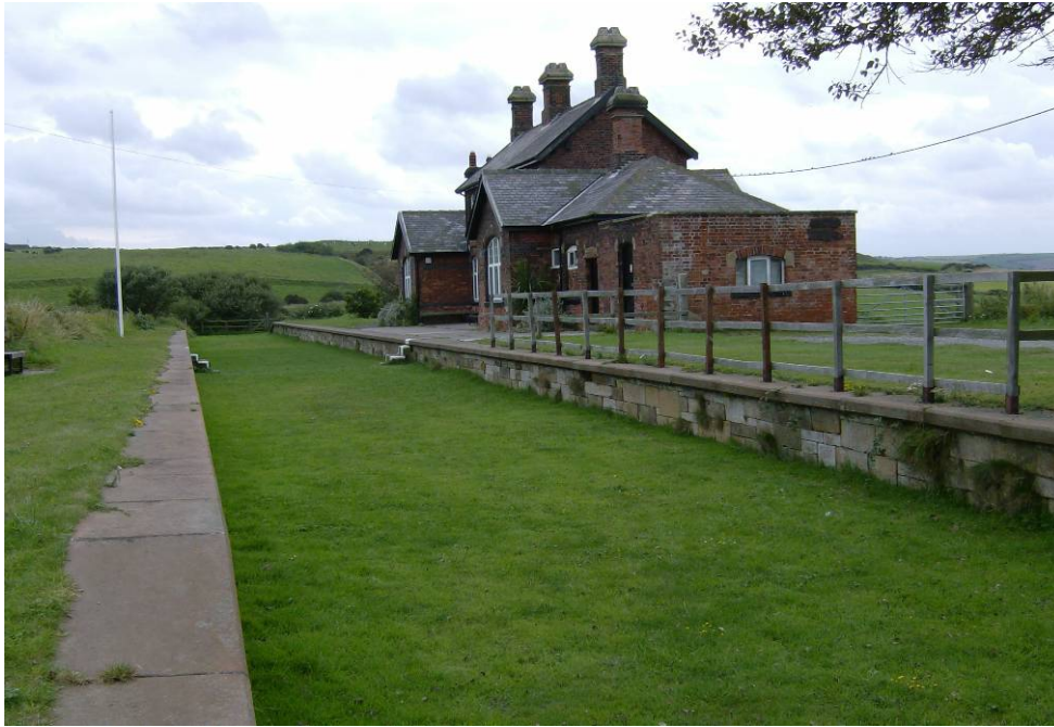
Figure 6.4 Kettleness station