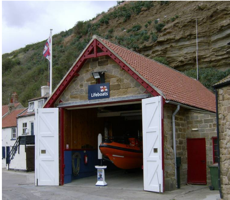
Figure 6.6 The lifeboat house at Staithes (author)