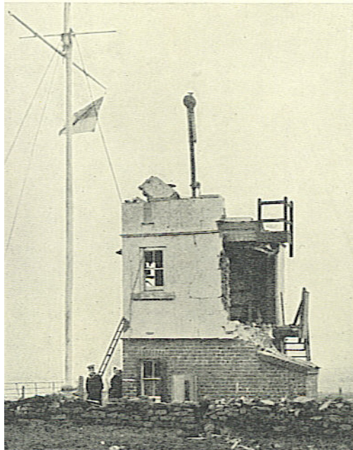
Figure 6.8 The coastguard station at Whitby after the German bombardment on 16 th December 1914