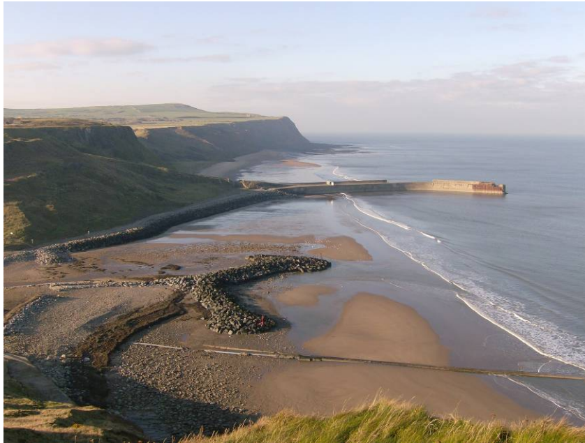
Figure 6.5 Skinningrove Harbour