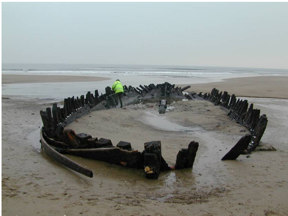
Figure 6.7 Wreck of an C18 colliery brig at Seaton Carew (Gary Green)

The vessels that plied this section of the coast were an important, if mostly transitory, feature of the coastal/maritime landscape. There are numerous records of shipwrecks but most of these are in deep water and cannot be precisely located. However, a few lie above LAT. Shipwrecks are not always systematically recorded in the HERs so the following records are referenced with respect to the numbers in the NMR.