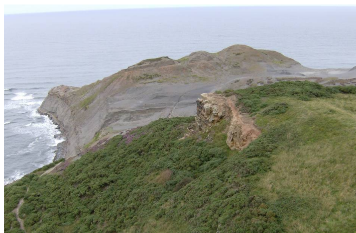
Figure 6.3 Kettleless alum works

The remains of the Kettleless alum works (NZ83301593, NYMNP 7452) occupy a promontory projecting into the North Sea, 7.5 kilometres northwest of Whitby. The works comprised quarries, an alum house plus associated processing and transport facilities. The works operated intermittently from 1727 to 1871 and was amongst the last alum works in the region to be opened and the last to close. Quarrying started at the northern end of the promontory and progressed southwards, creating by 1871 a north-facing working face up to 400 metres long and 50 metres deep, from which the grey alum shale was extracted. The first alum house lay on the foreshore in the south-east corner of Runswick Bay and was destroyed in a landslide in December 1829. A new alum house was constructed in 1830 within the quarry and the workers' housing was moved to the cliff top SW of the works (the present Kettleless hamlet). The alum house was demolished in 1875. Processing of the shale took place within the quarry, where calcining places, steeping pits, a liquor-trough tunnel, various conduits and gutters, and a number of buildings, tracks and spoil heaps all survive. The remains within the quarry area are a Scheduled Ancient Monument.