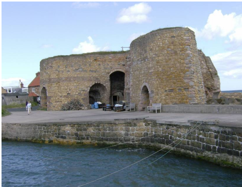
Figure 9.9 Beadnell Limekilns (author)

The most southerly group on this section of the coast is the bank of three circular draw kilns at Beadnell Harbour (NU23742857, NH 5790). They consist of one, original, central kiln dating from 1798 with two later, but early C19 additions. They are approached from the north by a ramped tramway stand over 9m high and have a single pot each. Two kilns have three segmental draw arches while the third has four. Lime from the Beadnell kilns was exported to Scottish markets but by 1821 trade had sufficiently declined for the kiln eyes to be used for curing herring (Linsley 2005, 97-86). The kilns are a Grade II Listed Building and are owned by the National Trust.