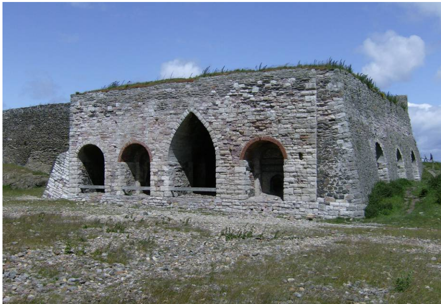
Figure 9.10 Castle Lime Works, Holy Island (author)

The bank of six lime kilns at Castle Point, Holy Island (NU13834172, NH 5351) were built in 1860 by a Dundee firm, to replace the Kennedy Limeworks, which had proved to be poorly sited. These kilns were drawn from a series of barrel-vaulted tunnels with round-headed segmental arches. A high pointed arch on the south side gave access to the interior. The kilns were supplied by an embanked tramway (NH 5356) and lime was exported from the site from Cocklestone Jetty (NH 5355). The Castle Point lime kilns operated until 1896 and have been restored by the National Trust. They are a Scheduled Ancient Monument.