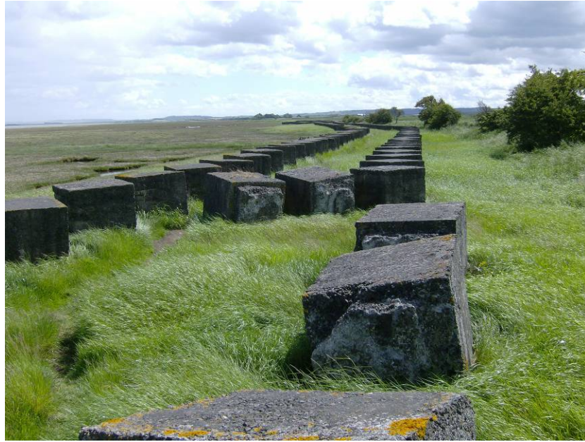
Figure 9.16 WWII anti-tank obstacles at the Beal end of the Holy Island causeway

There are few sites other than pillboxes and anti-tank obstacles , as this section of the coast does not incorporate any major ports or industrial complexes. The only major site to be considered is the emergency coastal battery at Spittal (NU006517). This site is recorded in the NMR (NMR 1421589) and features in Dobinson's gazetteer (2000, 297-298) and Civic Trust leaflet on coastal defences in the NE. This battery covered the mouth of the River Tweed, apparently mounting two 6 inch naval guns and was in commission between 1940 and 1944. It had been manned by the Home Guard and had been put on a care and maintenance footing by September 1944. It had been dismantled by February 1945 though according to the NMR some features can still be traced (NMR 1421589).