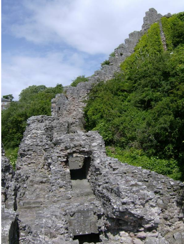
Figure 9.6 The White Wall, Berwick-upon-Tweed

The HER also records that there is documentary evidence for a castle on the south bank of the Tweed at Tweedmouth (NH 2717). It is reported to have been built by King John of England between about 1208 and 1215, being destroyed shortly after this by the Scots. There is no physical evidence for a castle at Tweedmouth and there is some doubt about its precise location.