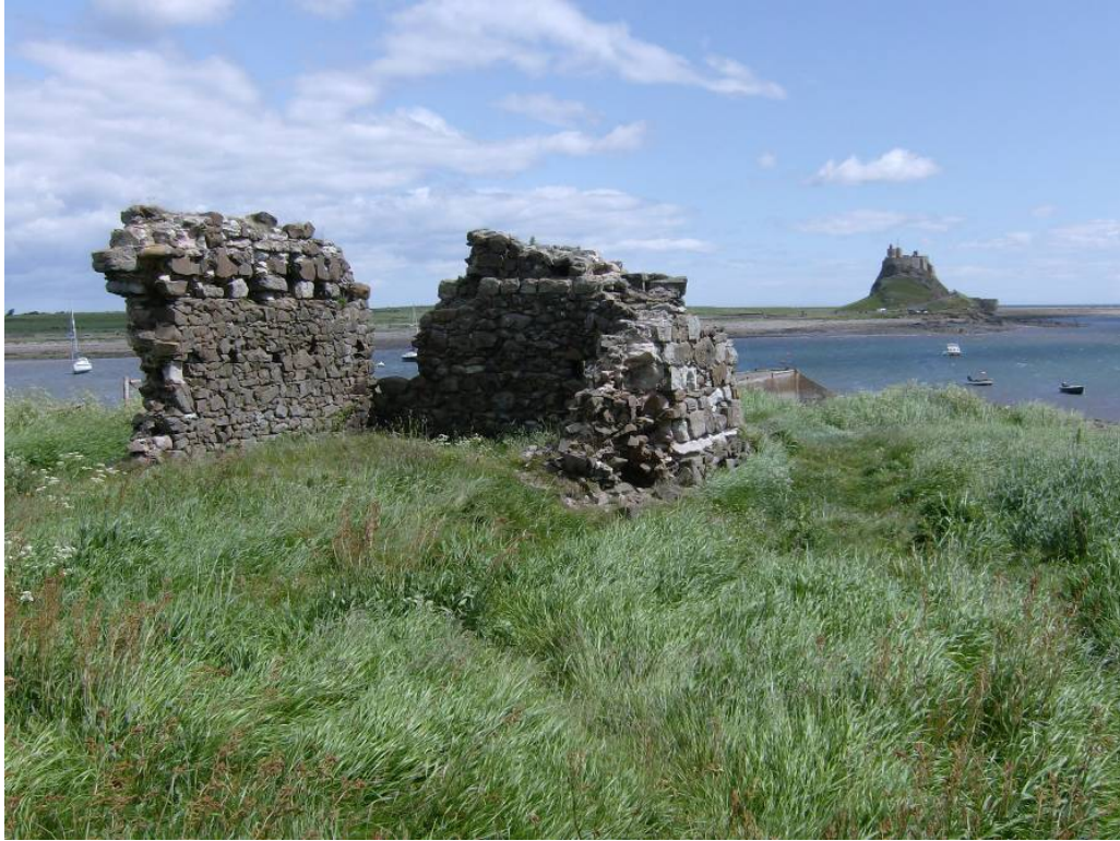
Figure 9.15 The Fort on the Heugh, Holy Island with Lindisfarne Castle in the background