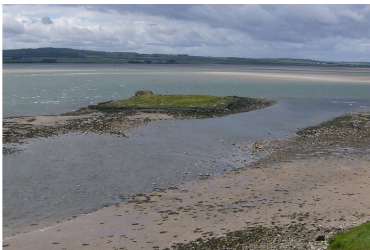
Figure 9.7 St Cuthbert's Isle

Excavations within Holy Island village in 1977 (O'Sullivan 1985, 31 and 41-43) and 2000 (Williams 2000) have revealed a number of features of Medieval date including a C13 building (NH 14261), cobbled enclosures (NH 14267 and 14270) and rubbish pits (NH 14268). Of particular interest are complex of late Medieval buildings between the Priory and the harbour and known as 'the palace' (NU12754194, NH 5363). A survey in 1994 established that these remains were part of a trapezoidal enclosure measuring 55m by 45m with buildings along the west, north and east walls. These remains appear on a map of 1548 and have been identified from documentary sources as the C15 Harbottle Place. During the reign of Elizabeth I the site was converted into a naval supply base (see below). The Palace, Holy Island is a Scheduled Ancient Monument.