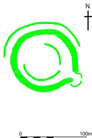
Figure 9.2 Putative Late Bronze Age enclosure at North Sunderland recorded from aerial photographs (English Heritage)

The only settlement feature that can be tentatively dated to the Bronze Age consists of a series of concentric cropmarks at North Sunderland (NU20653197, NMR 8329). The features recorded are a nearly circular ditched enclosure about 82m across, the ditch being about 10m wide. Placed concentrically within this is a second enclosure 52m across indicated by what appears to be a palisade slot, while a further concentric palisade slot has been identified outside the main ditch on the north, but probably originally continued all the way around. There is an entrance through the inner palisade and the outer ditch on the SE side and outside this two further, short lengths of palisade slot define a forecourt area. The site is undated, but morphological parallels in the region and elsewhere in England suggest a date in the early part of the 1 st millennium cal BC.