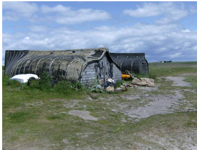
Figure 9.12 Keel boat sections at Holy Island Harbour (author)

The advent of the steam drifter in the mid C19 had a profound effect on the fisheries of this part of the coast. Small harbours and havens could not accommodate the larger more powerful vessels and fell into decline. This is well exemplified at Holy Island Harbour where 12 or more keelboats lie inverted at the head of the beach. The corollary of this was the increasing prosperity of ports such as Seahouses which was able to support of fleet of steam drifters.