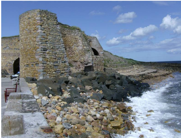
Figure 9.1 The partially eroded C18 Limekilns at Beadnell Harbour; the SMP1 ‘Preferred Strategic Option’ here (Unit 17) is Selectively Hold the Line

Reference is made to A Strategy for Coastal Archaeology in Northumberland (SCAN), published by Northumberland County Council and English Heritage in 1993. This document focuses on two principal issues, the damage and destruction of archaeological sites through coastal erosion and the exposure of remains through dune movement, which ultimately also leads to their damage and destruction. Field work carried out by the Glasgow University Archaeology Research Division examined 112km (70 miles) of coastline and assessed the potential threat to archaeological remains in the twenty-six 1:10,000 OS Map sheets in which the coastline falls. Eleven of these map sheets cover the section of coast examined in this chapter. For each sheet SCAN provides an assessment of the archaeological potential and the level of risk from erosion. These data are summarised in the following table.