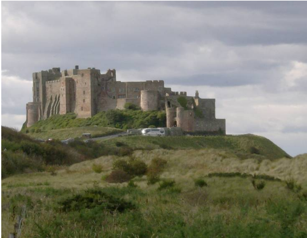
Figure 9.4 Bamburgh Castle from the east (author)

Medieval period though the east gatehouse is partly C11. Much of the rest of the castle has been rebuilt and added to many times since the Middle Ages, mainly in the late C18 and C19 (Grundy et al 1992, 154-157). However, excavations at the castle in the 1960s, 1970s and from 1996 have revealed a number of features of Medieval date (Wood and Young 1997-1998; Young and Wood 1999-2000; Young and Wood 2000-2001; Young and Wood 2003; Young 2004; Young 2005; Wood 2004; Wood 2005; Bamburgh Research Project 2006). Bamburgh Castle is a Grade 1 Listed Building.