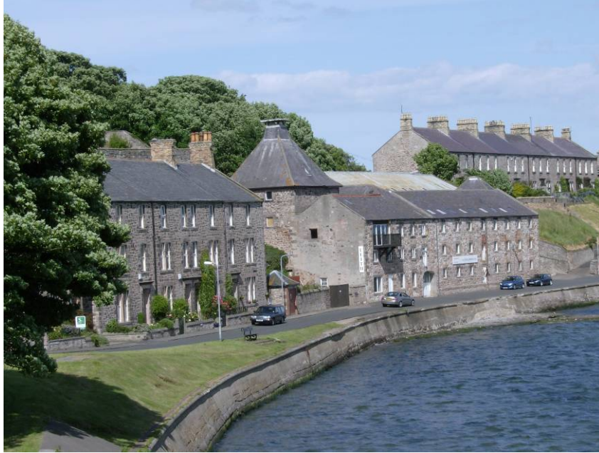
Figure 9.11 Pier Maltings, Berwick-upon-Tweed

The advent of the steam drifter in the mid C19 had a profound effect on the fisheries of this part of the coast. Small harbours and havens could not accommodate the larger more powerful vessels and fell into decline. This is well exemplified at Holy Island Harbour where 12 or more keelboats lie inverted at the head of the beach. The corollary of this was the increasing prosperity of ports such as Seahouses which was able to support of fleet of steam drifters.