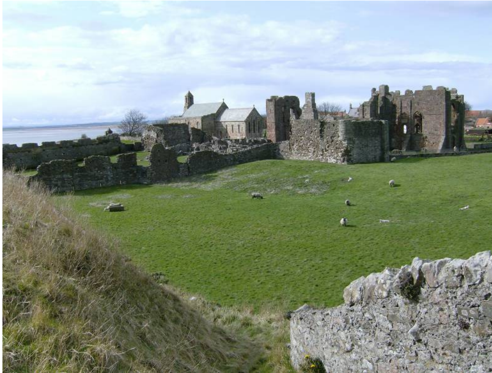
Figure 9.5 Lindisfarne Priory seen from The Heugh