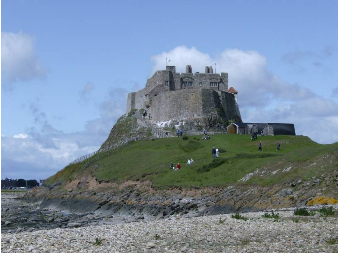
Figure 9.14 Lindisfarne Castle (author)

Lying about 600m to the west and on a rocky Whin Sill promontory on the opposite side of Holy Island Harbour lie the remains of The Fort on the Heugh, also known as Osborne's Fort (NU12954165, NH 5339). Built between 1671 and 1675 its layout can be established from a plan of 1742 and a survey carried out on site in 1986. The fort consisted of a polygonal enclosure, measuring 64m east-west by 32m north-south, surrounding a rectangular blockhouse or redoubt. The north, east and south sides follow the edge of the promontory while that to the west, including the main entrance runs across level ground. The south and east, seaward facing, sides were originally protected by a double wall, but much of the outer wall has collapsed down slope. The space between these walls was occupied by the gun platforms. According to the 1742 plan small turrets stood at the west, north and east corners of the enclosure. The redoubt was 6.6m square and probably of two storeys with a pitched roof (Beavitt, O'Sullivan and Young 1987, 20-21; O'Sullivan and Young 1995, 91-92, 98-99). The north and east walls still stand to 4m. The Fort on the Heugh is a Scheduled Ancient Monument.