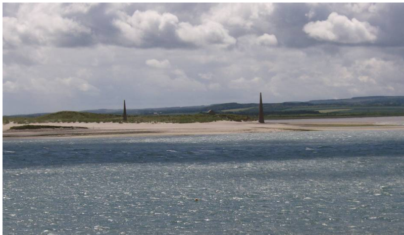
Figure 9.13 The Guile Point obelisks, Holy Island Harbour (author)

The difficulties faced by mariners trying to enter Holy Island Harbour have led to the provision of a number of beacons whereby vessels may fix their position and establish the correct bearing to follow. The most prominent of these are the two brick-and-stone-clad obelisks at Guile Point (NU13114054 and NU12994052, NH 5375). These were designed by the famous Newcastle architect John Dobson and built between 1820 and 1840. The Guile Point Beacons are Grade II Listed Buildings. Further beacons were provided in 1830s on the Heugh between Holy Island village and the harbour and on Emmanuel Head, designed to assist vessels approaching from the north (Linsley 2005, 57-58). The latter, now a prominent white pyramid, is a major Holy Island landmark.