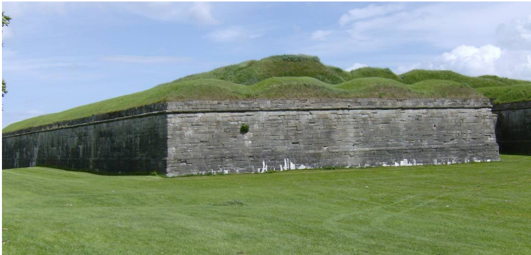
Figure 9.8 The C16 Brass Bastion and C17 earthworks, Berwick-upon-Tweed

The Elizabethan defences of Berwick-upon-Tweed consisted of a system of five massive bastions defining the north and east sides of the town. The bastions were linked to a massive, sloping curtain wall by a narrow collar which, supplied with gun loops, provided for flanking fire. A rather weaker curtain wall was built along the south and west sides which face on to the river, mainly following the line of the earlier Medieval defences. Work began in 1558 and continued for 11 years. Extensive earthworks lay at the foot of the main defences and a feature known as the Covered Way (NH 4137) ran NE from the most northerly bastion to a redoubt (NH 4138) on the foreshore. Further additions were made to these fortifications over the next four centuries. The first set of modifications occurred between 1638 and 1652 when earthwork parapets and gun platforms were added on top of the bastions, while the walls overlooking the river were substantially rebuilt in the C18. Fisher's Fort, a gun battery overlooking the river mouth and believed to antedate the construction of the Elizabethan defences was rebuilt in the C18 while two other batteries on the riverside were added circa 1745. C19 additions mainly consisted of changes to the gates to improve access while the Windmill Bastion on the east side of the town also mounted a C19 gun battery (Grundy et al 1992, 174 and 177-178). The fortifications of Berwick-upon-Tweed are a Scheduled Ancient Monument (NMR 28532).