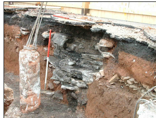
b. Masonry cellar steps 1005 looking southwest, scales 1 m by 1 m.