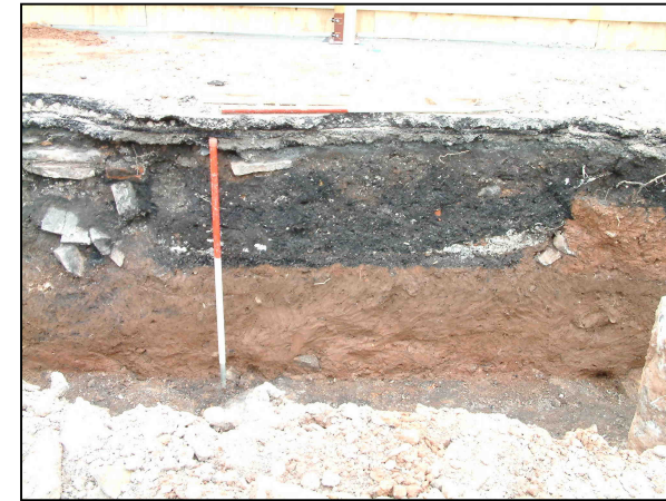
c. Cut 1027 looking west, scales 1 m by 1 m.