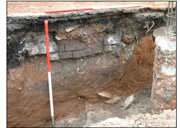
d. Brick feature 1029 looking northwest, scales 1 m by 1 m.