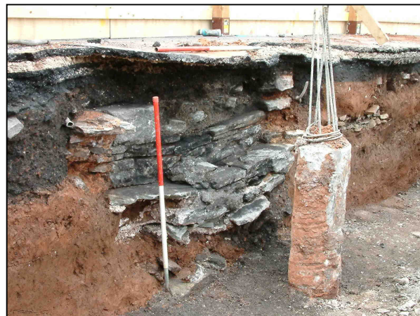
a. Masonry cellar steps 1005 looking northwest, scales 1 m by 1 m.