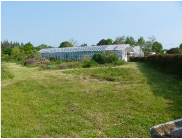
Plate 1. General view of east end of Site (from SE; no scale)