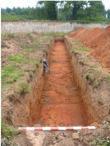
Plate 3. Tr 1 (from NW; 1m scale)