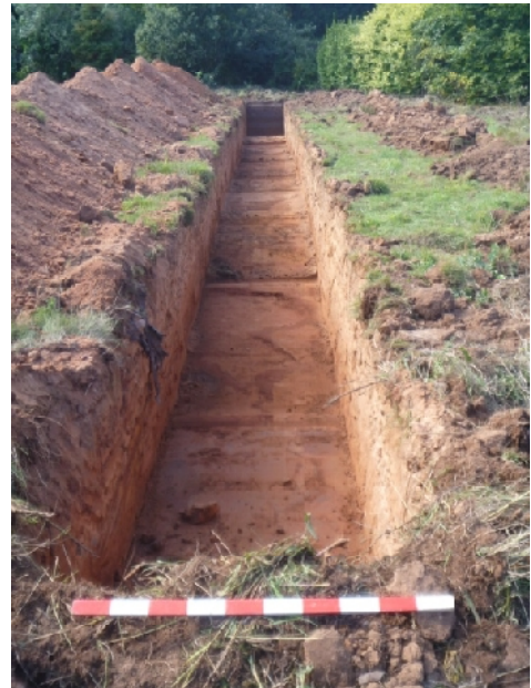
Plate 4. Tr 5 (from SW; 1m scale)