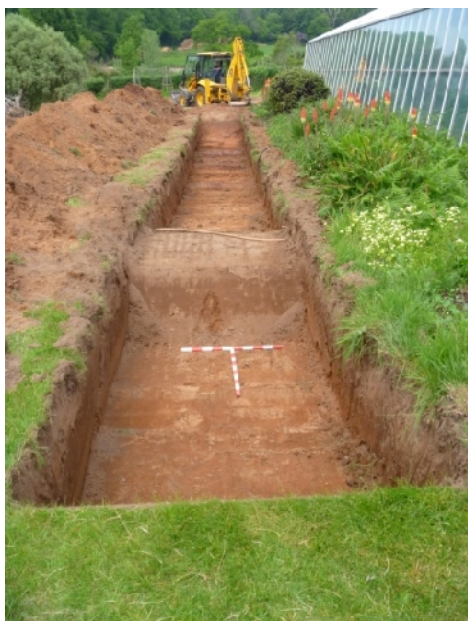
Plate 5. Tr 10 (from W; 2 x 1m scale)