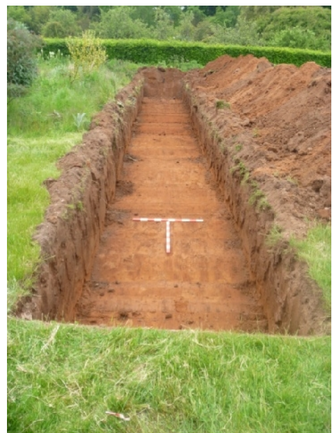
Plate 6. Trench 12 (from N; 2 x 1m scale)