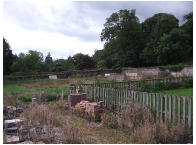
Plate 2. General view of west end of Site (from SEE; no scale)