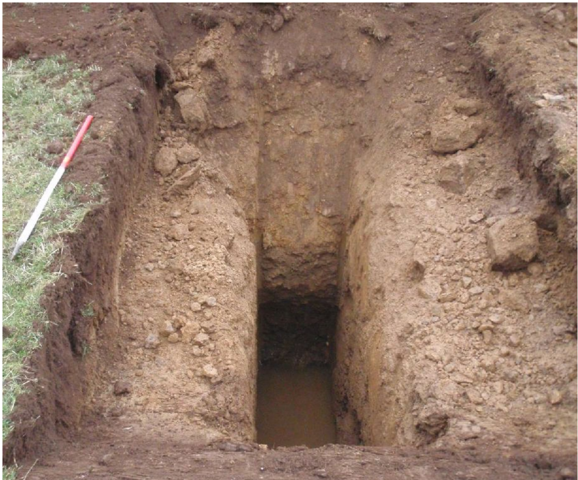
Plate 2. Test pit 2 (from SW; 1m scale)