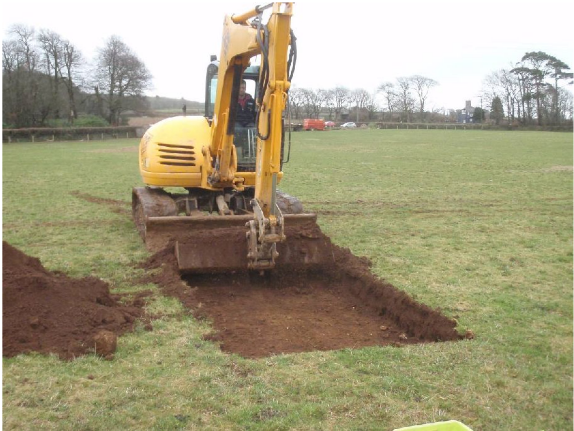
Plate 1. Topsoil removal, test pit 3 (no scale)