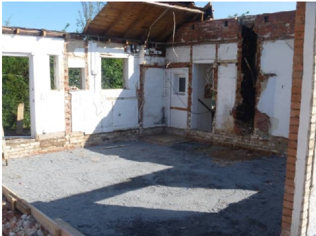
Plate 1. Partially demolished residence (from SE; no scale)