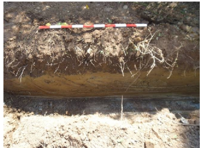
Plate 4. Profile 2 (from NW; 1m scale)

Please email completed form to: archaeol@devon.gov.uk or post to County Archaeology Service, Environment Directorate, Matford Lane Offices, County Hall, Topsham Road, Exeter EX2 4QW. Information recorded on this form will be added to the Historic Environment Record, and made available to all researchers. Any plans or photographs embedded within or attached to this form remain the copyright © of the recorder, and must not be reproduced in any publication without the explicit consent of the copyright holder.