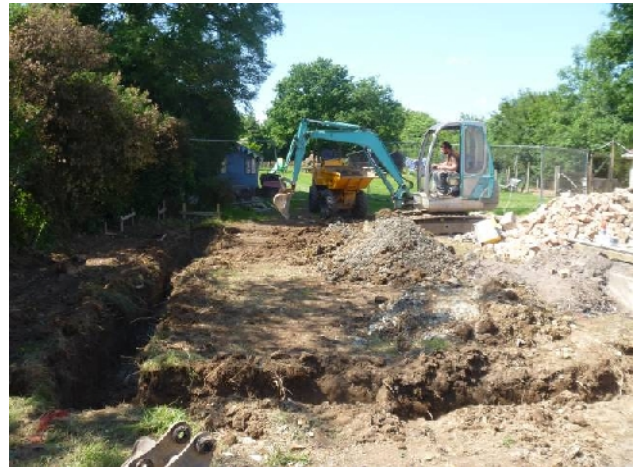
Plate 2. The site during groundworks (from NE; no scale)