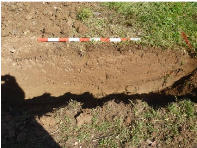
Plate 3. Profile 1 (from SE; 1m scale)