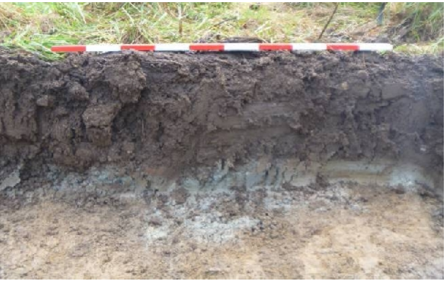
Plate 3. Profile 2 (from SW; 1m scale)