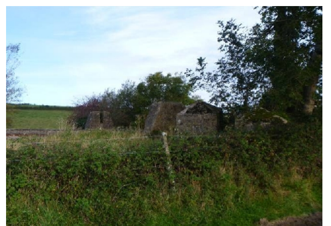
Plate 5. Anti-tank defences (from E; no scale)