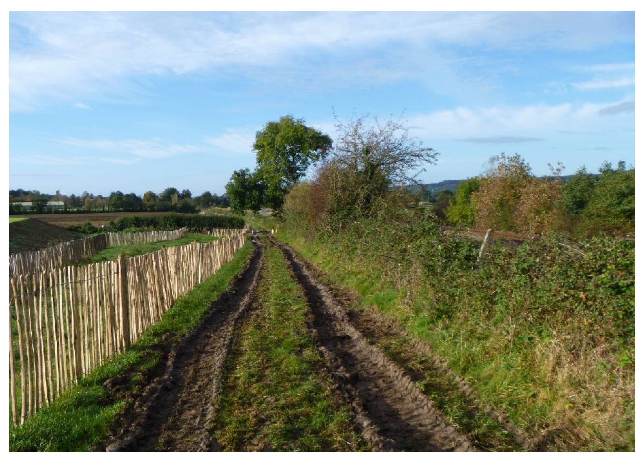
Plate 1. The route adjacent to the railway line (from N; no scale)