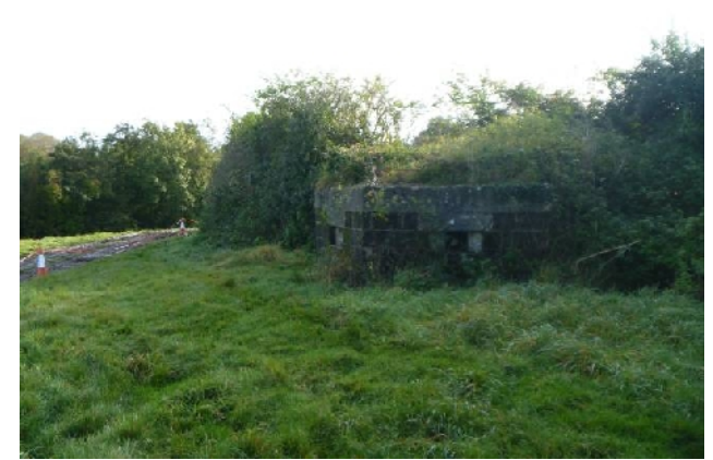
Plate 4. The pill box (from SW; no scale)