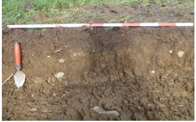
Plate 2. Profile 1 (from SW; 1m scale)