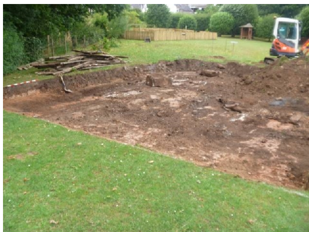
Plate 3. The site (from SE; 1m scale)