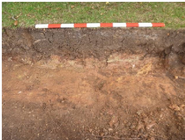
Plate 4. Profile 1 (from ENE; 1m scale)

Please email completed form to: archaeol@devon.gov.uk or post to County Archaeology Service, Environment Directorate, Matford Lane Offices, County Hall, Topsham Road, Exeter EX2 4QW. Information recorded on this form will be added to the Historic Environment Record, and made available to all researchers. Any plans or photographs embedded within or attached to this form remain the copyright © of the recorder, and must not be reproduced in any publication without the explicit consent of the copyright holder.