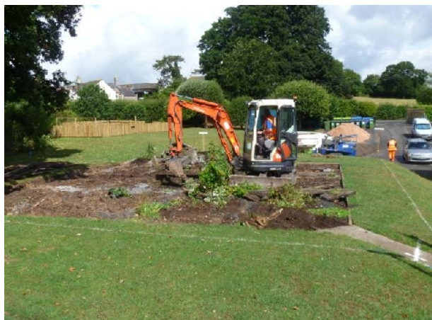
Plate 2. The site during groundworks (from SSE; no scale)