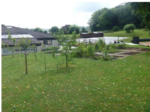
Plate 1. Vegetable plots and young trees (from NW; no scale)