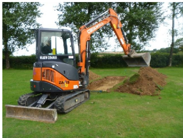
Plate 2. Trench 1 (from S; no scale)