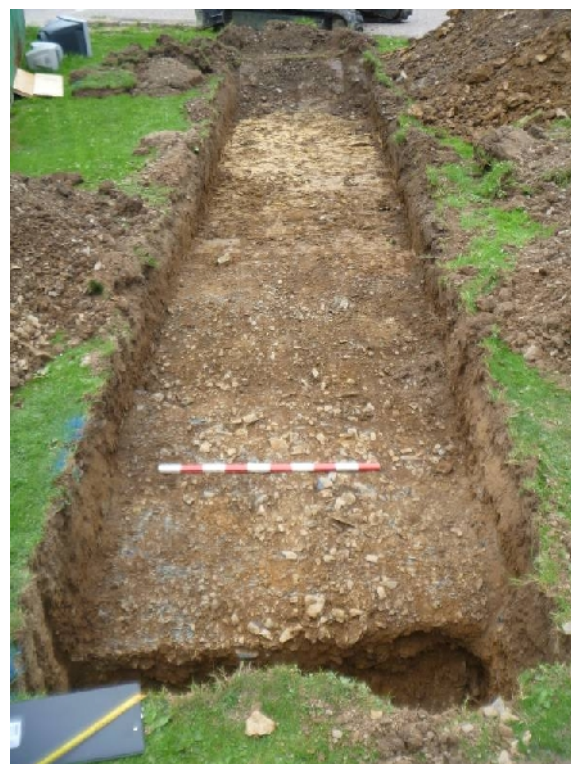
Plate 4. Trench 3 (from N; 1m scale)

Please email completed form to: archaeol@devon.gov.uk or post to County Archaeology Service, Environment Directorate, Matford Lane Offices, County Hall, Topsham Road, Exeter EX2 4QW. Information recorded on this form will be added to the Historic Environment Record, and made available to all researchers. Any plans or photographs embedded within or attached to this form remain the copyright © of the recorder, and must not be reproduced in any publication without the explicit consent of the copyright holder.