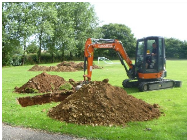
Plate 1. Trenches 1 & 2 (from S; no scale)