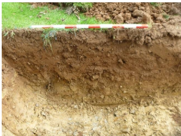
Plate 3. Trench 2 profile (from S; 1m scale)