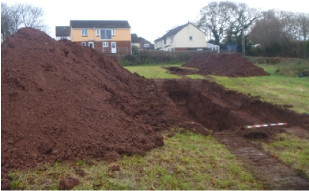
Plate 1. General view of Site with Godfrey Gardens to the east (from W; 1m scale)