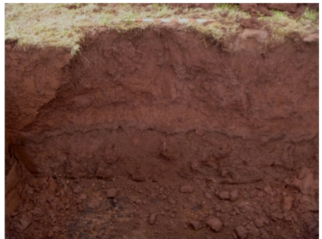
Plate 4. Tr 3 profile (from N; 1m scale)

Please email completed form to: archaeol@devon.gov.uk or post to County Archaeology Service, Environment Directorate, Matford Lane Offices, County Hall, Topsham Road, Exeter EX2 4QW. Information recorded on this form will be added to the Historic Environment Record, and made available to all researchers. Any plans or photographs embedded within or attached to this form remain the copyright © of the recorder, and must not be reproduced in any publication without the explicit consent of the copyright holder.