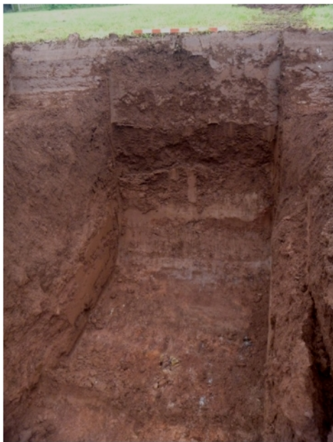
Plate 3. Tr 2 profile (from W; 1m scale)