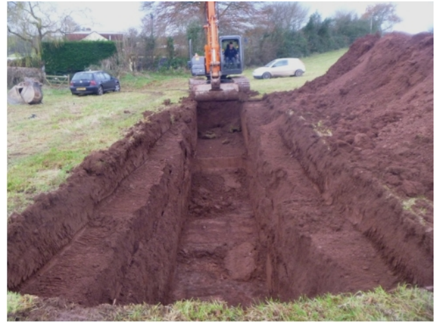
Plate 2. Tr 2 (from E; no scale)