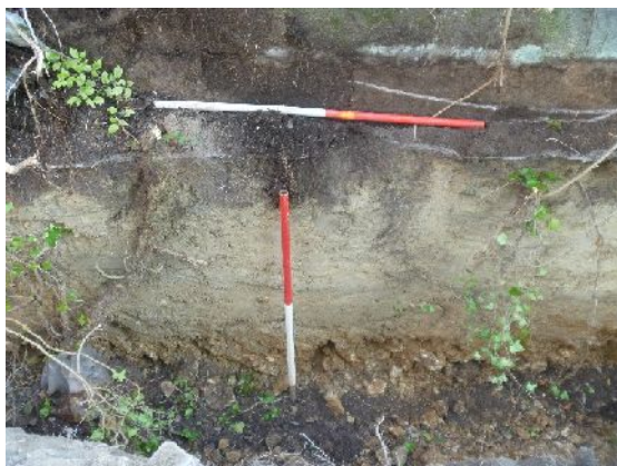
Plate 3. SE facing profile (from NW; 1m scale)