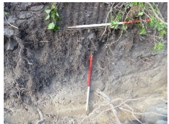
Plate 2. NW facing profile ( from SE; 1m scale)