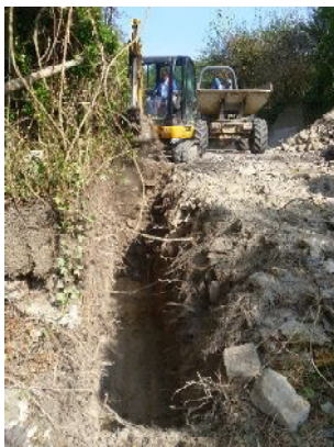
Plate 1. Excavations in progress (from S)