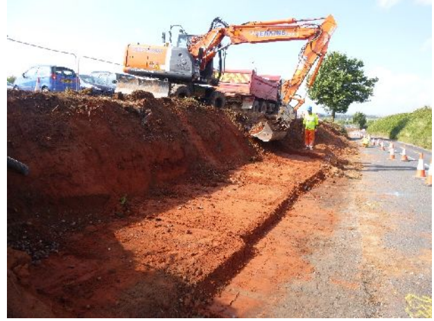
Plate 2. Soil stripping on bank (from E)