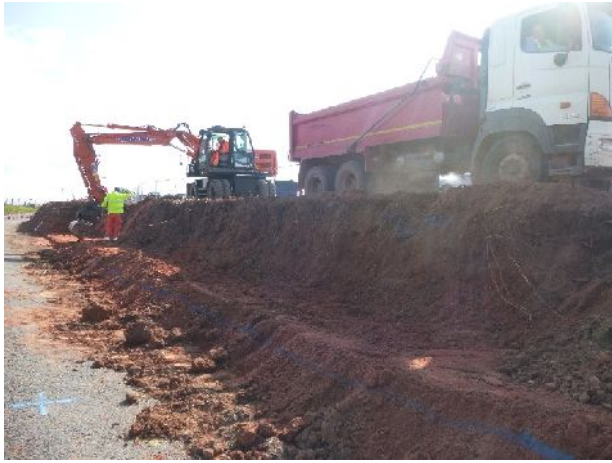
Plate 1. Bank work in progress (from W)