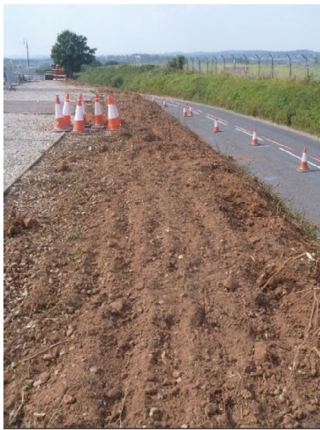
Plate 3. Verge reduction (from W)

Please email completed form to: archaeol@devon.gov.uk or post to County Archaeology Service, Environment Directorate, Matford Lane Offices, County Hall, Topsham Road, Exeter EX2 4QW. Information recorded on this form will be added to the Historic Environment Record, and made available to all researchers. Any plans or photographs embedded within or attached to this form remain the copyright © of the recorder, and must not be reproduced in any publication without the explicit consent of the copyright holder.