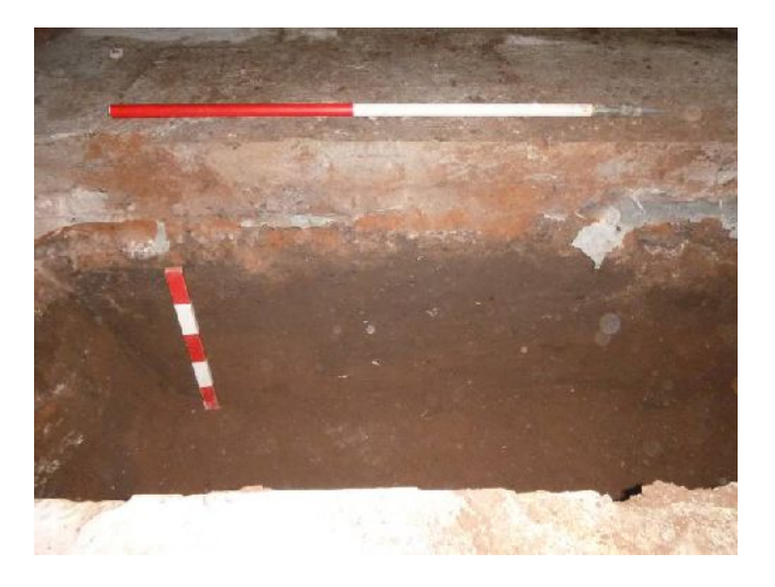
Plate 3. Profile of foundation trench (Looking E; 1m & 0.5m scales)