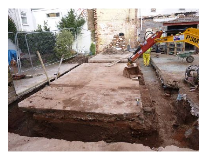
Plate 1. Site location (Looking N)