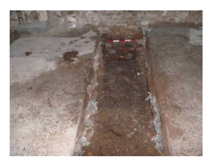
Plate 2. Foundation trenching (Looking NE; 0.5m scale)