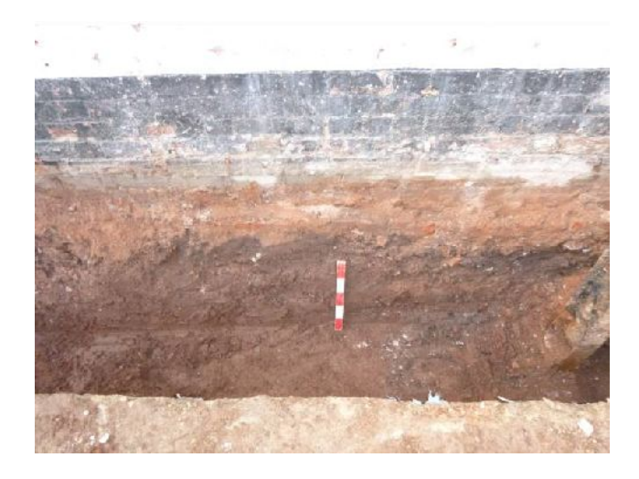
Plate 4. Profile of foundation trench (Looking NW; 0.5m scale)

Please email completed form to: <a href="mailto:archaeol@devon.gov.uk">archaeol@devon.gov.uk</a> or post to County Archaeology Service, Environment Directorate, Matford Lane Offices, County Hall, Topsham Road, Exeter EX2 4QW. Information recorded on this form will be added to the Historic Environment Record, and made available to all researchers. Any plans or photographs embedded within or attached to this form remain the copyright © of the recorder, and must not be reproduced in any publication without the explicit consent of the copyright holder.