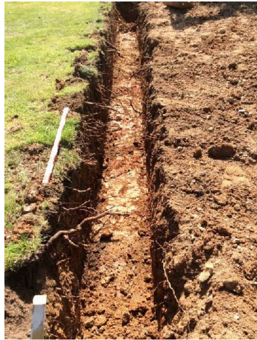
Plate 2. South facing section in plan (1m scale)