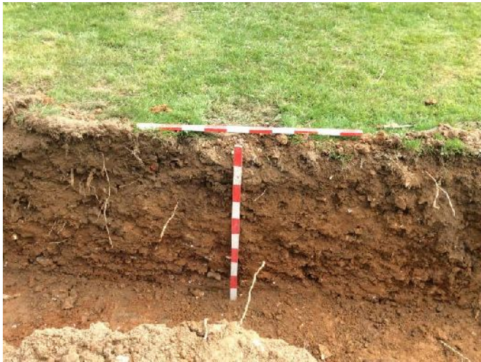
Plate 1. South-west facing section profile 1 (1m scales)