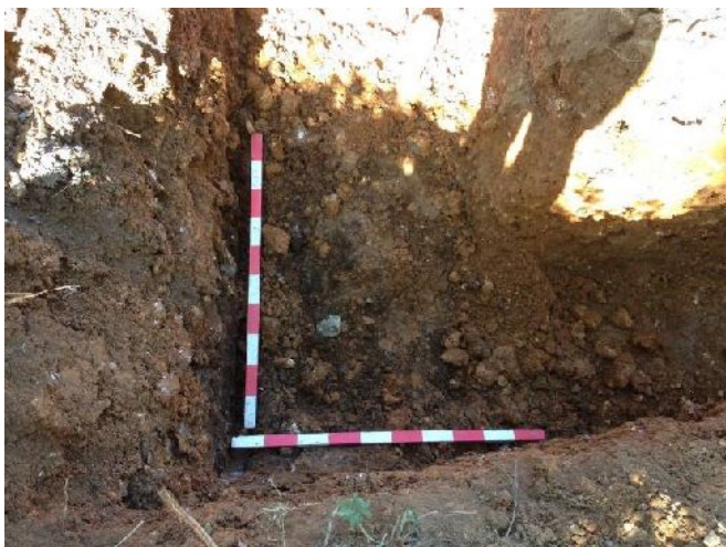
Plate 3. Tree throw in NW corner of excavations (1m scales)

Please email completed form to: archaeol@devon.gov.uk or post to County Archaeology Service, Environment Directorate, Matford Lane Offices, County Hall, Topsham Road, Exeter EX2 4QW. Information recorded on this form will be added to the Historic Environment Record, and made available to all researchers. Any plans or photographs embedded within or attached to this form remain the copyright © of the recorder, and must not be reproduced in any publication without the explicit consent of the copyright holder.