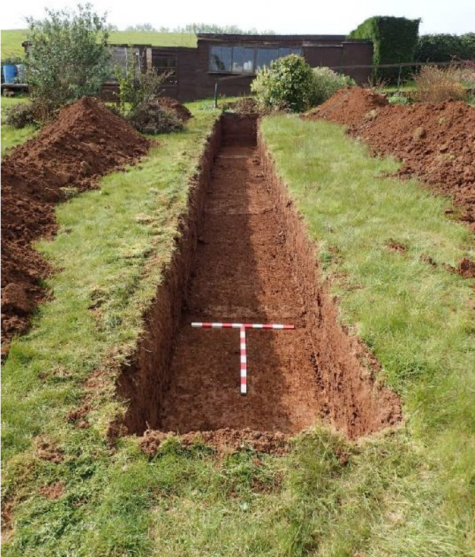
Plate 2. Trench 2 (from S; 1m scales)