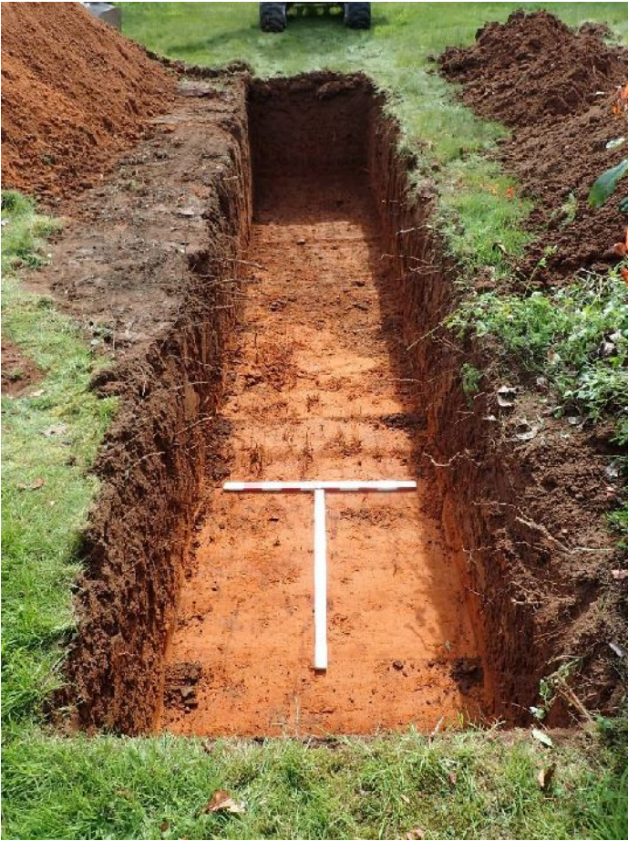
Plate 1. Trench 1 (from NW; 1m scales)