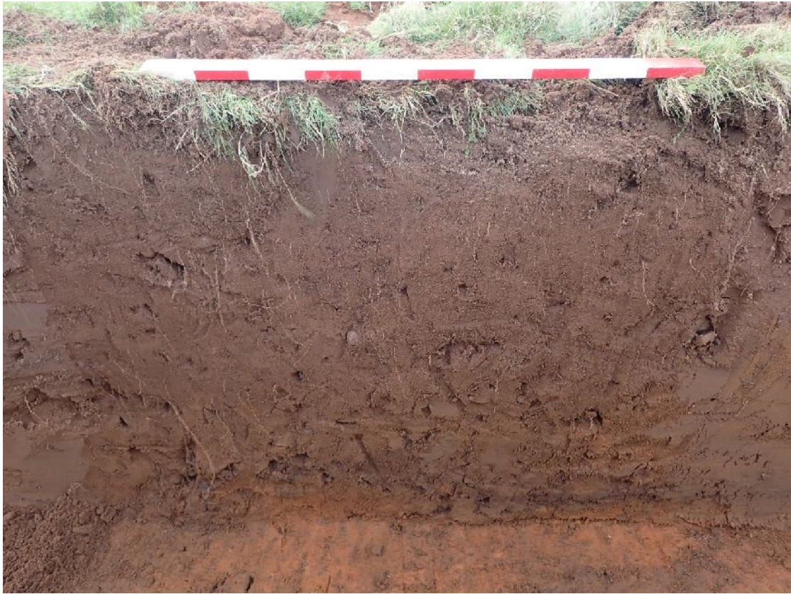
Plate 1. Profile Trench 1 (from W; 1m scale)