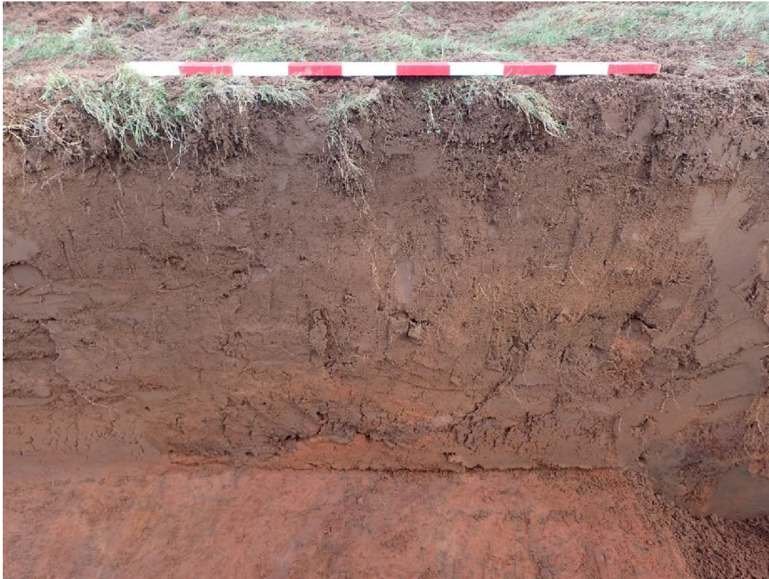
Plate 3. Trench 3 (from W; 1m scale)

Any plans or photographs embedded within or attached to this form remain the copyright © of the recorder, and must not be reproduced in any publication without the explicit consent of the copyright holder.