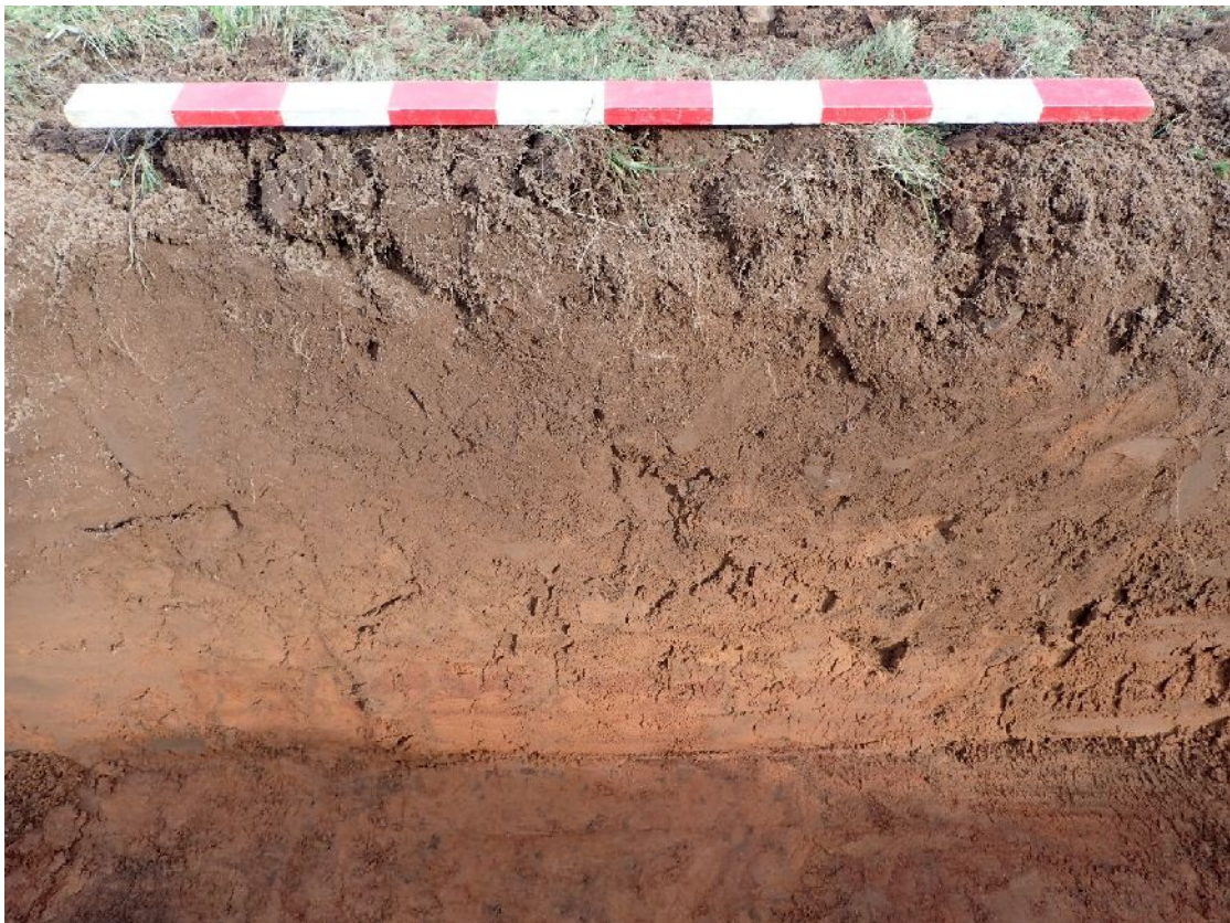
Plate 2. Trench 2 (from W; 1m scale)