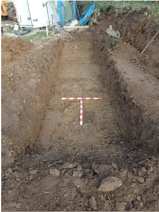
Plate 1. Trench 1 (facing N; 2 x 1m scale)