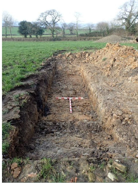
Plate 2. Trench 2 (facing W; 2 x 1m scale)