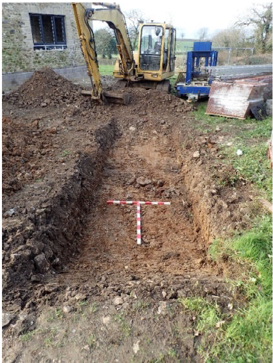
Plate 2. Trench 3 (facing W; 2 x 1m scale)