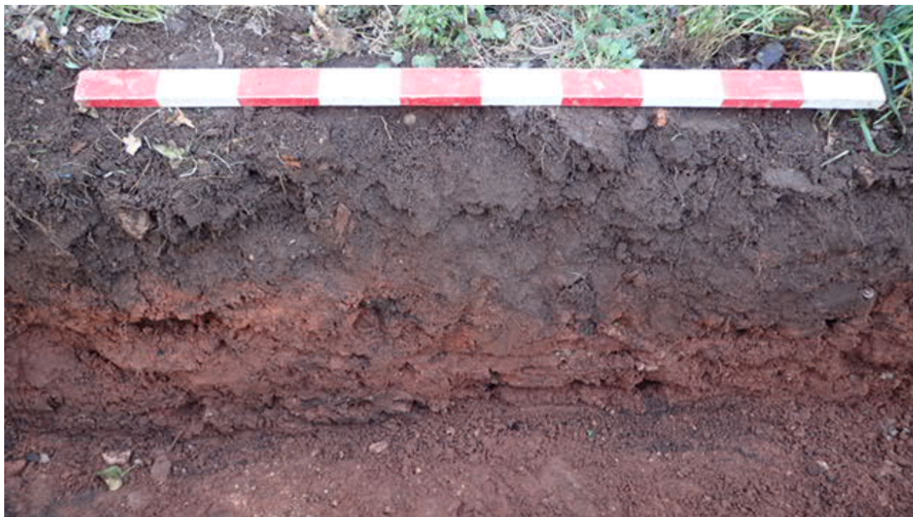
Plate 1. Profile 1 (facing SE; 1m scale)