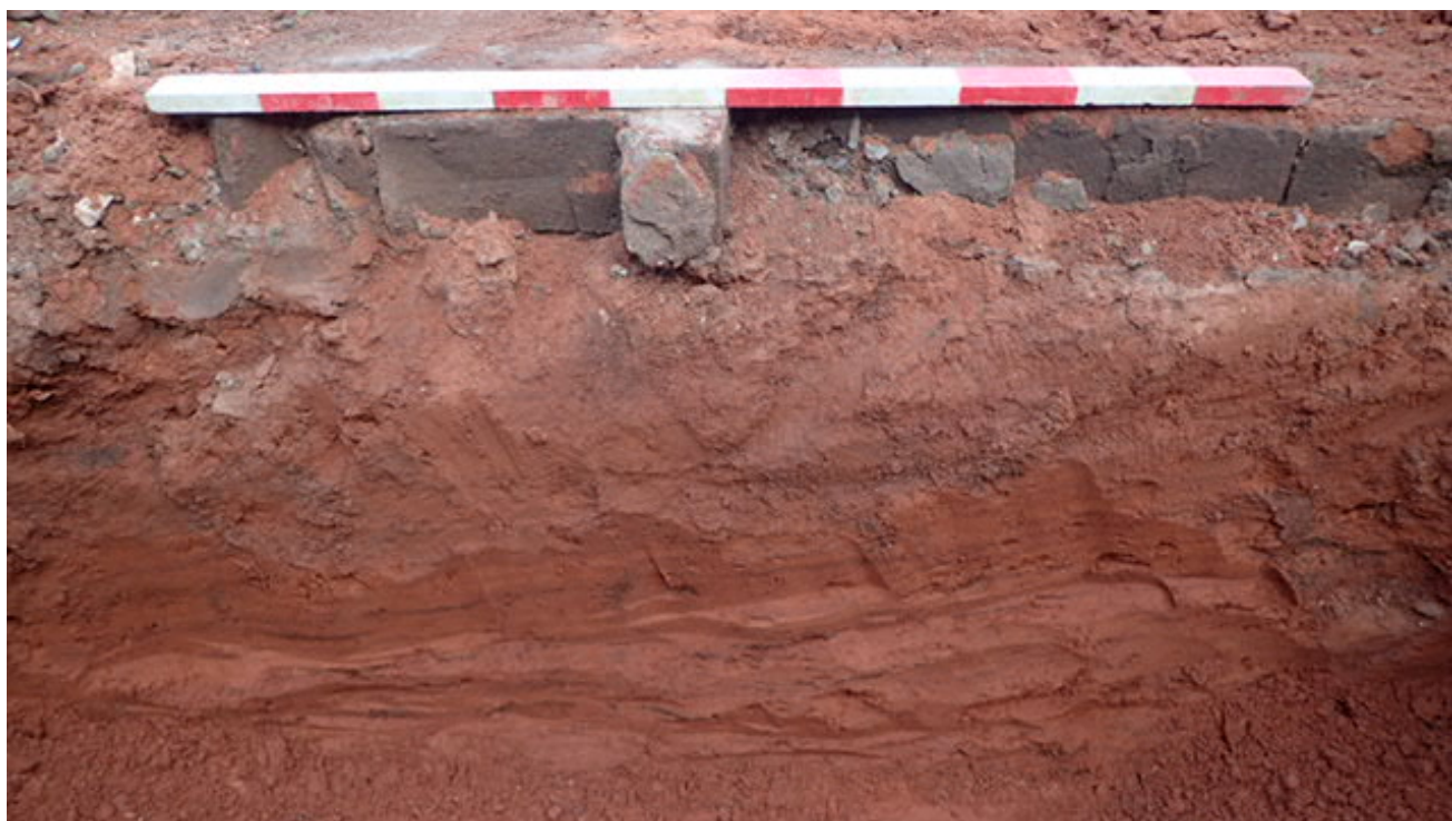
Plate 2. Profile 2 (from W; 1m scale)

Any plans or photographs embedded within or attached to this form remain the copyright © of the recorder, and must not be reproduced in any publication without the explicit consent of the copyright holder.