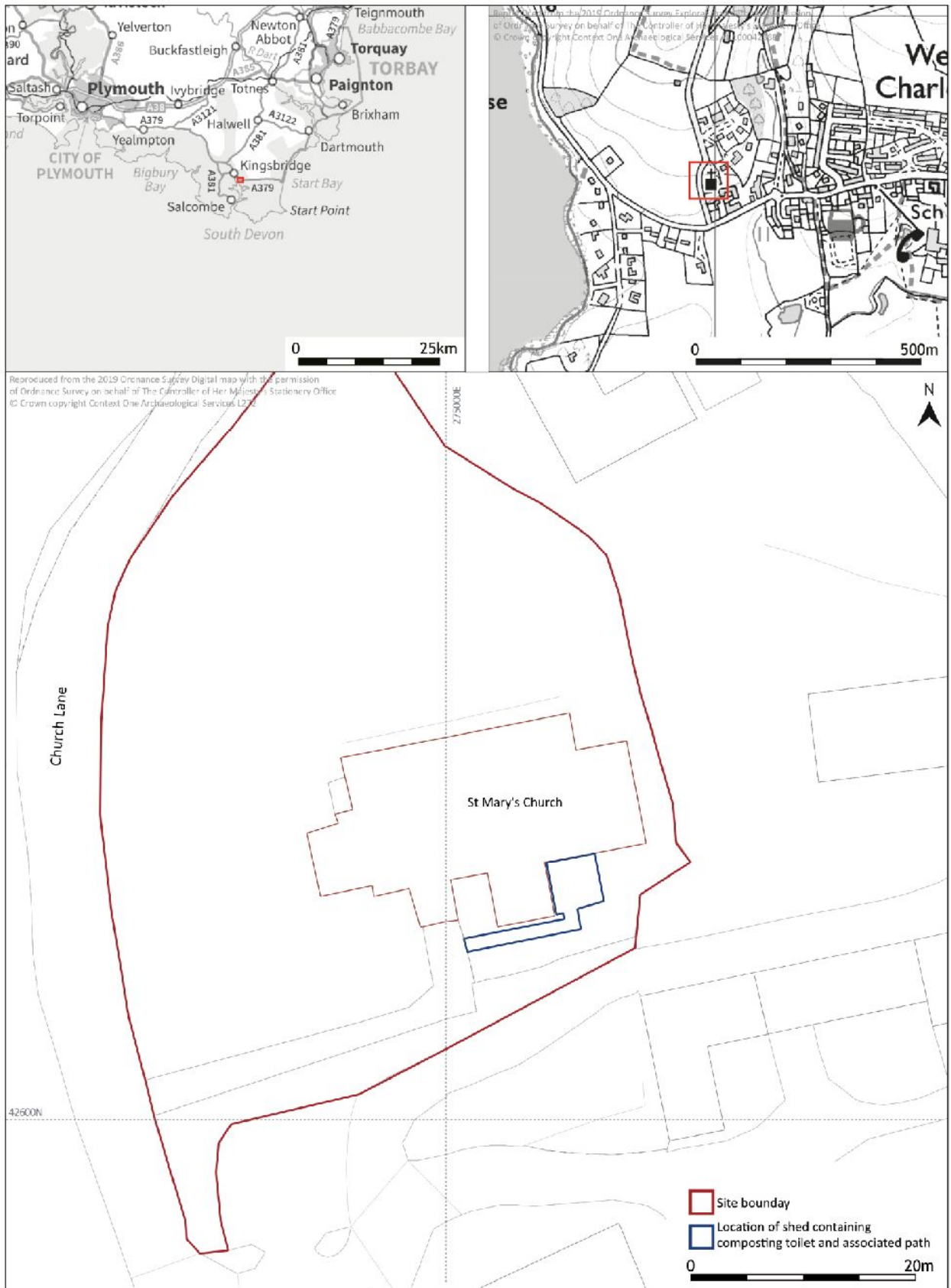
Figure 1. Site setting showing location of shed/path