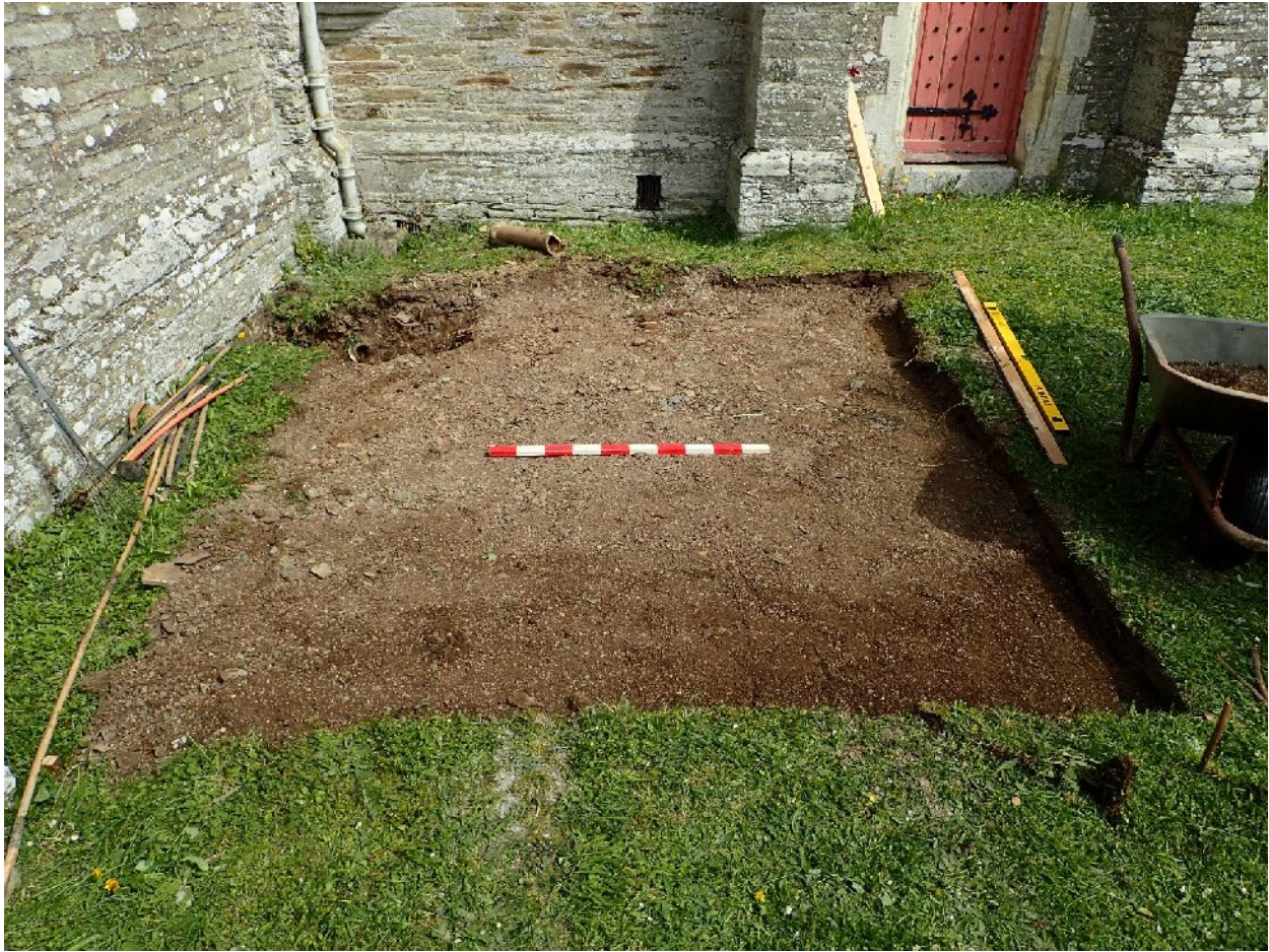
Plate 1. Shed base (facing N; 1m scale)

Any plans or photographs embedded within or attached to this form remain the copyright © of the recorder and must not be reproduced in any publication without the explicit consent of the copyright holder.