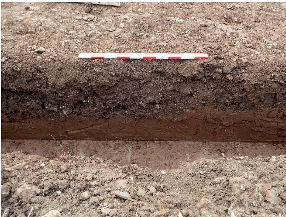
Figure 3. P2 showing modern made ground above alluvial deposit & clay (facing NW)