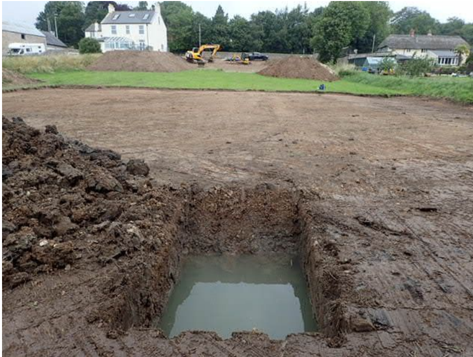
Figure 2. Working shot across stockpiling area with sump in foreground, and terrace for development area in background (facing NW)