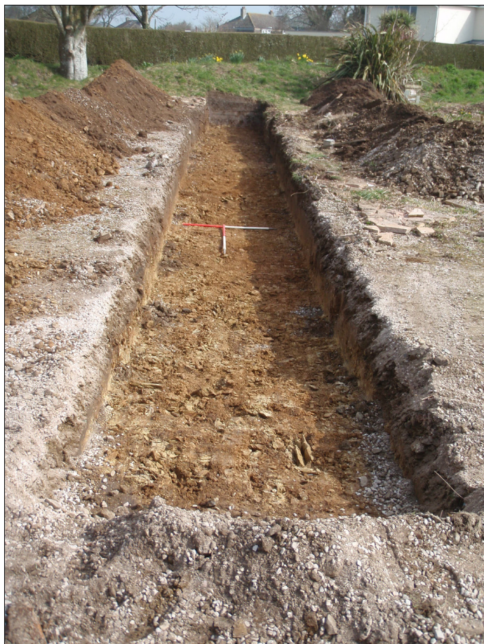
Plate 2. Trench 2, looking southeast, scales 1m.