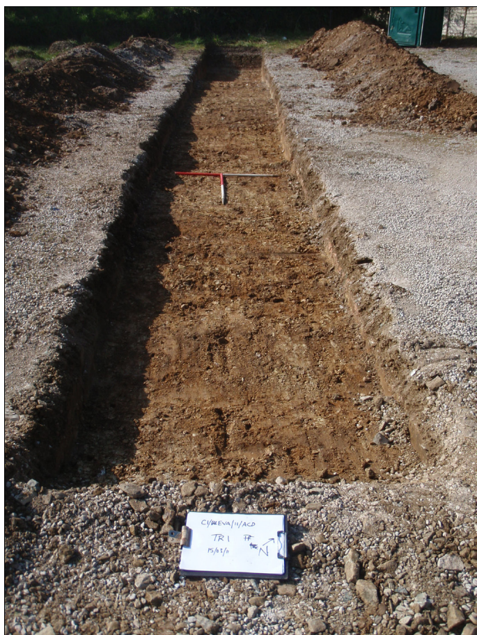
Plate 1. Trench 1, looking northwest, scales 1m.