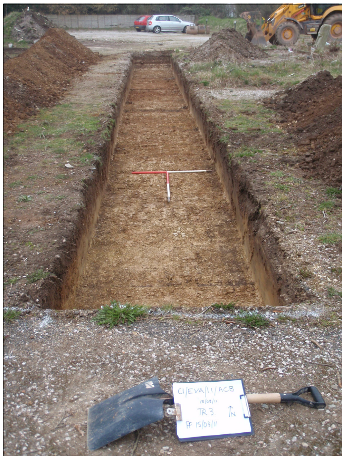
Plate 3. Trench 3, looking north, scales 1m.