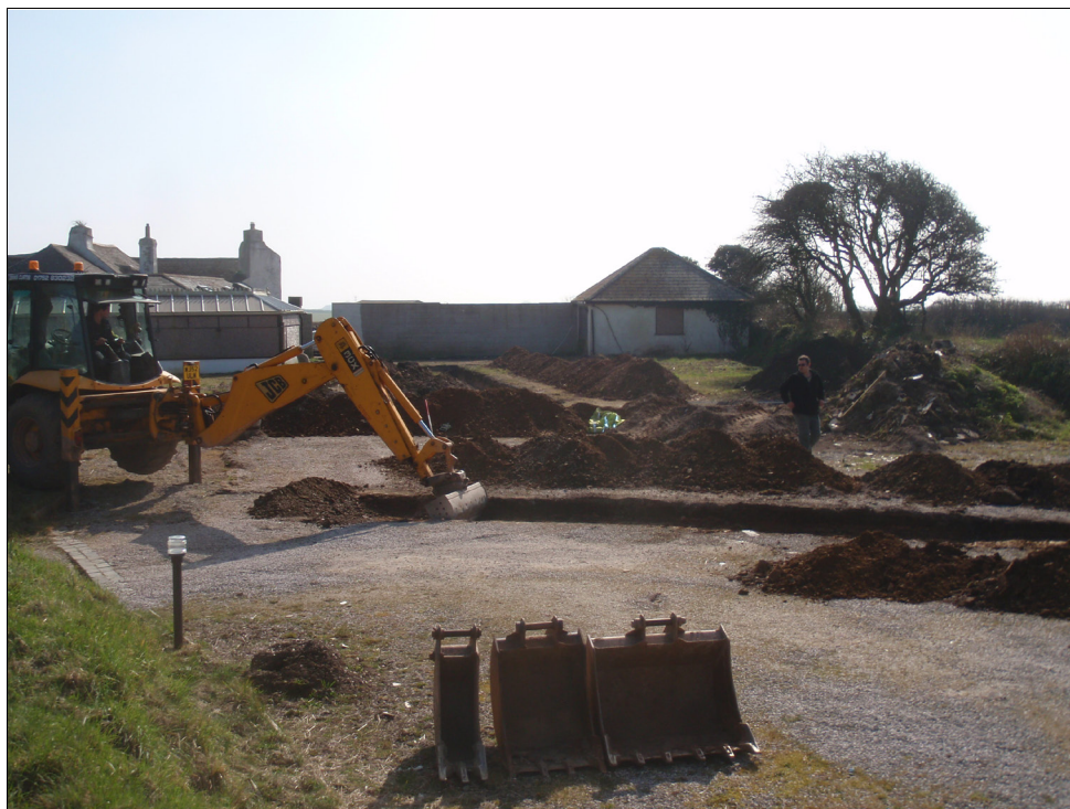
Plate 4. General overview of the site excavations.