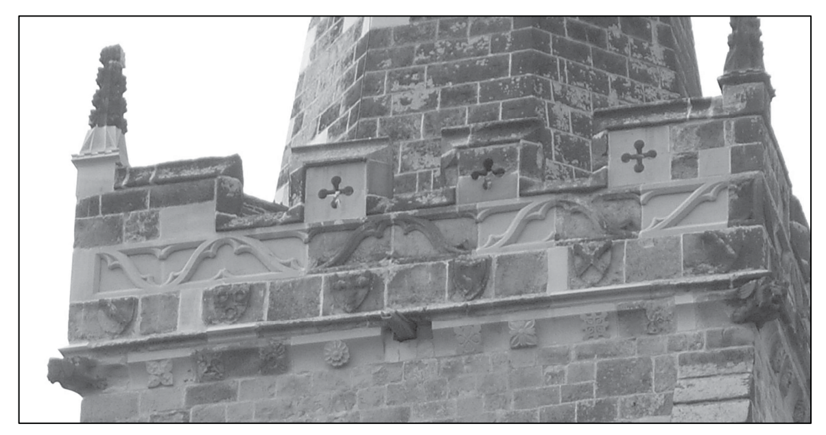
Plate 27: South face of parapet, after restoration.