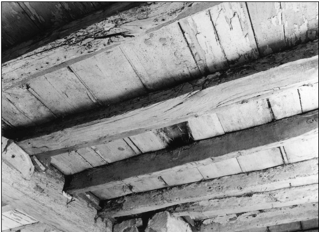
Plate 13: Building B2, east cell, 17th century floor frame, looking north-east (photo 4/16).