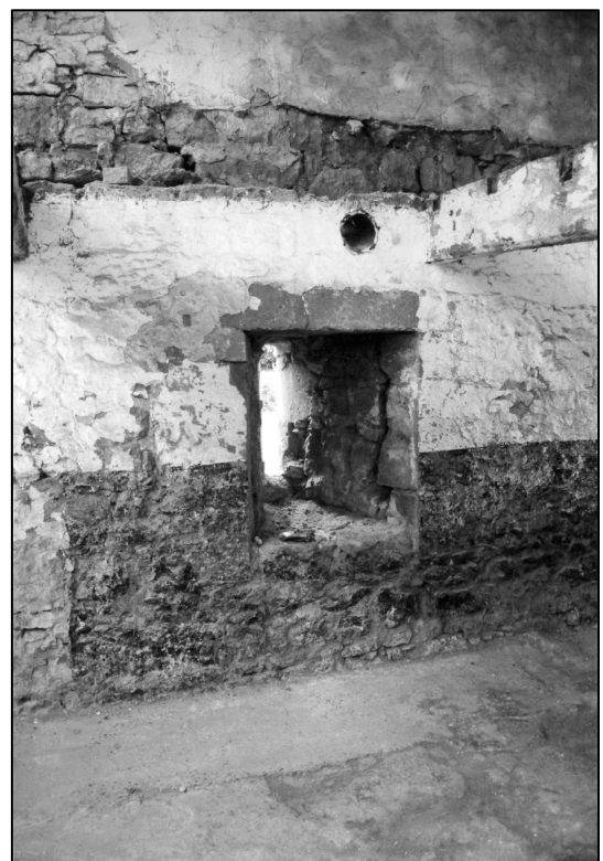
Plate 11: Building B1, ground floor, unblocked window in south wall, looking south (photo 13/16a).