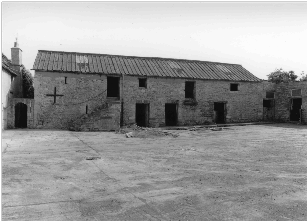
Plate 7: South range (Buildings B1 to B3), north elevation, looking south (photo 7/5).