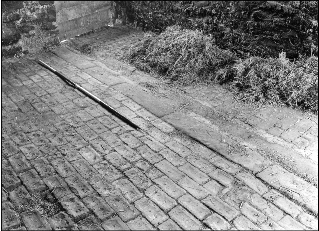
Plate 12: Building B2, ground floor, east cell, brick paving and drain, looking north-east (photo 3/6).