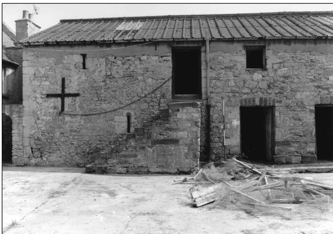
Plate 8: Building B1, north elevation, looking south (photo 7/6).