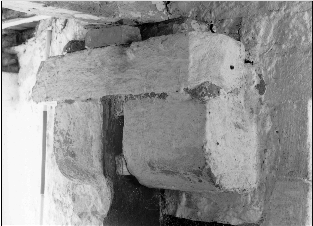
Plate 9: Building B1, ground floor, corbels in south wall, looking north-west (photo 2/17).