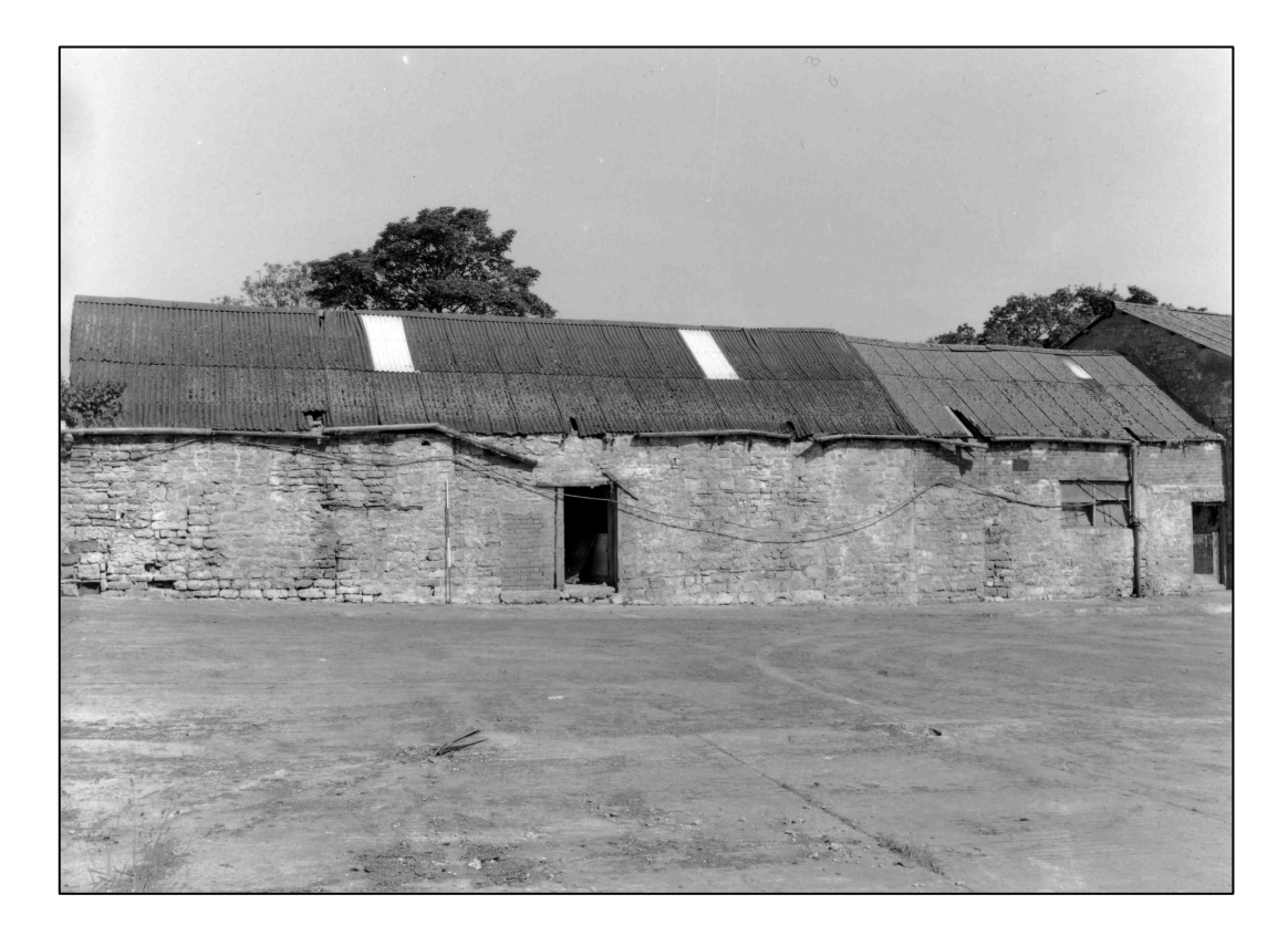
Plate 17: Buildings D1 and D2, south elevation, looking north (photo 1/6).