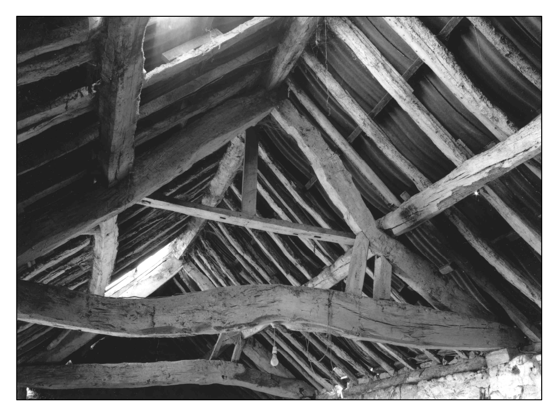
Plate 18: Building D1, east face of east truss, looking west (photo 5/11).