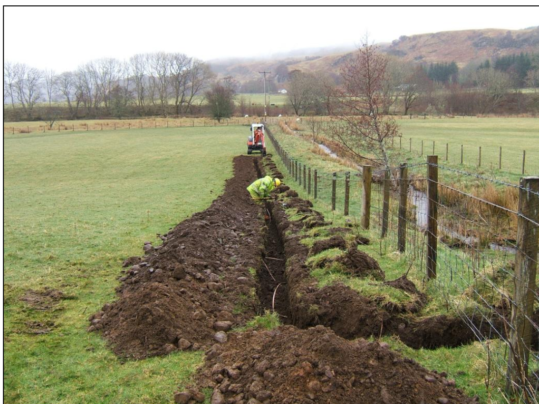
Earth cable trench viewed from the south-west