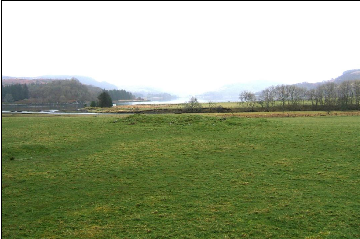
Dunan Buaig viewed from the south

The cairn's Scheduled Ancient Monument number is SAM3996; the monument number attributed to it by the Royal Commission on the Ancient and Historical Monuments of Scotland (RCAHMS) is NM82SW 17. The cable trench was located some 100m from Dunan Buaig in an area where there could conceivably be satellite burials, the trench's proximity to the monument prompting the watching brief. The site is also close to the former location of a standing stone (NM82SW 13) which once stood on the bank of the Euchar at NM 8250 2207 but which has since been removed. In addition, Kilninver was the site of the Church of Saint Bean (SAM4191; NM82SW 20), built in the 13th century at NM 8265 2178, some 300m south-east of the cable trench.