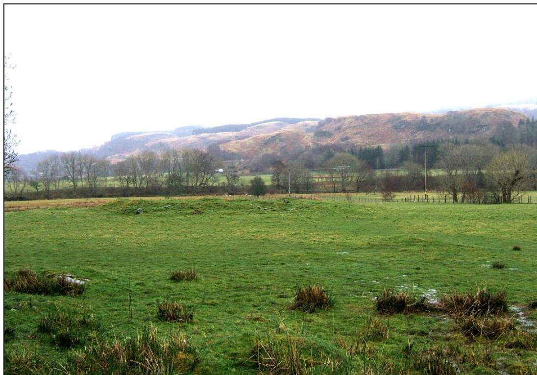
Dunan Builaig viewed from the south-west with Pole 8 on the right