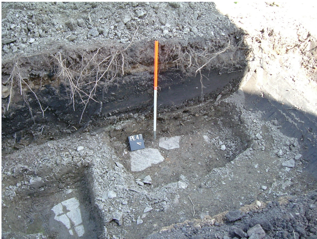
Flagstone surface and wall foundations (in foreground) in Trench A