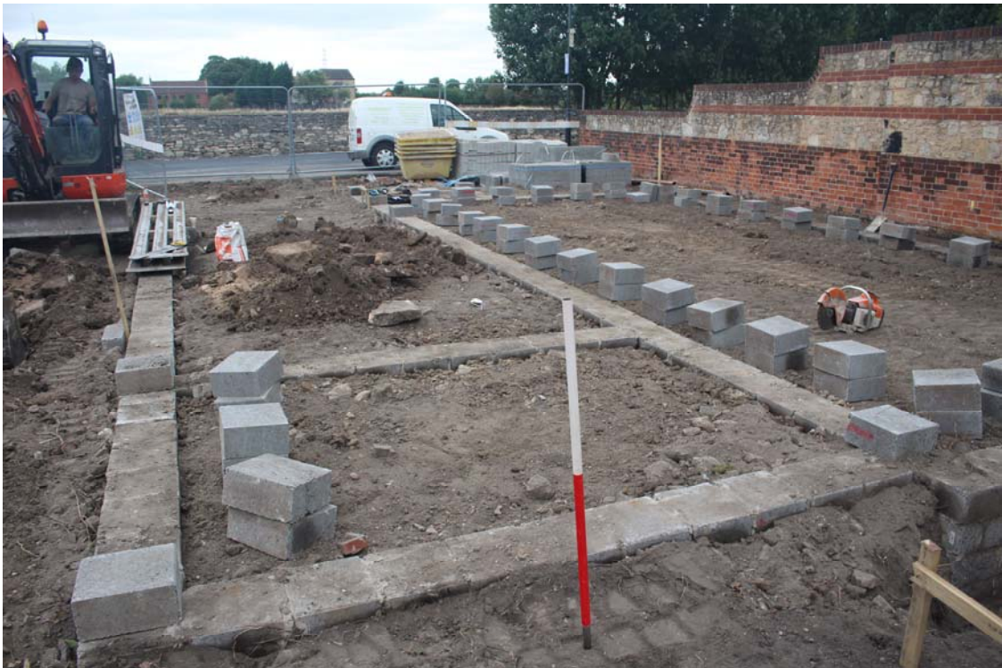
Plate 10: view of the construction phase (plot 1), looking north northwest