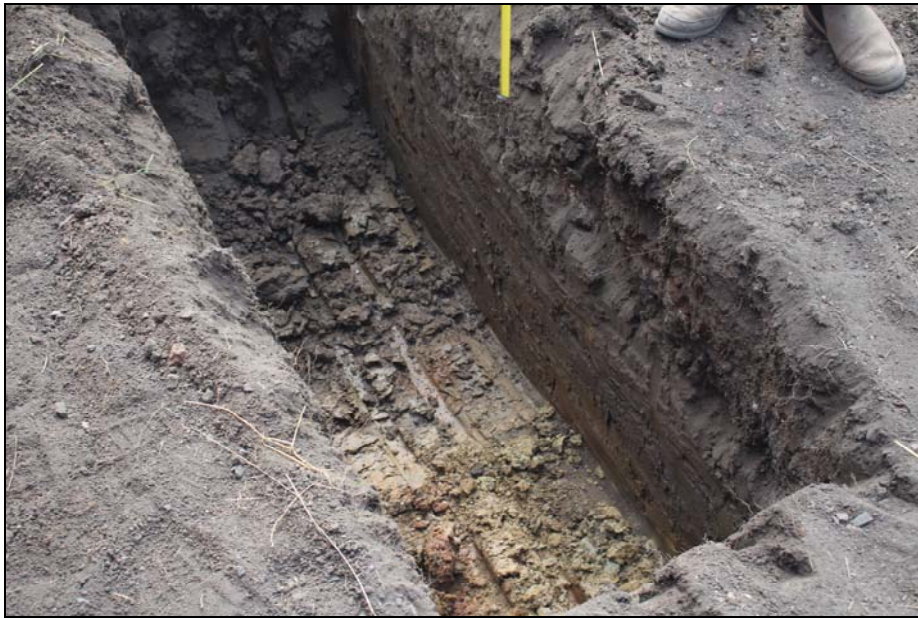
Plate 3: Start of the trench excavations (plot 1), looking southeast