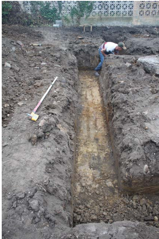
Plate 7: post-excavation view of plot 2, south-eastern trench, looking southwest