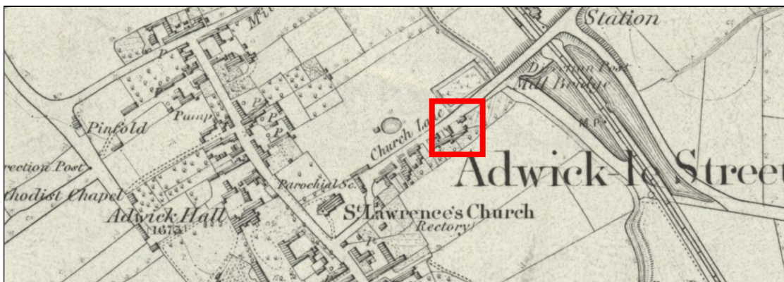
1 st Ed OS map 1848-1852, showing the site to the SE of Church Lane