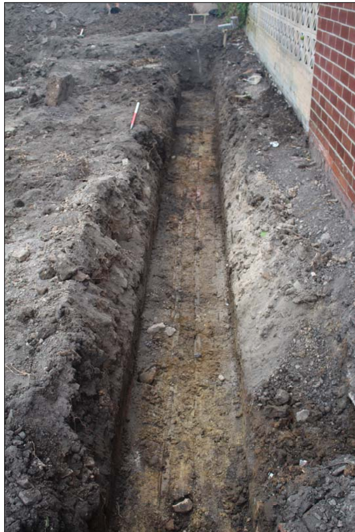
Plate 6: post-excitation view of plot 2, southwestern trench, looking southeast