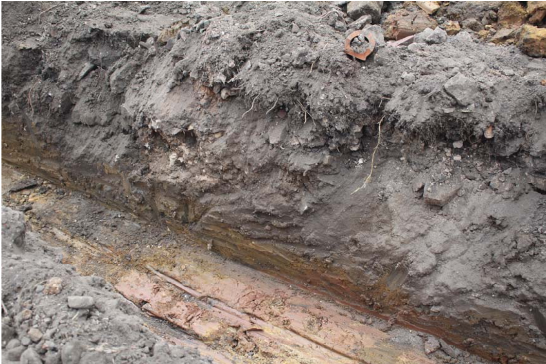
Plate 9: detail view of the characteristic stratigraphy (Plot 2), looking southwest