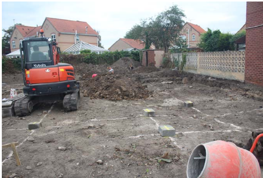
Plate 5: pre-excitation view of plot 2, looking southeast