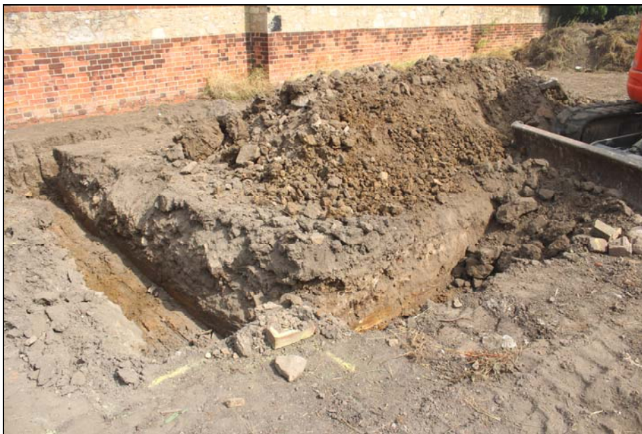
Plate 4: working view plot 1, looking east