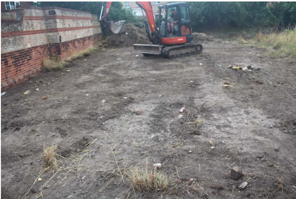
Plate 2: Pre-excitation view of the site plot 1, looking southeast