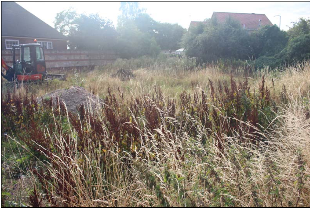
Plate 1: Pre-excitation view of the site, looking south