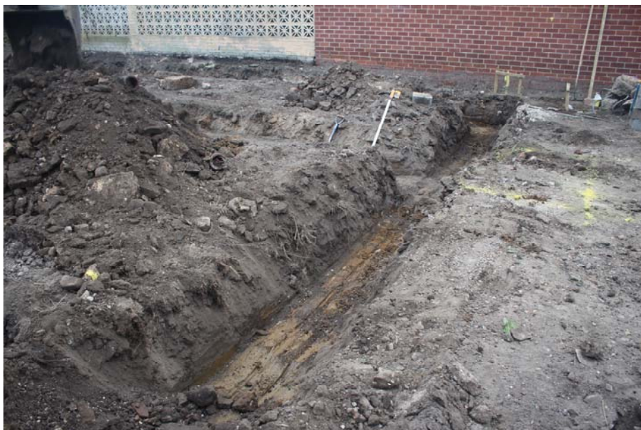
Plate 8: post-excavation view of plot 2, north-western trench, looking southwest