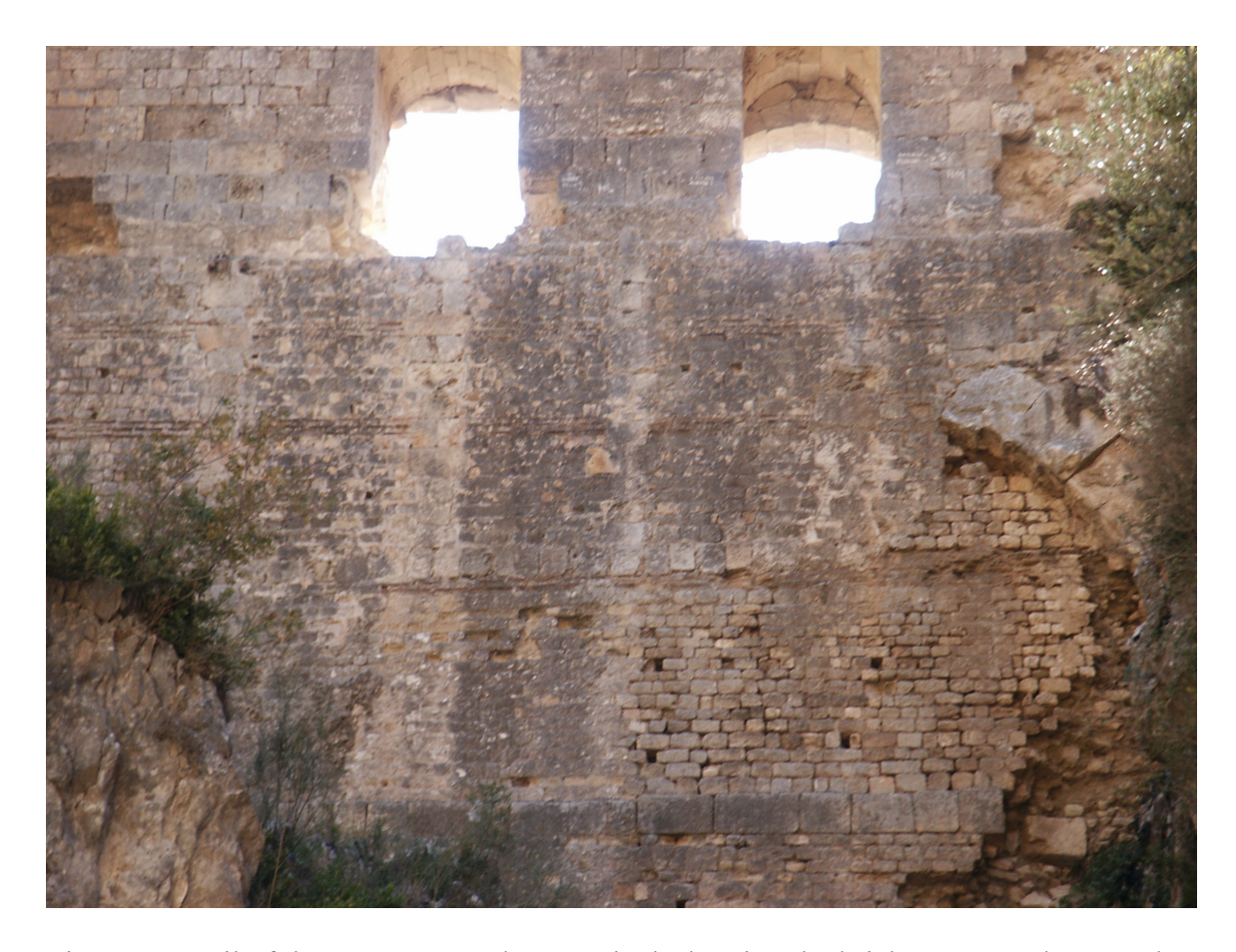
Fig. 4.8: Detail of the 'Iron Gates' dam, Antioch showing the brick courses.