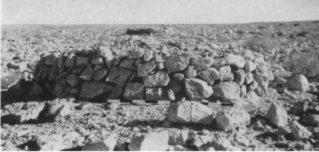
Fig. 5.31: Flowerpot mound near Sbeitheh, Israel [Mayerson 1959, pl. 4].