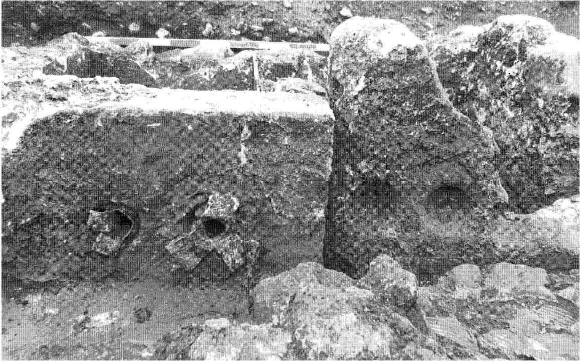
Fig. 7.9: The conical side of the calices; lead pipes (left); carved holes (right), Banias [Hartal 2002, fig. 14].