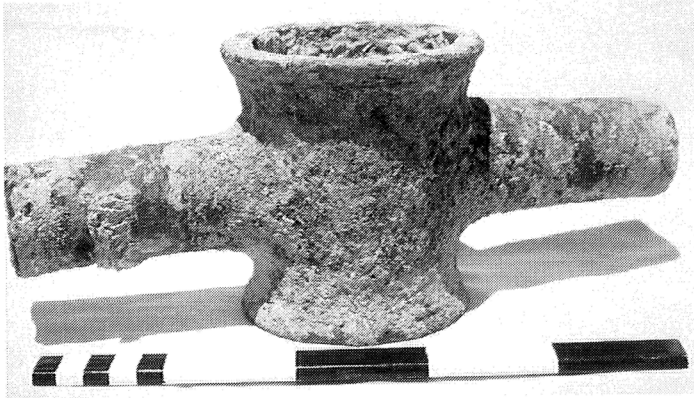
Fig. 7.34: Bronze stopcock, Humayma [Oleson 1998, pl.7].