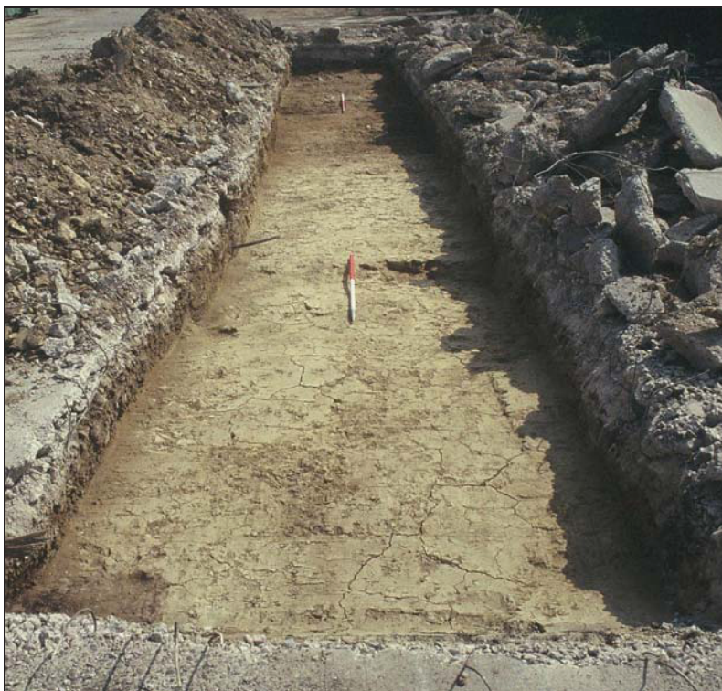
Plate 4: Trench 4, east-facing.