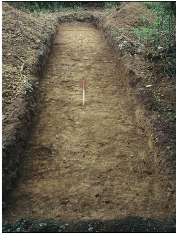
Plate 1: Trench 1, east-facing.