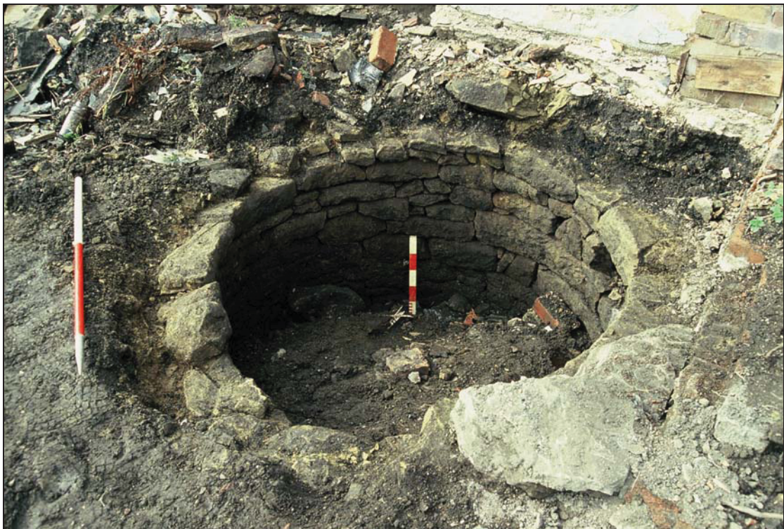
Plate 16: Well [505], southwest facing.