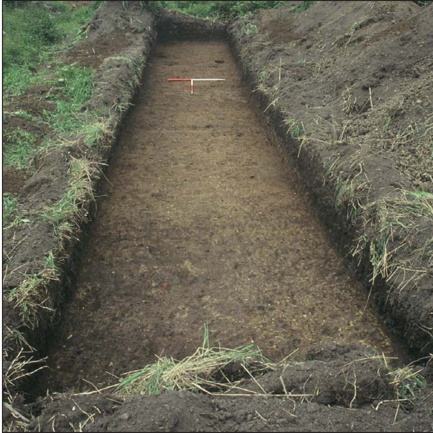
Plate 13: Trench 9, west-facing.