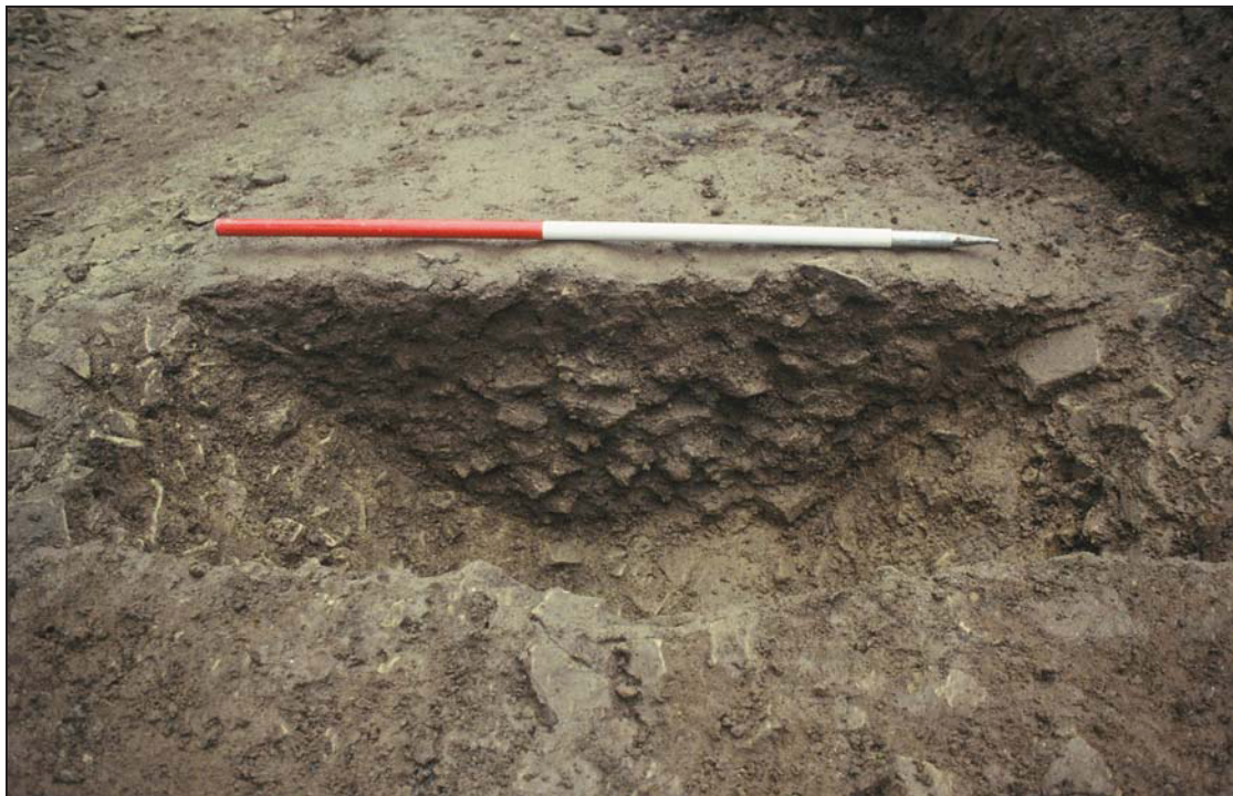
Plate 6: Section through ditch [502], east-facing shot.