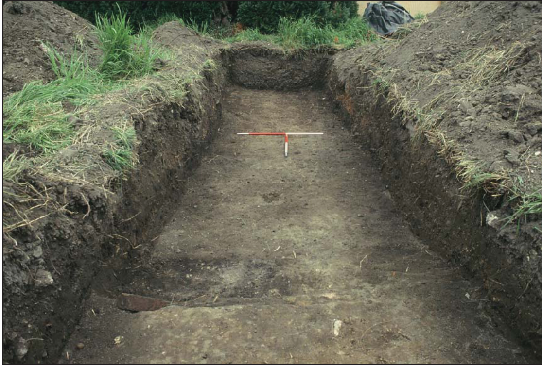
Plate 15: Trench 10, north-facing.