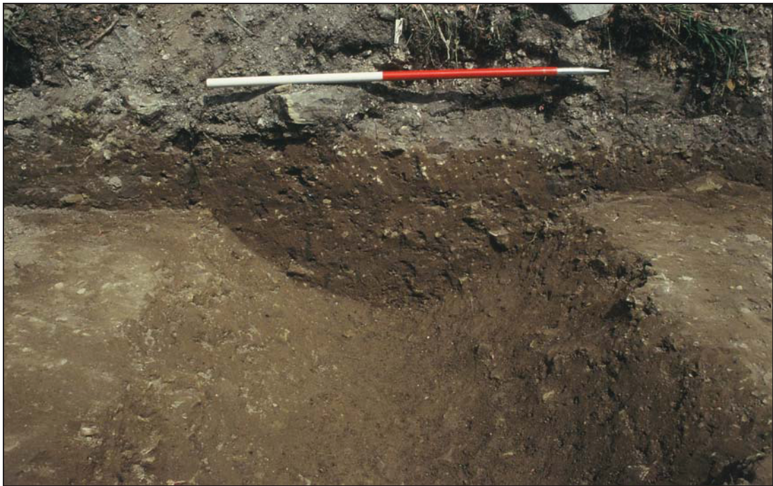
Plate 12: Section through ditch [805], Trench 8.