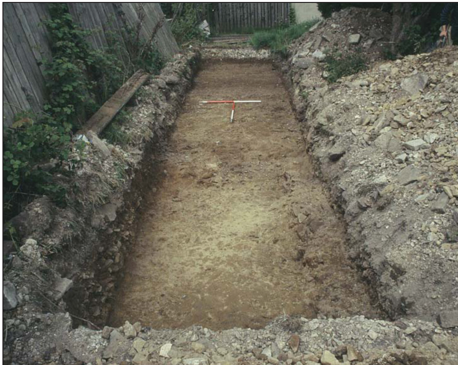
Plate 10: Trench 8, north facing.