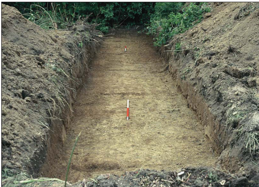
Plate 2: Trench 2, east-facing.