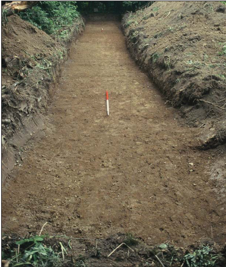
Plate 3: Trench 3, south east-facing.