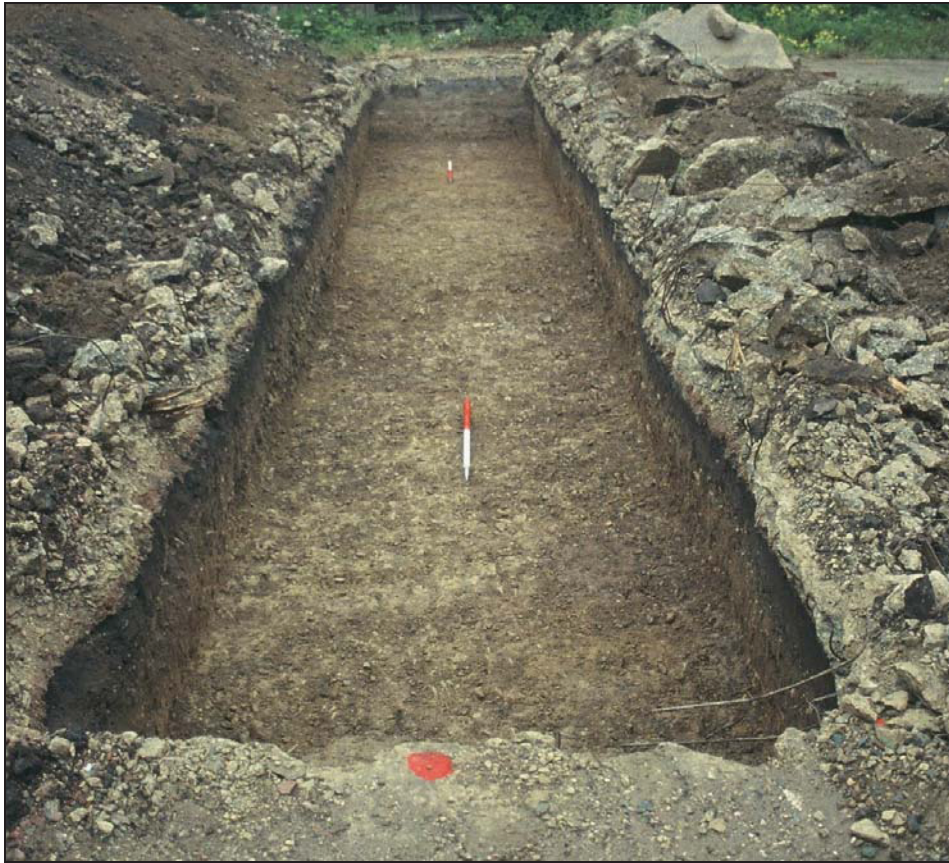
Plate 9: Trench 7, east facing.