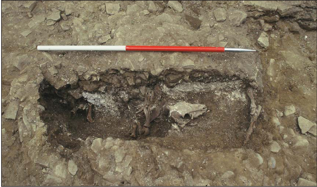
Plate 11: Pig skeleton in cut [803], Trench 8.