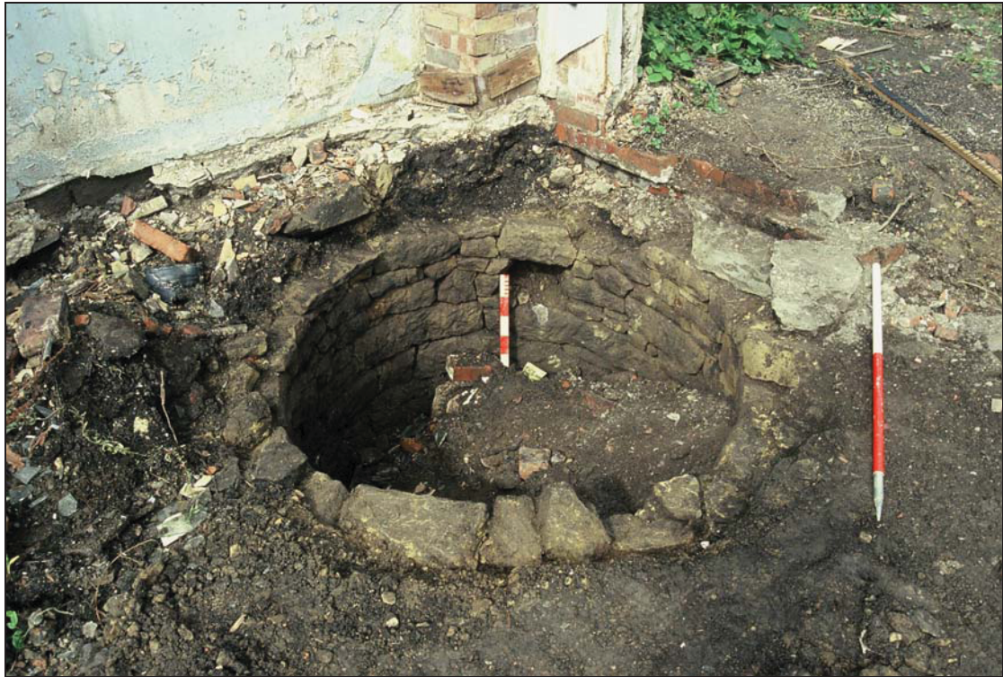
Plate 17: Well [505], northwest facing.