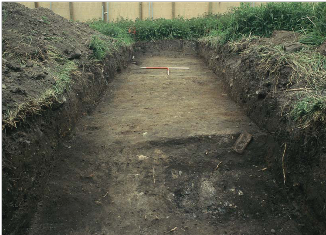
Plate 14: Trench 10, south-facing.