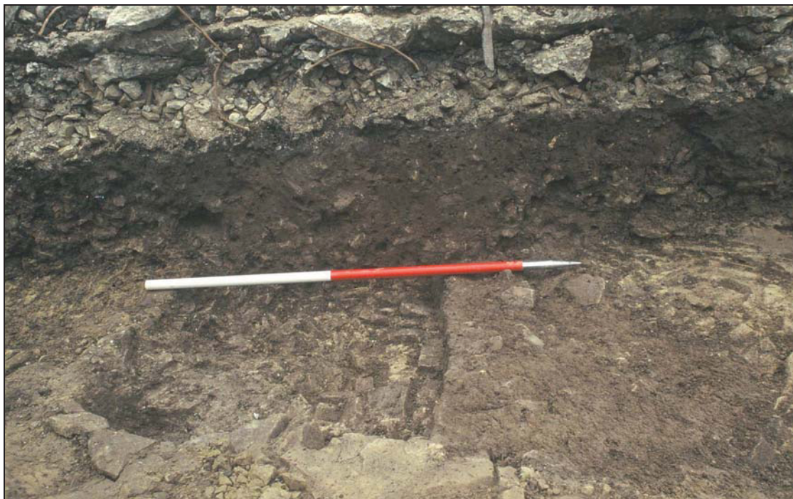
Plate 8: Trench 6, east-facing section through feature [602].