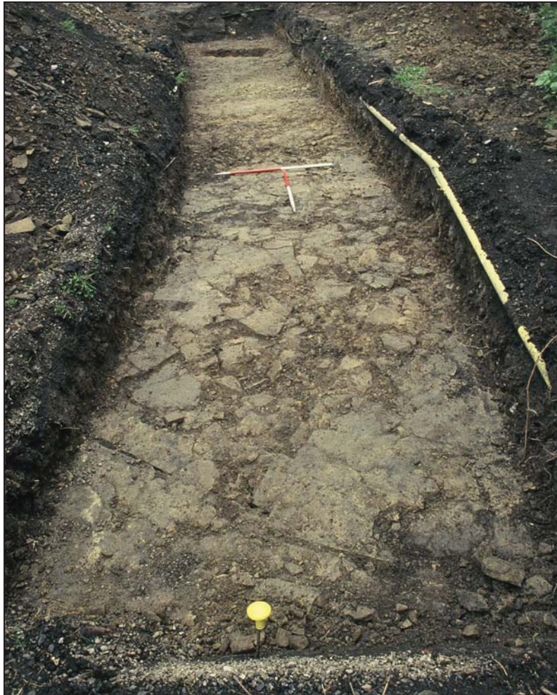
Plate 5: Trench 5, west-facing.