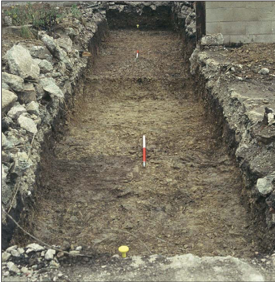
Plate 7: Trench 6, north-facing.