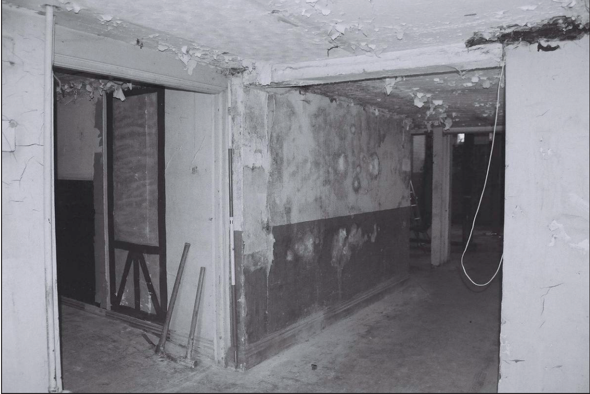
Plate 13: General view of G7 (film 11.31)