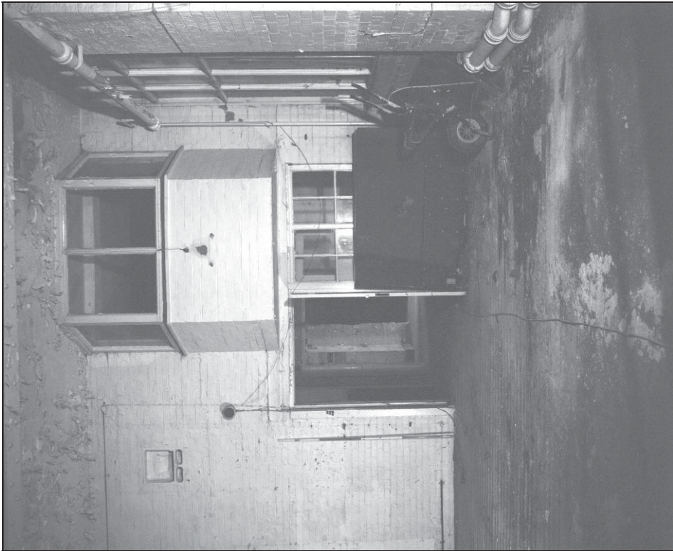
Plate 19: View from ground floor room G3 looking at mezzanine floor window M4 (film 4.4)