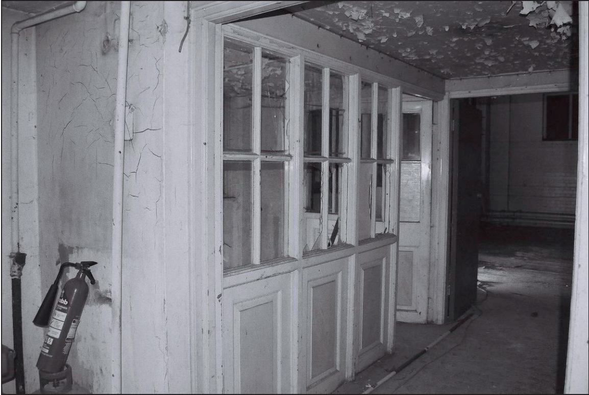
Plate 15: General view of G2 from G1 (film 11.26)