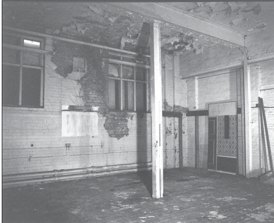
Plate 17: General view of room G3 (film 4.1)