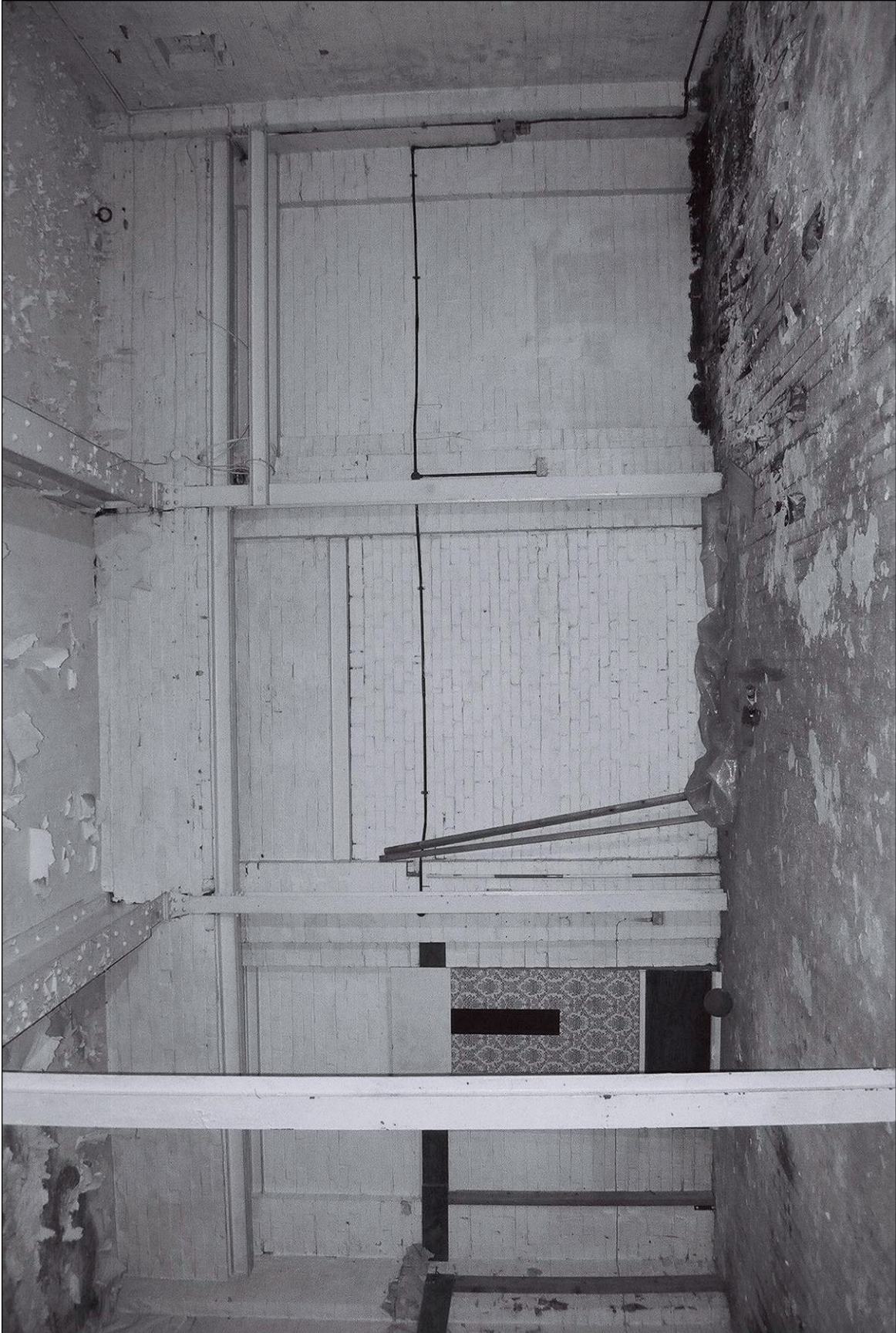
Plate 18: General view of southeast wall of G3 showing blocked openings (film 11.17)