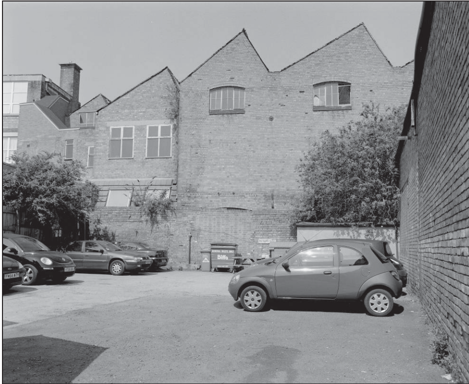
Plate 11: East elevation of building 1 (film 1.8)