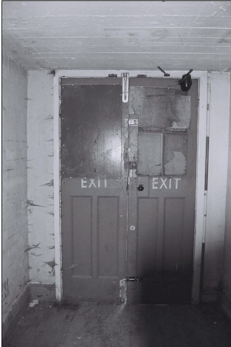
Plate 12: Detail of main doors, G1 (film 11.28)