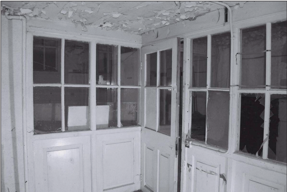
Plate 16: General view of partitions in G2 (film 11.23)