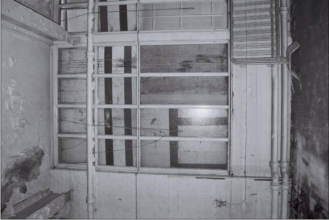
Plate 20: Detail of window within G3 (film 11.5)