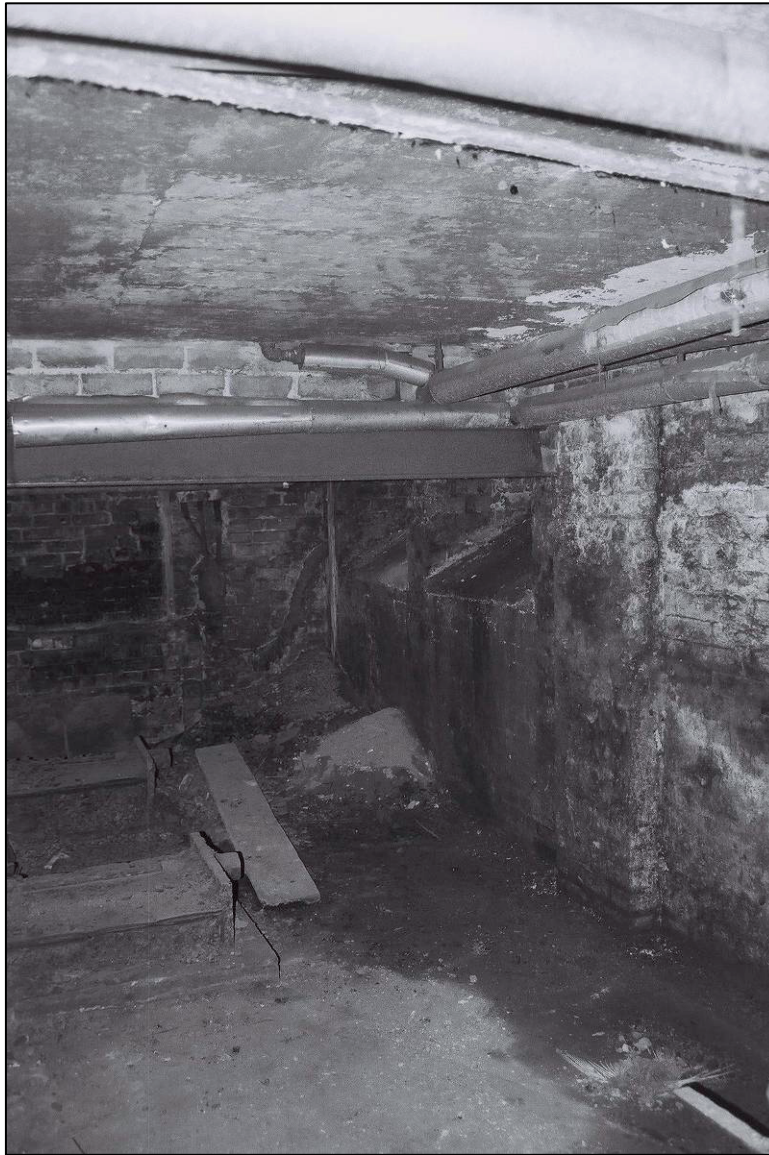
Plate 33: General view of C3 (film 12.7)