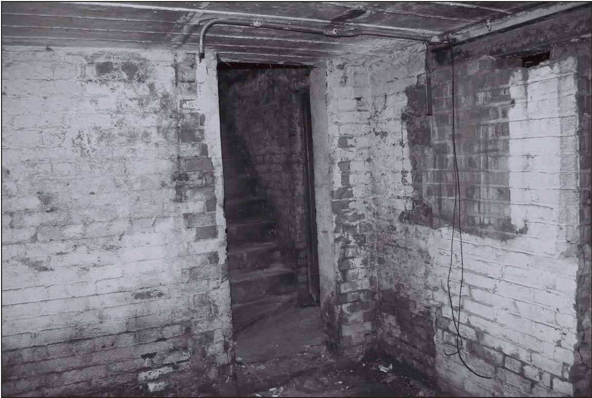
Plate 32: General view of C1 (film 12.8)