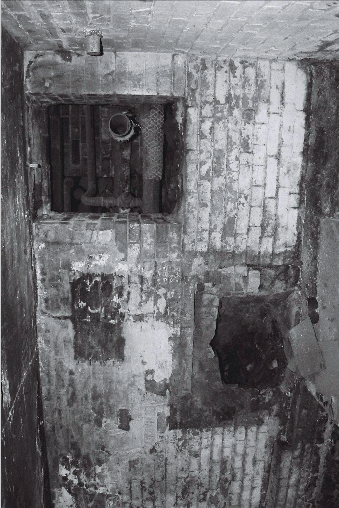
Plate 38: General view of southwest wall of C2 showing pipe work (film 13.23)