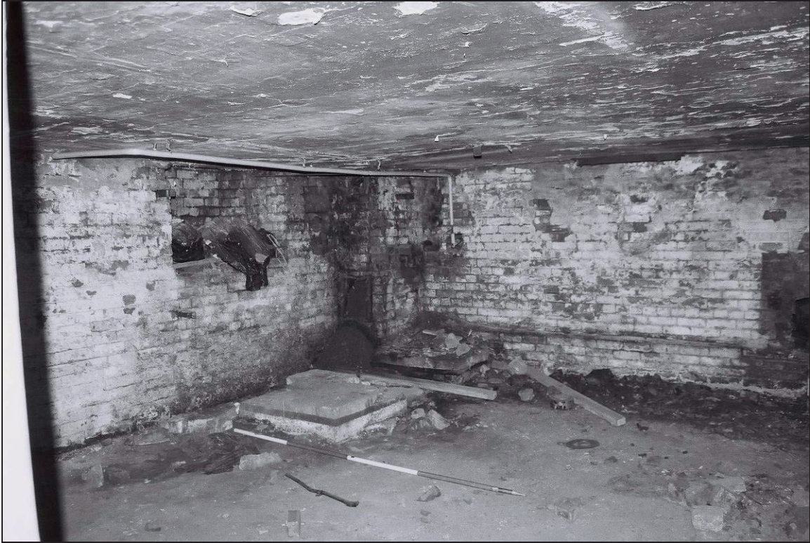
Plate 36: General view into C2, boiler room (film 12.1)