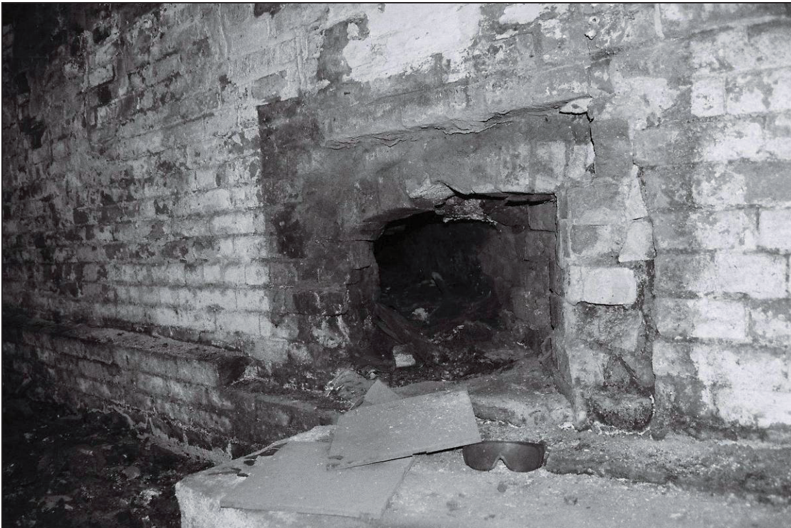
Plate 37: Detail of piping within southwest wall of C2 (film 13.25)