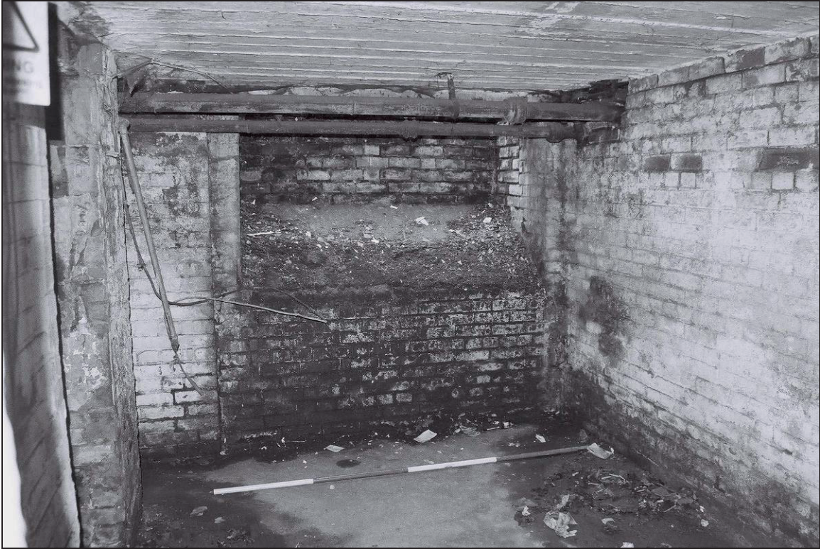
Plate 34: General view of C1 (film 12.10)