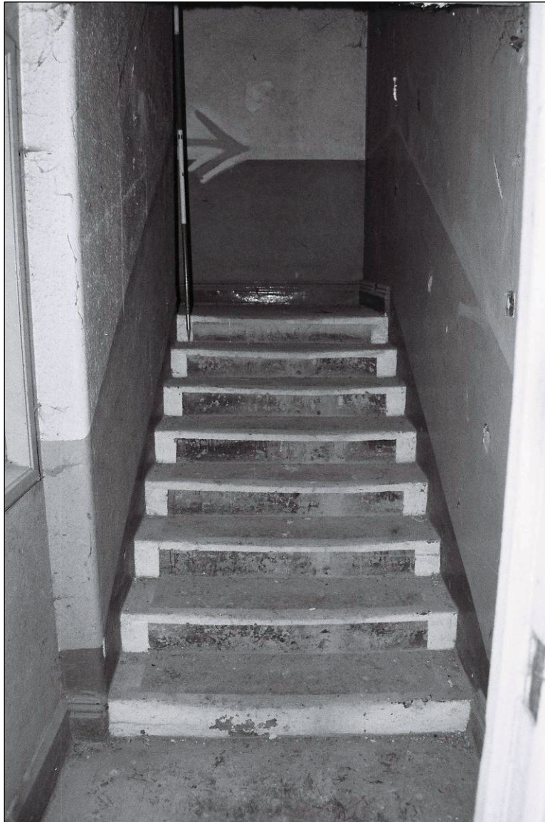
Plate 39: View of stairway, from ground floor (film 13.21)