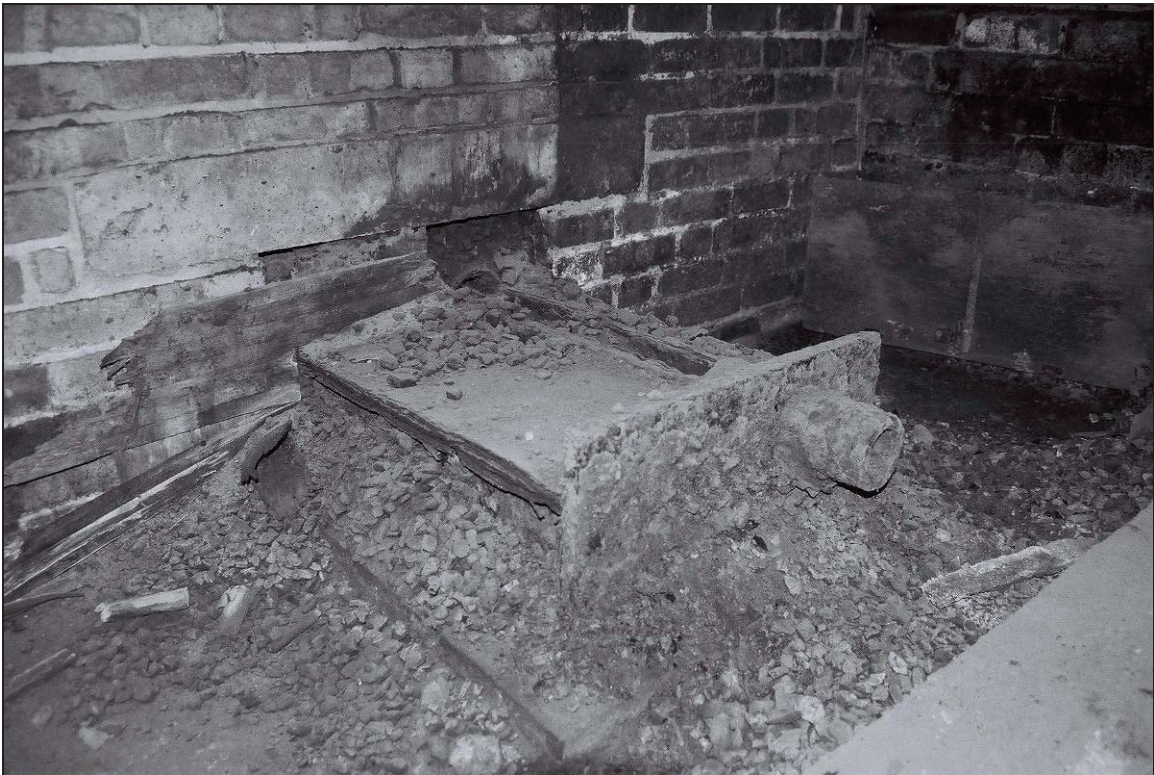
Plate 35: Detail of machine base in C3 (film 12.3)