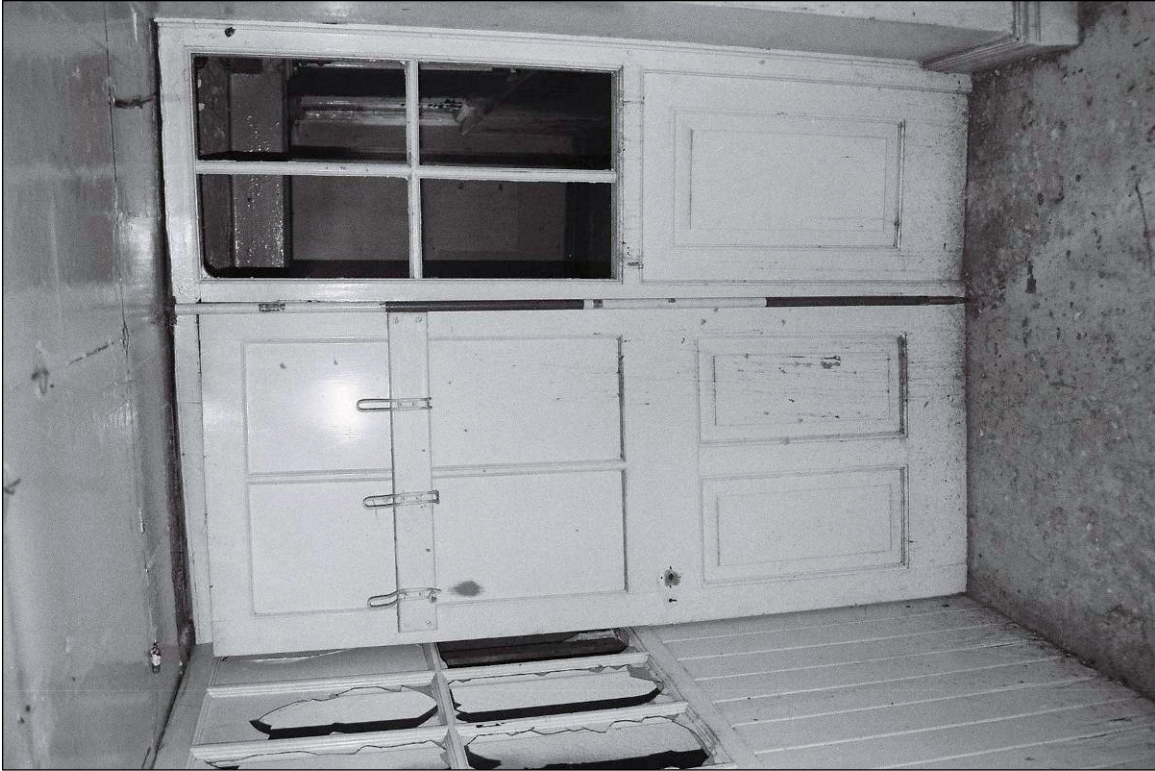
Plate 42: Detail of door and partition, M2 (film 13.16)