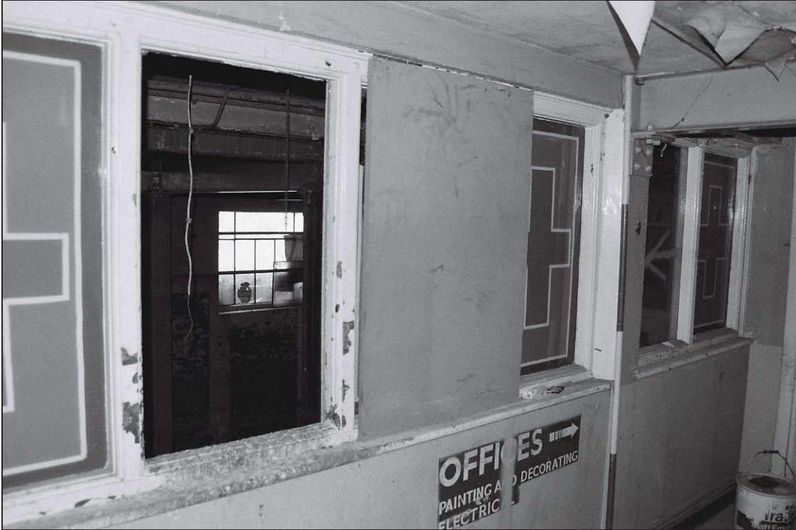
Plate 40: General view of windows on mezzanine floor overlooking G5 (film 13.19)