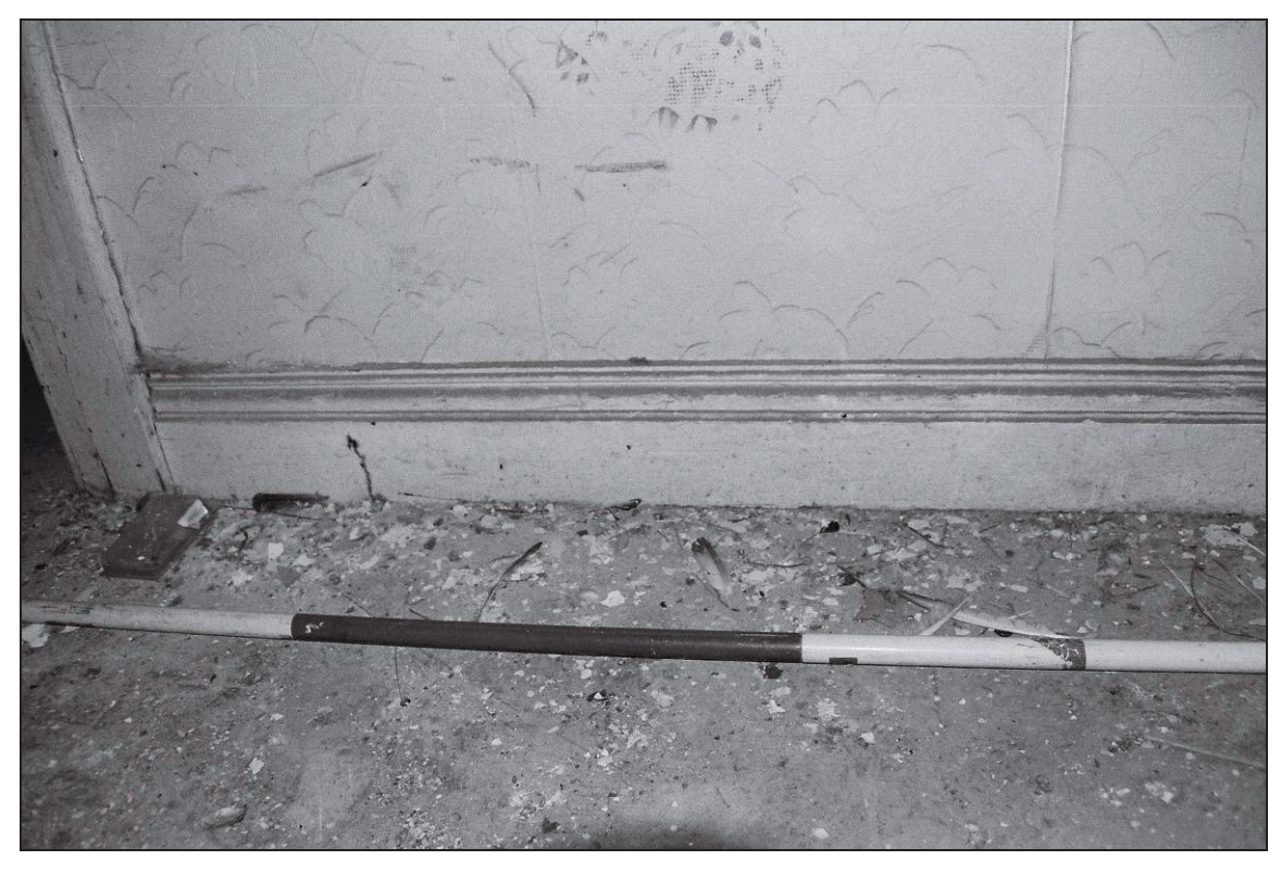
Plate 44: Detail of skirting board, corridor of mezzanine floor (film 13.11)