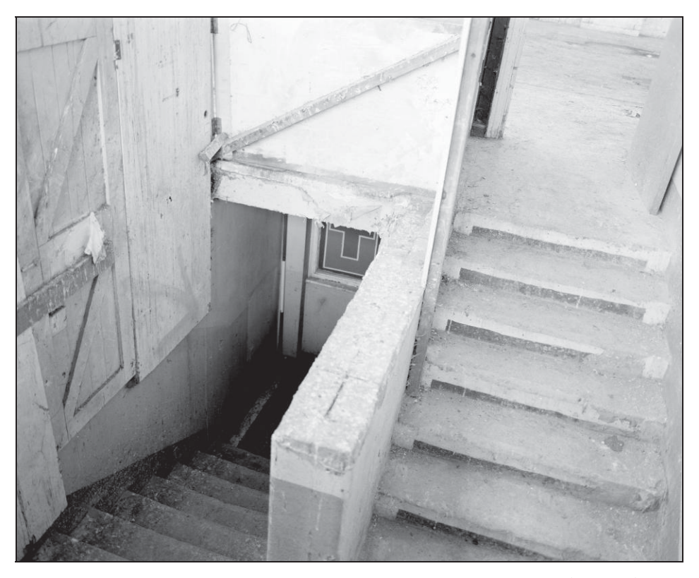
Plate 49: View down stairwell towards mezzanine floor (film 8.1)