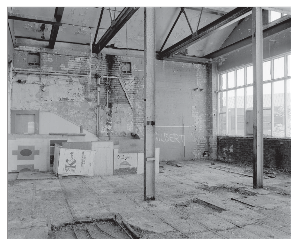
Plate 50: View across room F1 looking towards stairwell (film 8.5)