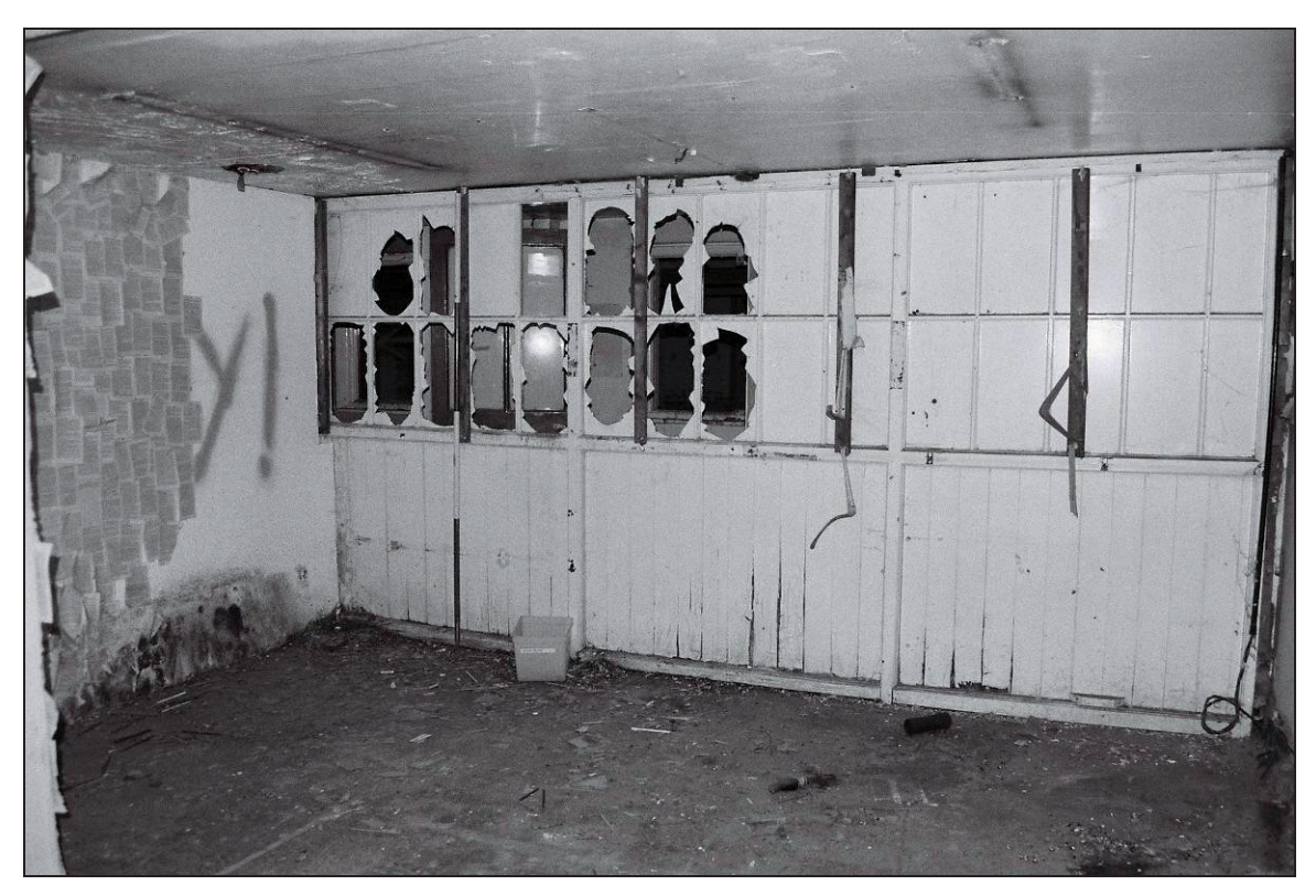
Plate 45: General view of M3 showing glazed partition (film 13.8)