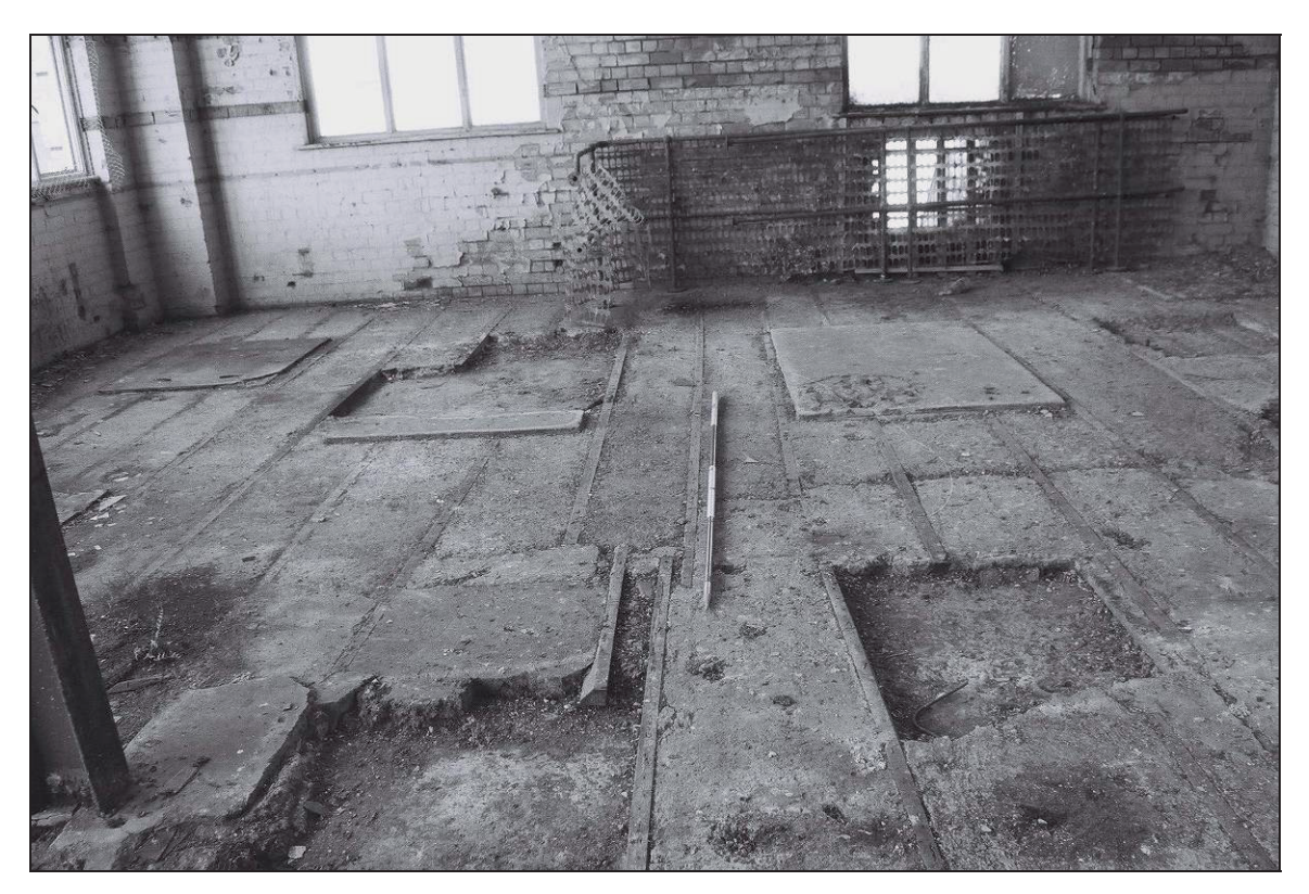
Plate 52: Detail of machine base scars in floor of F1 (film 14.31)