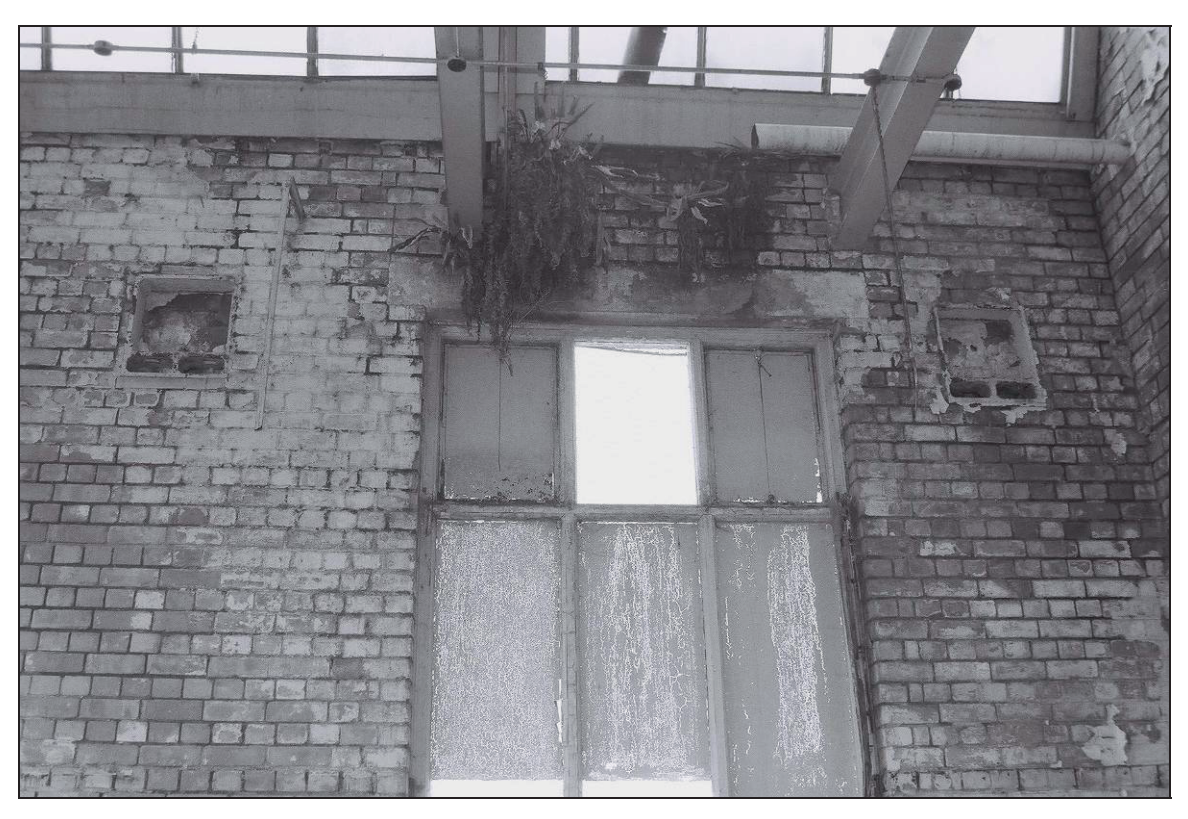
Plate 53: Detail of wall boxes in northeast wall of F1 (film 14.28)