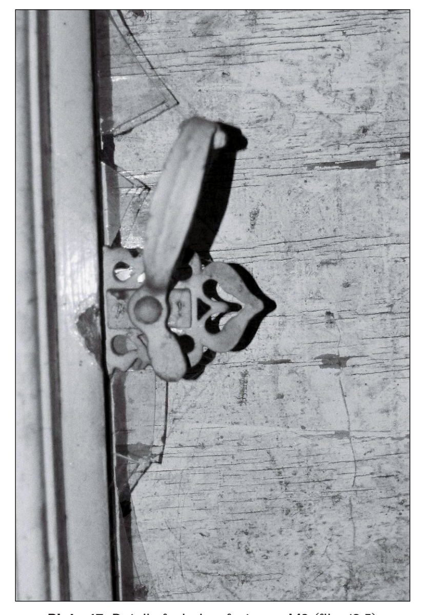
Plate 47: Detail of window fastener, M3 (film 13.5)