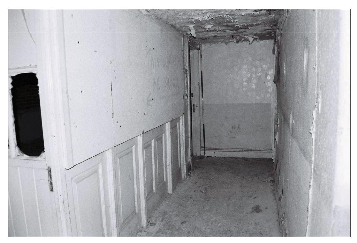
Plate 43: General view of mezzanine corridor showing paneled partition (film 13.12)