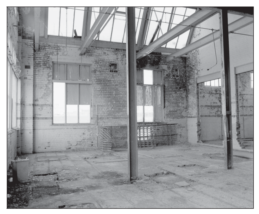
Plate 51: View across room F1 (film 8.3)