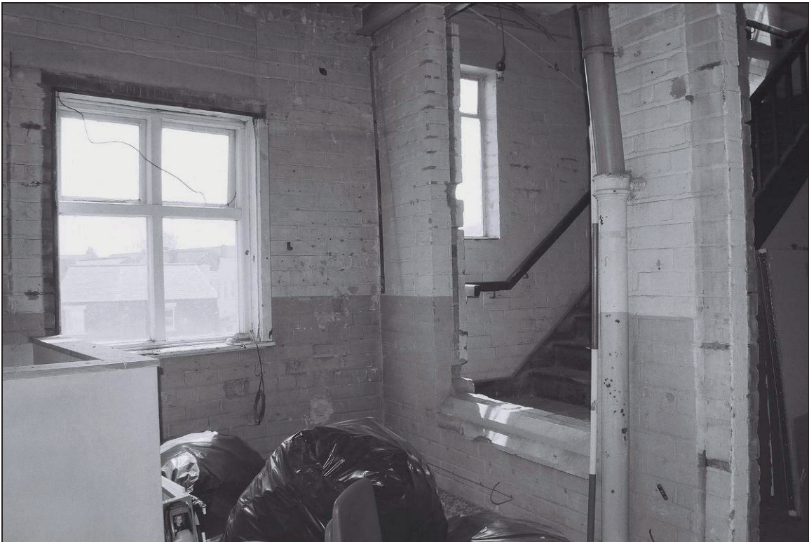
Plate 78: Detail of outside sill of window in internal wall (film 10.10)