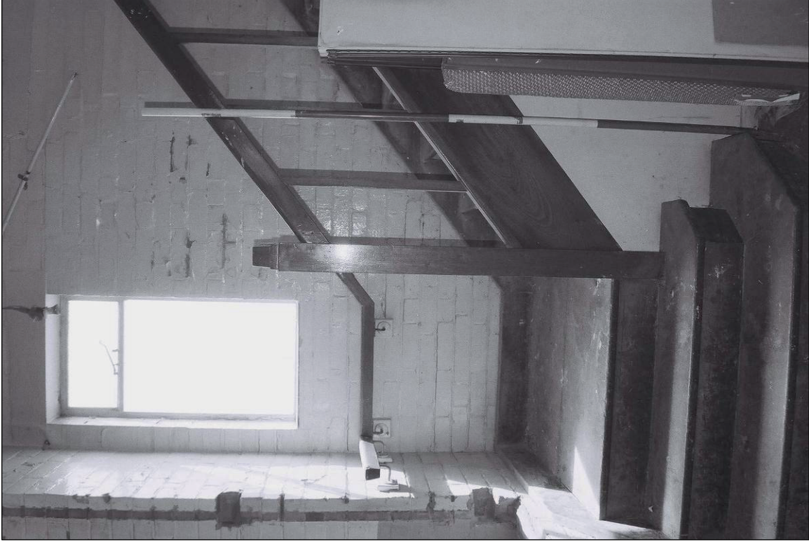
Plate 76: Bottom of stair case at end of 1 st floor room (film 10.3)