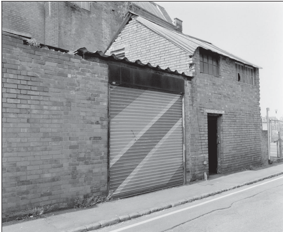
Plate 83: Orchard Street façade of building 2 (film 1.1)