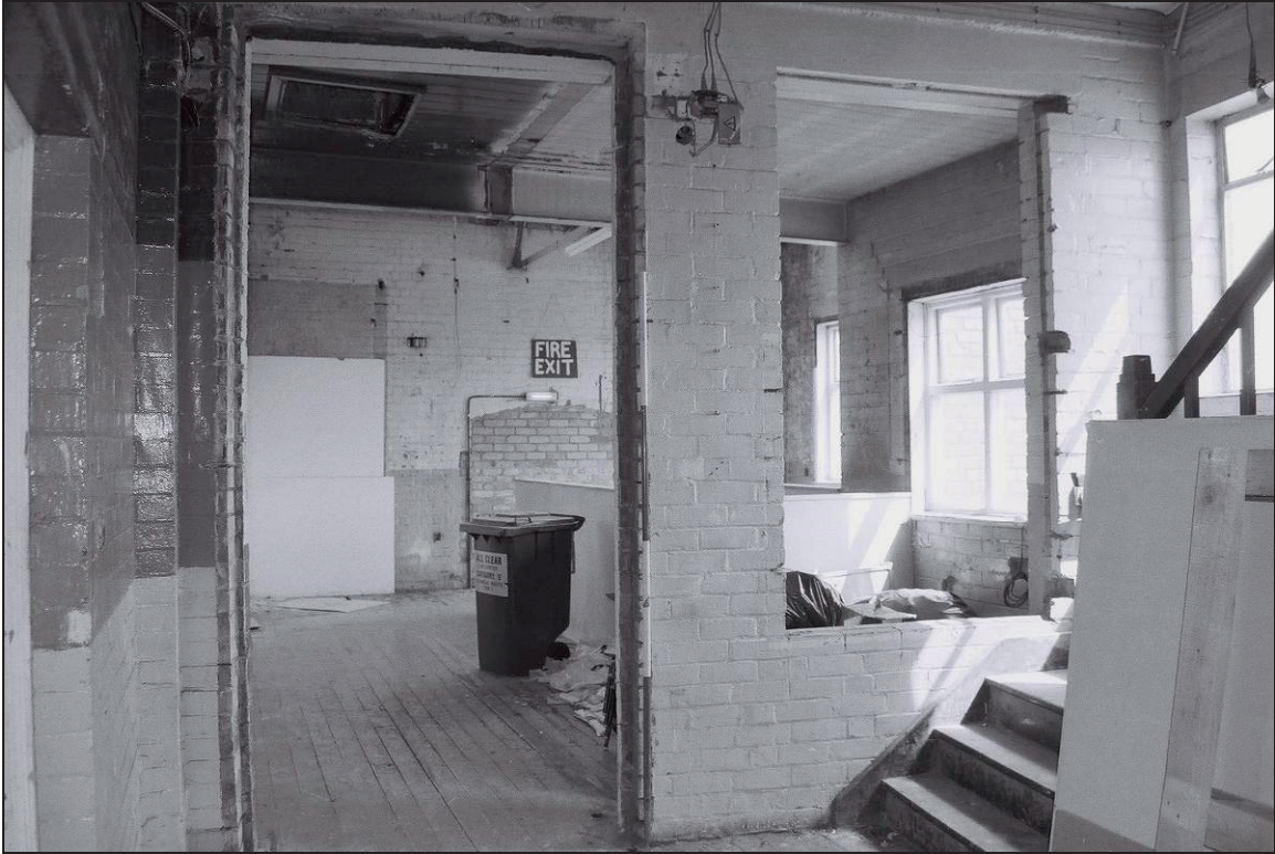
Plate 77: General view of room F5 from F6 (film 10.13)