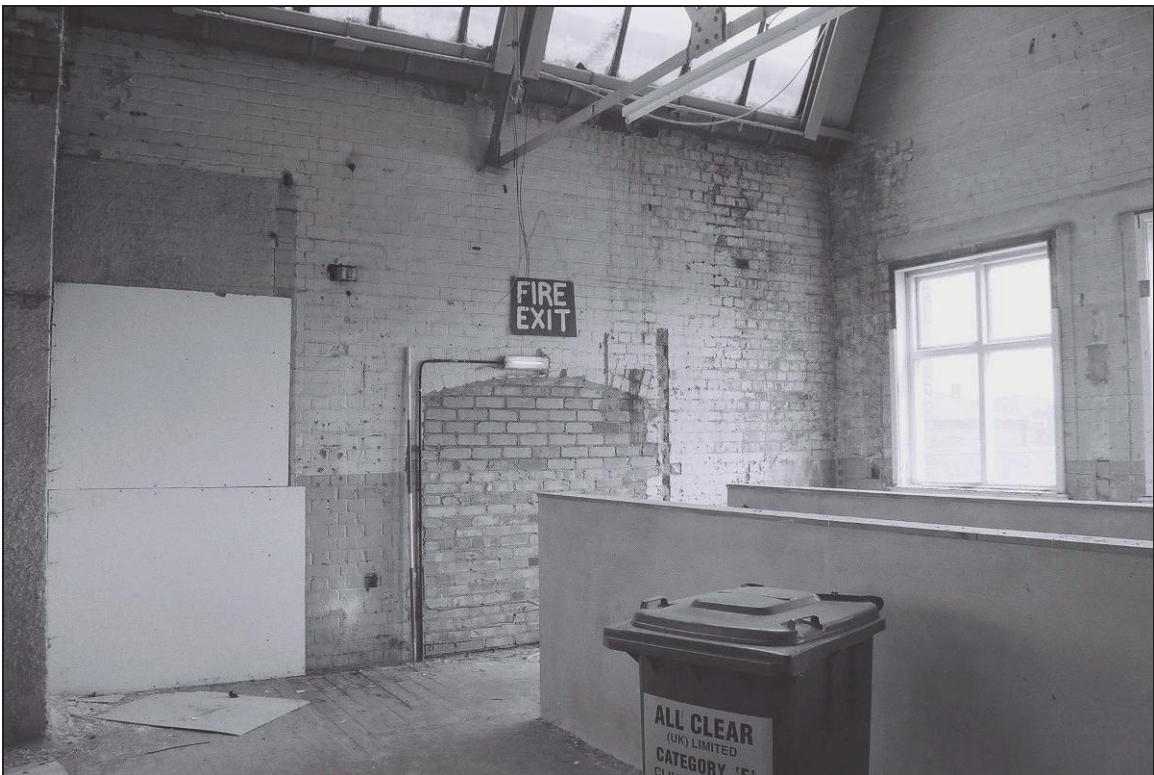
Plate 81: General view of F5 wall with blocked arch (film 10.16)