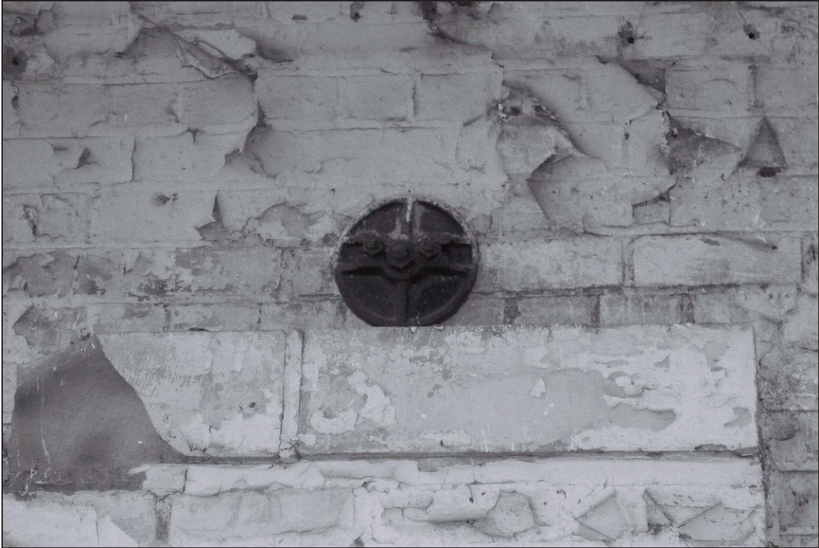
Plate 74: Detail of pad stone and tie plate on top of brick pier (for travelling crane) within F3 (film 15.16)