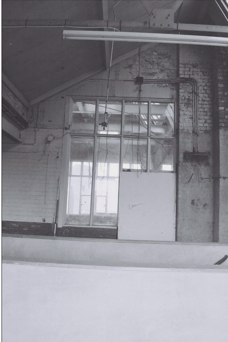
Plate 79: General view of wall and door into room F4 from room F5 (film 10.5)