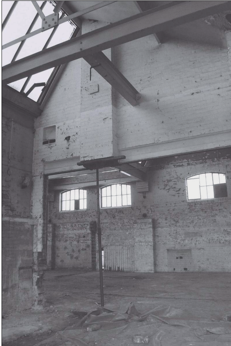
Plate 73: View of southeast wall of F4, with F3 beyond (film 15.19)