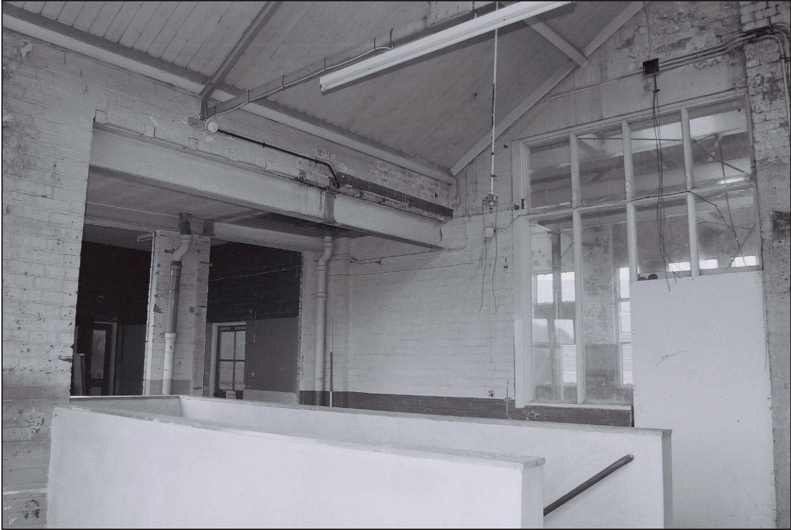
Plate 80: General view of room F5 (film 10.14)