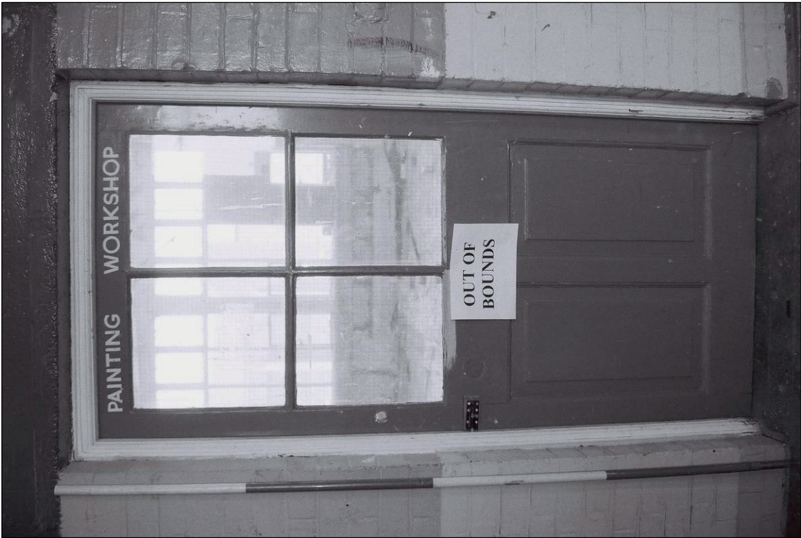
Plate 75: View of original door into room F4 from room F5 (film 10.1)