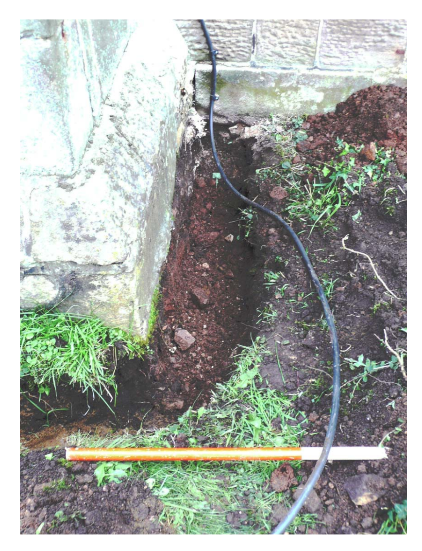
Plate 5 Trench where it met the northeast wall