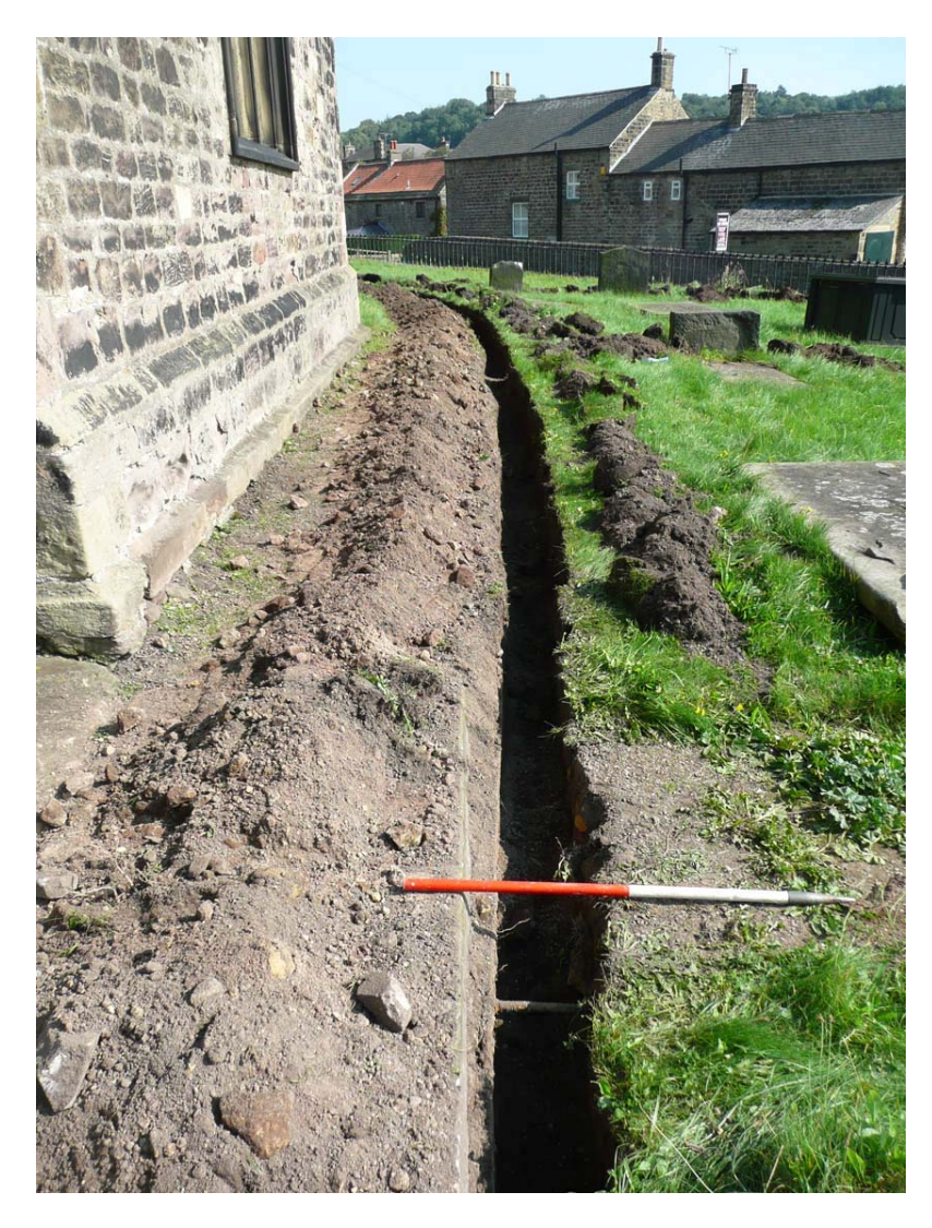
Plate 3 Trench to the east of the church