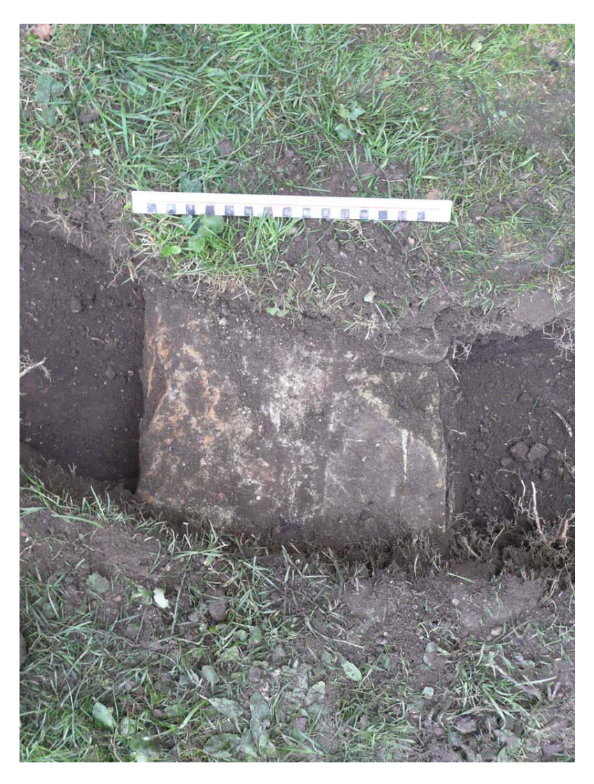
Plate 7 Sandstone block [101]