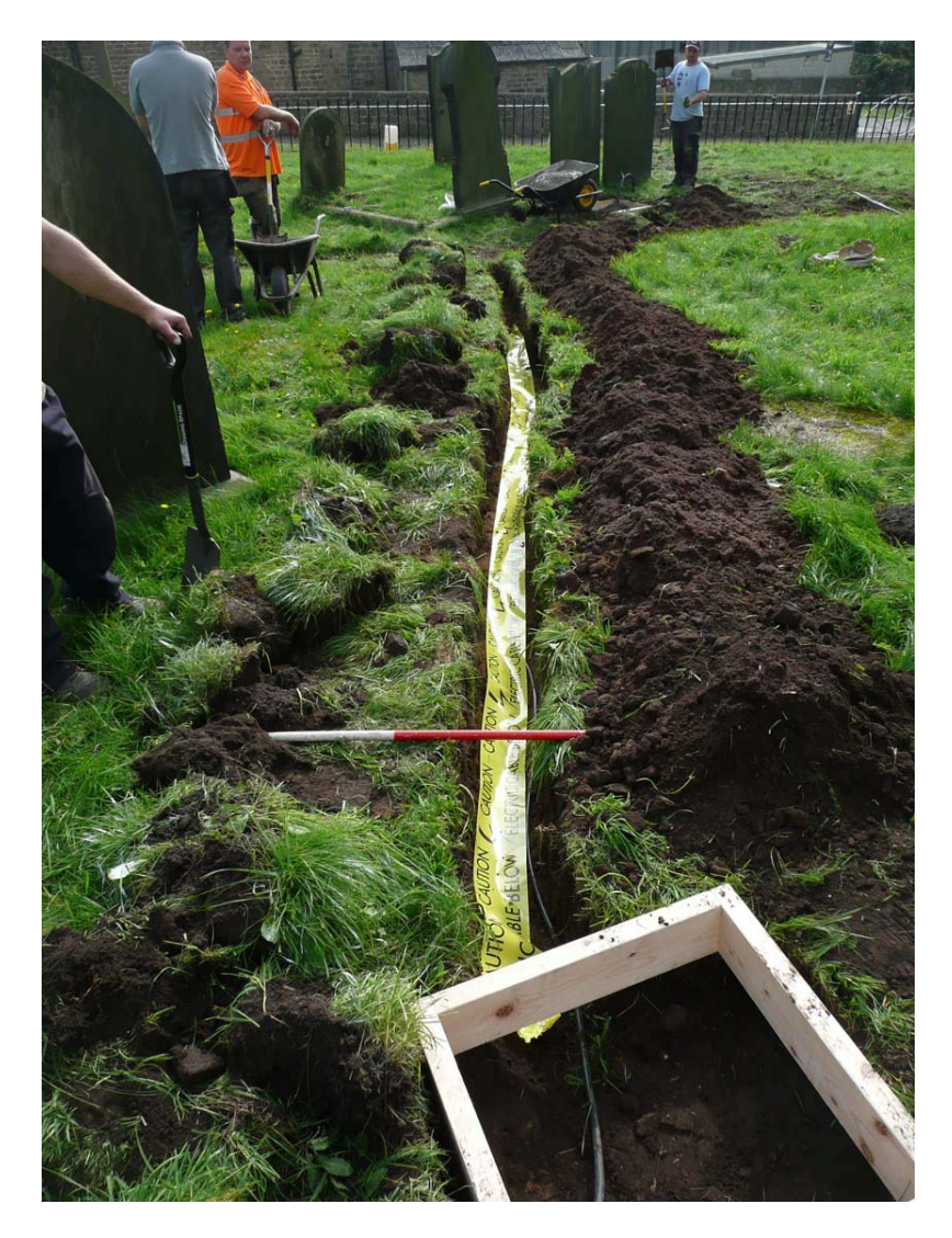
Plate 4 Trench to the north of the church