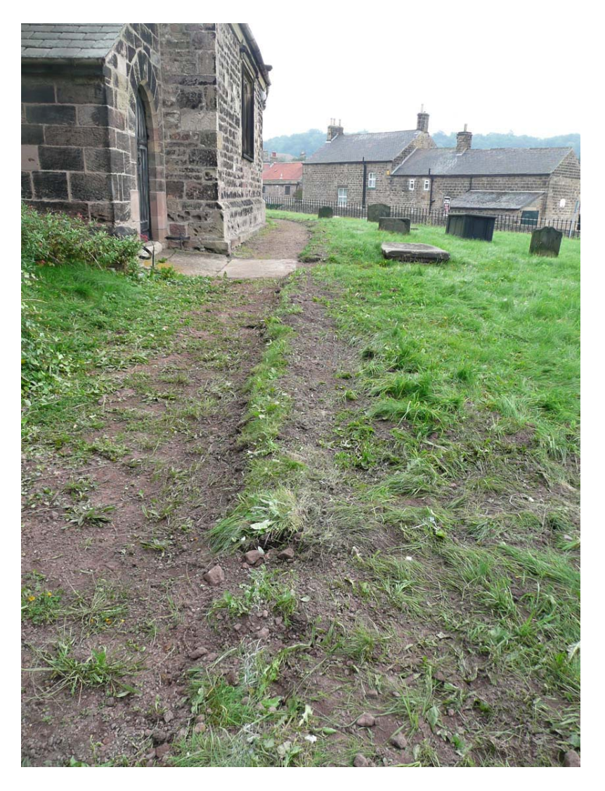
Plate 8 Backfilled trench to south of the church