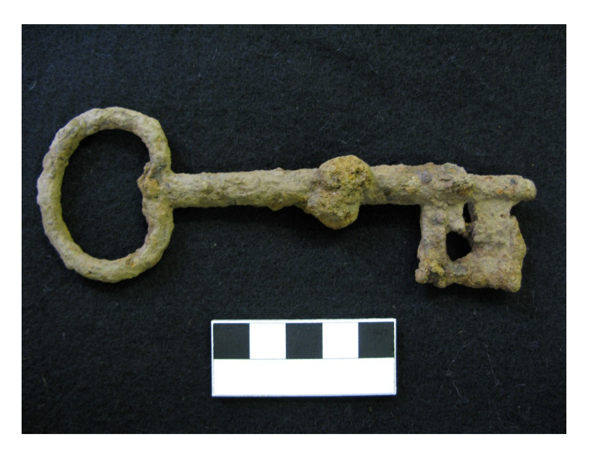
Plate 10 Iron key from [100]