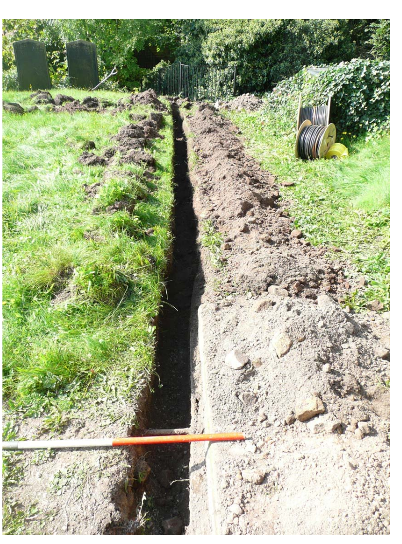
Plate 2 Trench to the south of the church