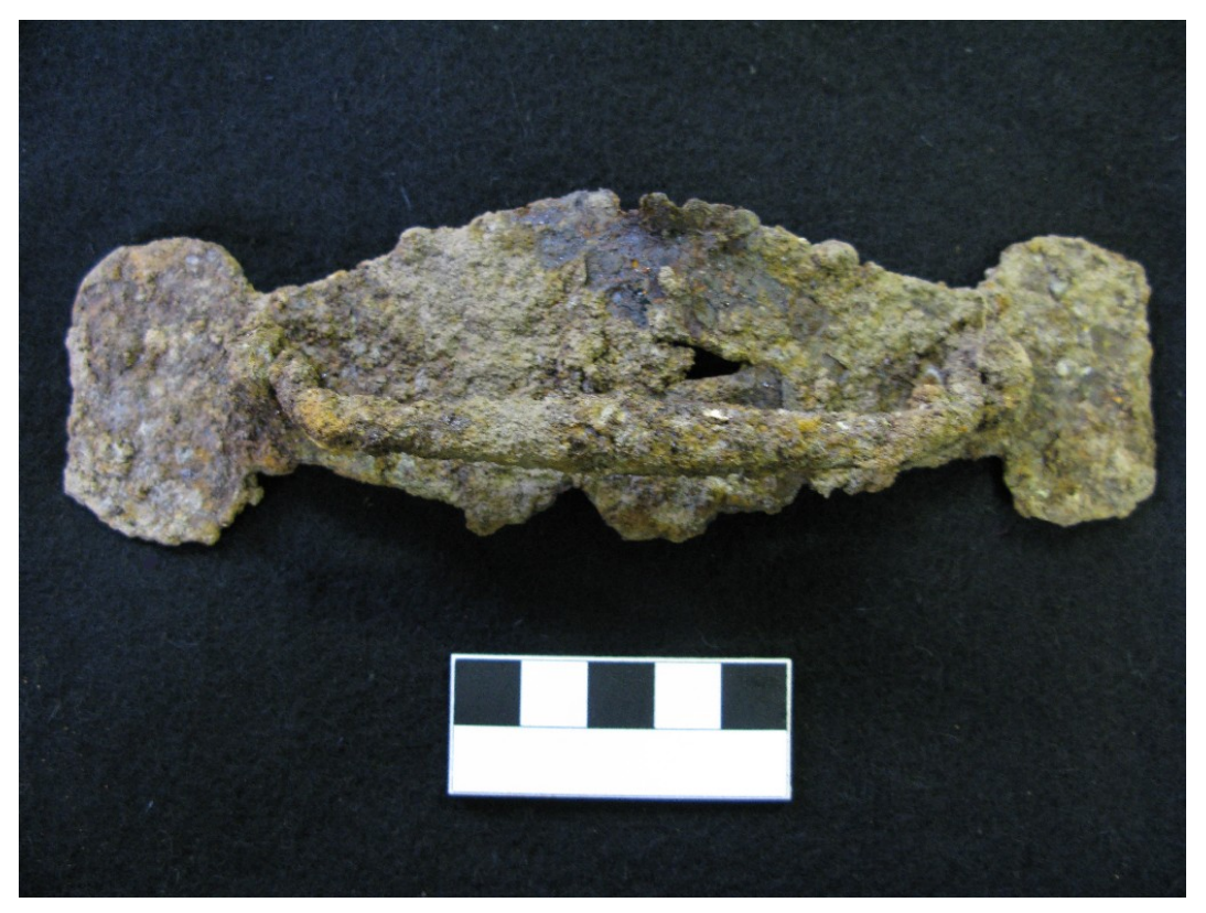
Plate 9 Coffin grip from [100]