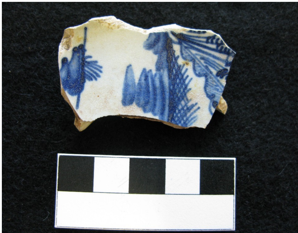
Plate 2: Transfer printed Pearlware sherd.