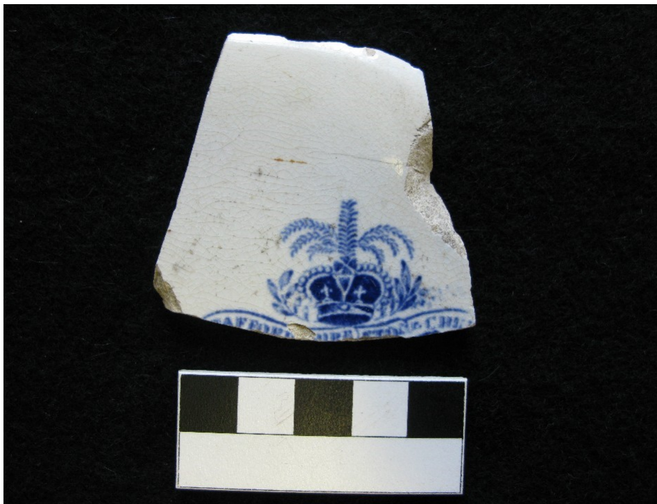
Plate 4: Transfer printed Whiteware sherd, with mark identifying the origin of the vessel as Staffordshire.