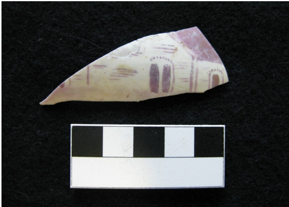
Plate 5: Bone china sherd with lustre decoration.