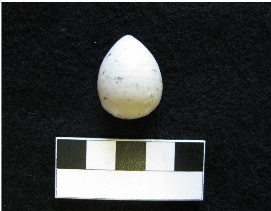
Plate 6: White, glazed tear-drop or pear-shaped bone china object with one side ground flat after firing.