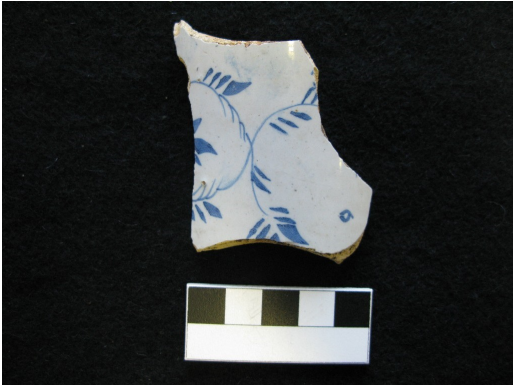
Plate 1: Tin Glazed Earthen sherd with hand painted decoration.