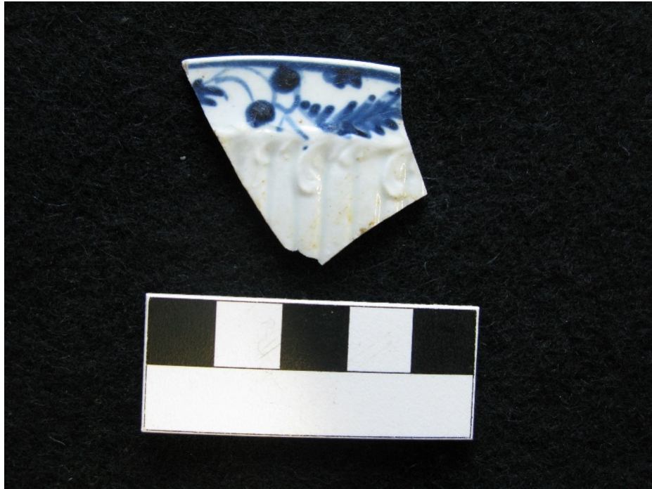
Plate 3: Transfer printed Pearlware sherd.