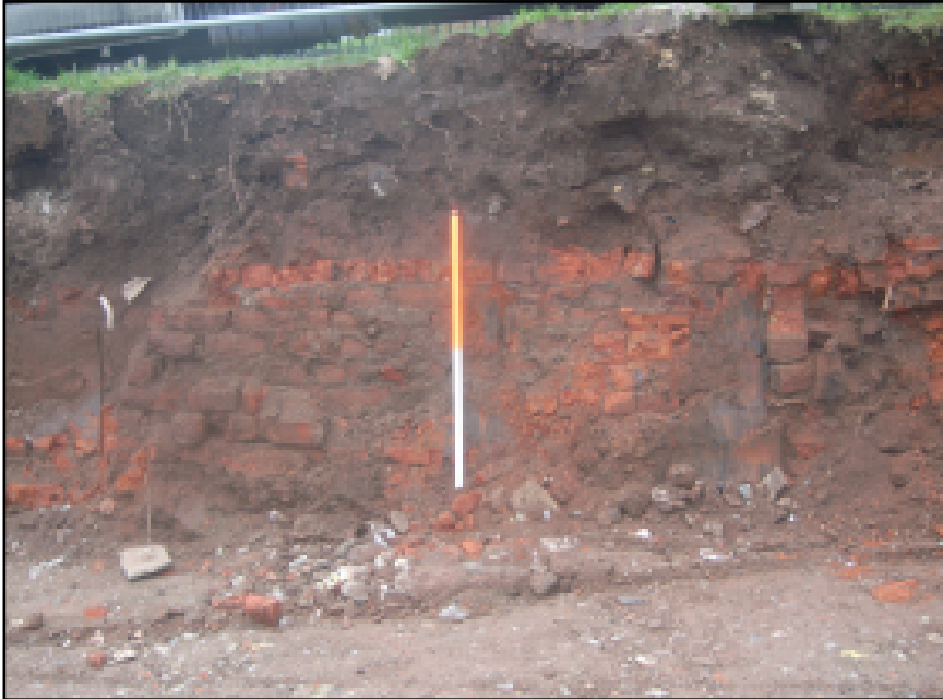
Plate 1 East-facing section showing brick foundation of Victorian house