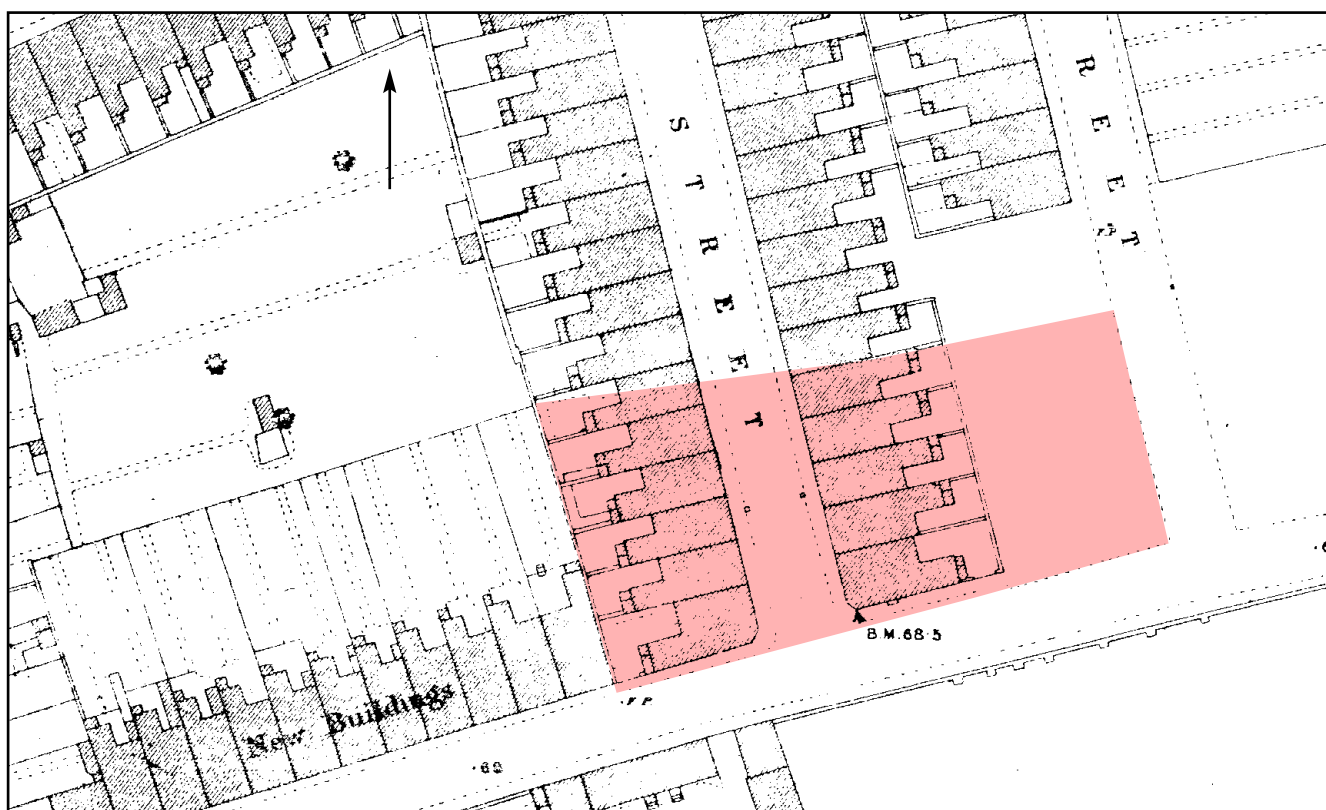
Fig.3 Ordnance Survey 1:500 plan, 1883 (reduced)