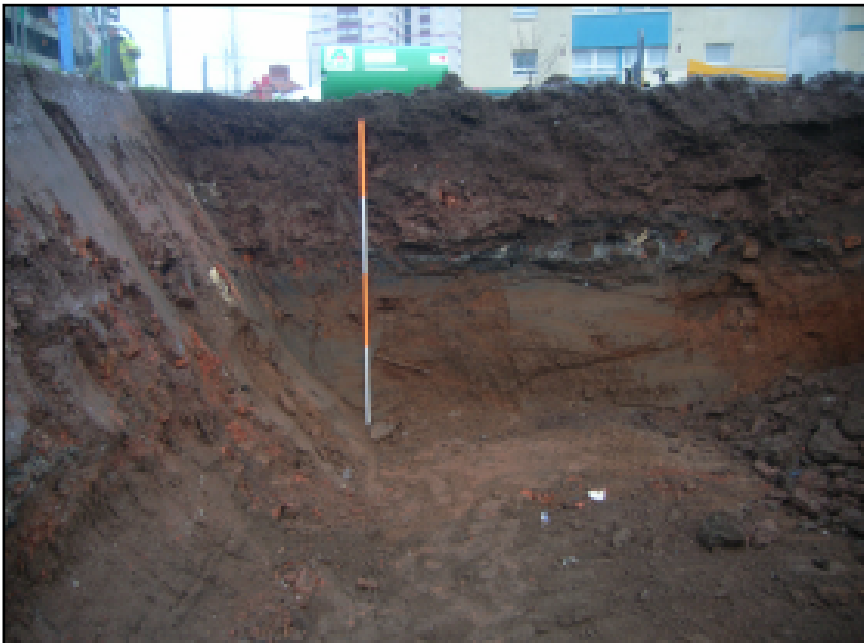
Plate 2 South-facing section showing demolition deposit and made up ground