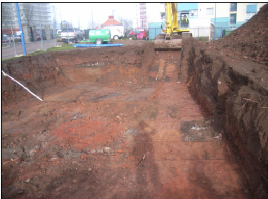
Plate 3 General view of site showing the natural Redcliffe Sandstone