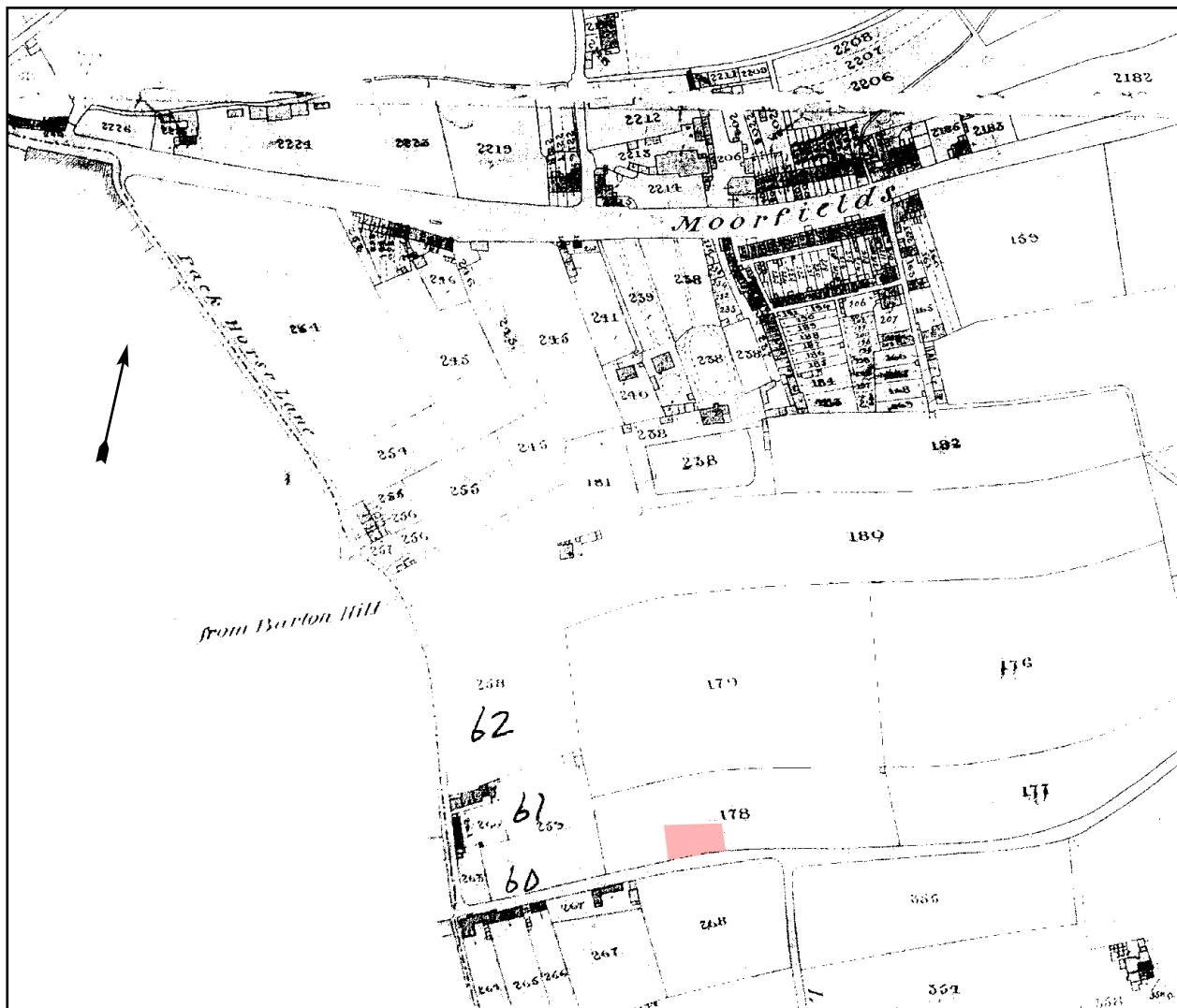
Fig.2 St George Tithe Map, 1842