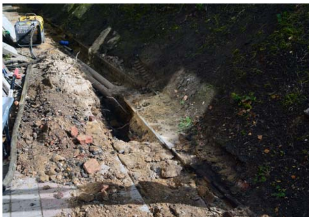
Excavation of trench at deepest impact (400mm), looking north-east