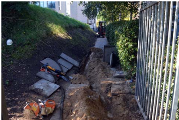
Excavation of trench, looking south-west

Approximately 28m of trenching was monitored, aligned along a footpath between the county council offices and Wessex Place (Fig. 1). The trench measured 200-300mm wide and between 200mm to 400mm in depth. All works were kept within the footprint of the pathway, and no topsoil was disturbed. No archaeological deposits or natural geology were encountered during the monitoring, with only modern made ground related to the footpath being impacted upon.