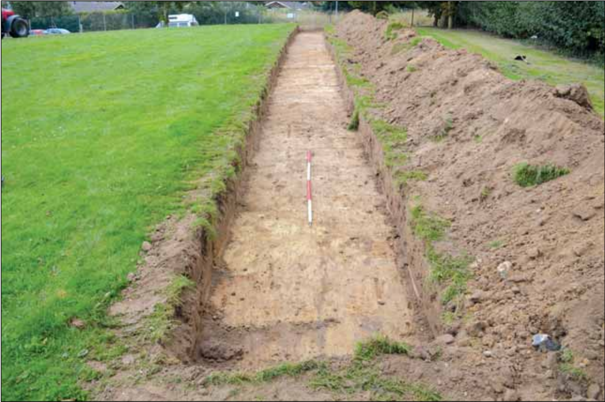
Plate 1: Excavated trench, looking north