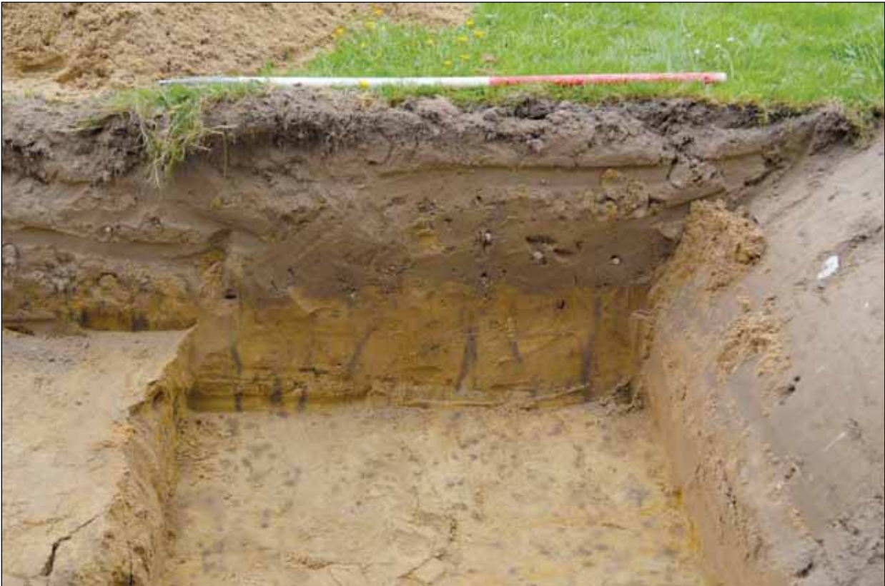
Plate 4: East-facing section of test pit 3