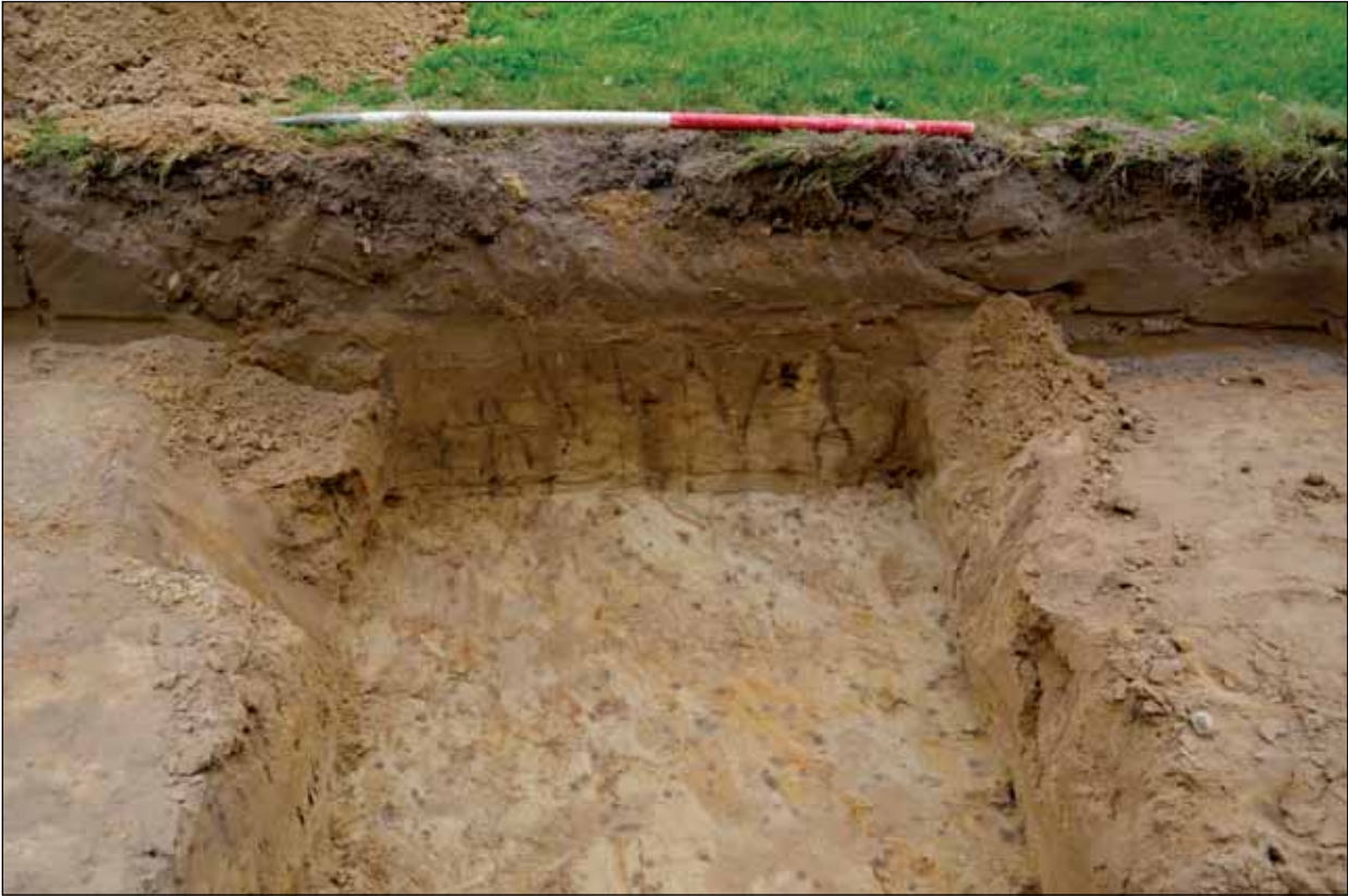
Plate 3: East-facing section of test pit 2