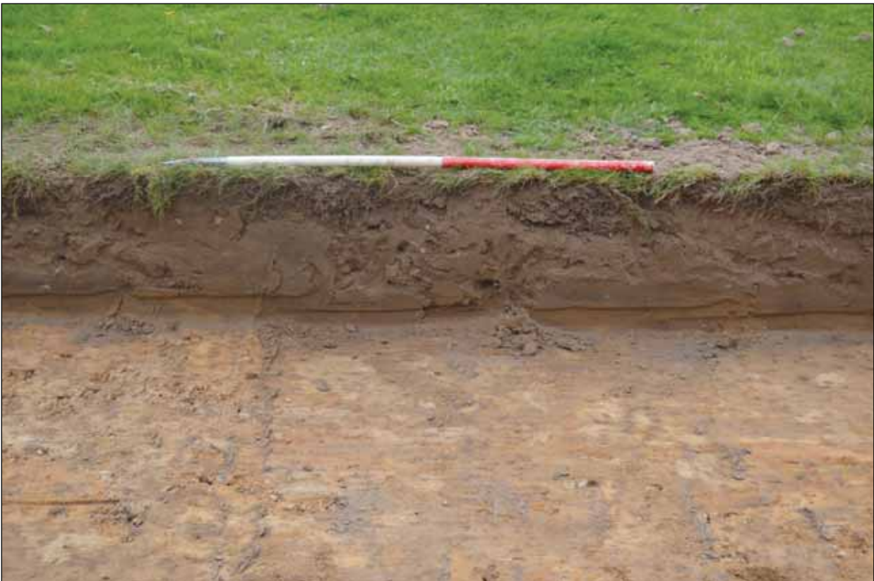
Plate 2: East-facing section of trench