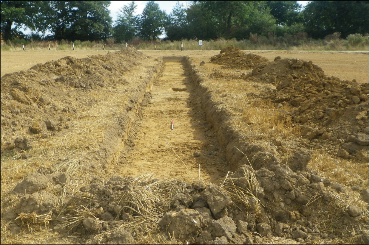
Plate 1: Trench 570, looking from west