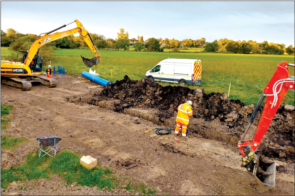
Plate 3: Excavating the pipeline trench, looking south towards Burgh le Marsh