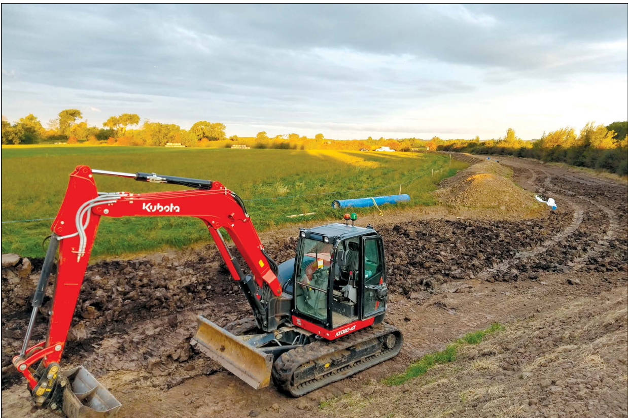
Plate 2: Central part of the pipeline scheme, northwest of The Common, looking west