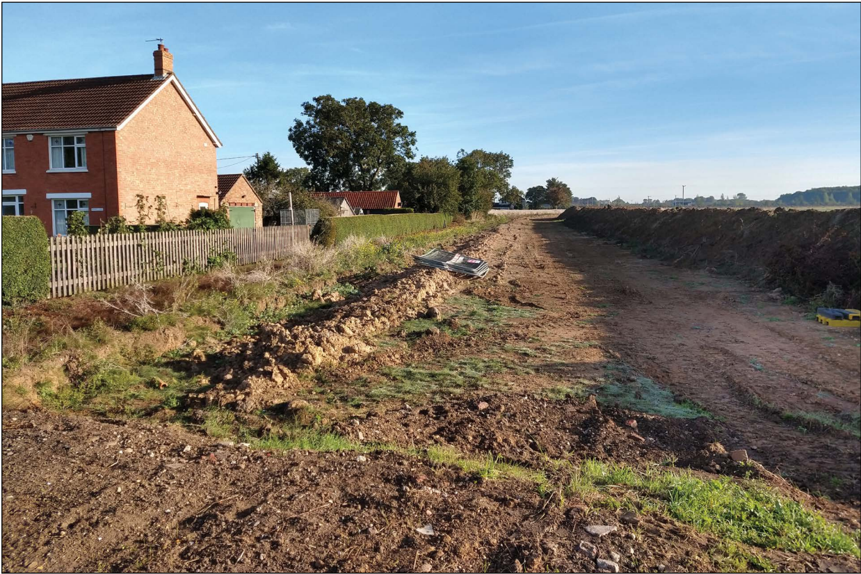
Plate 1: Western end of the pipeline scheme, north of Orby Road, looking north