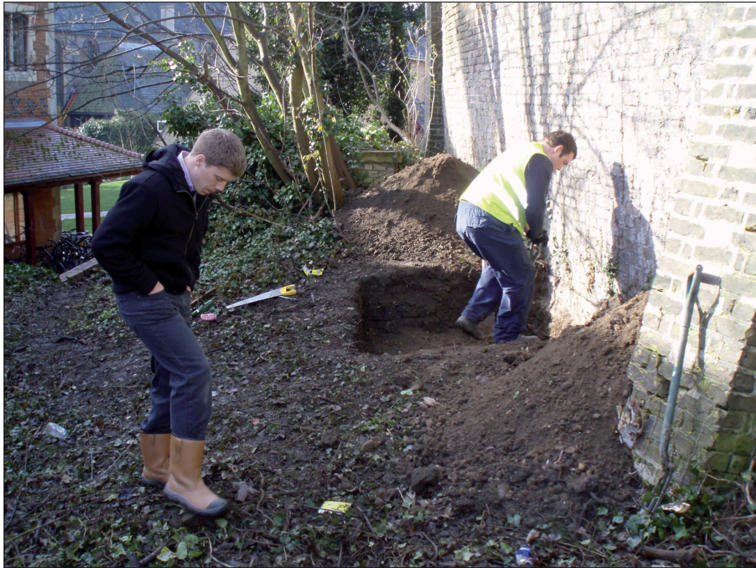
Plate 1: Working shot