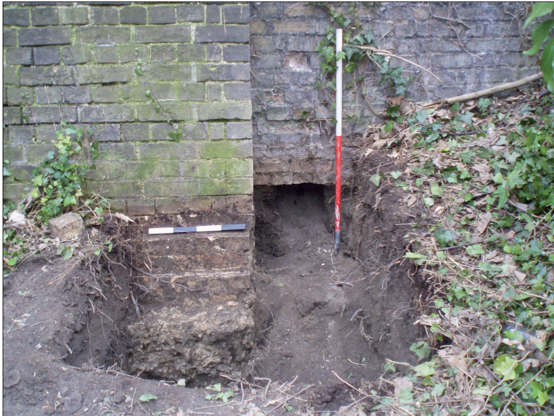
Plate 2: Test pit 2