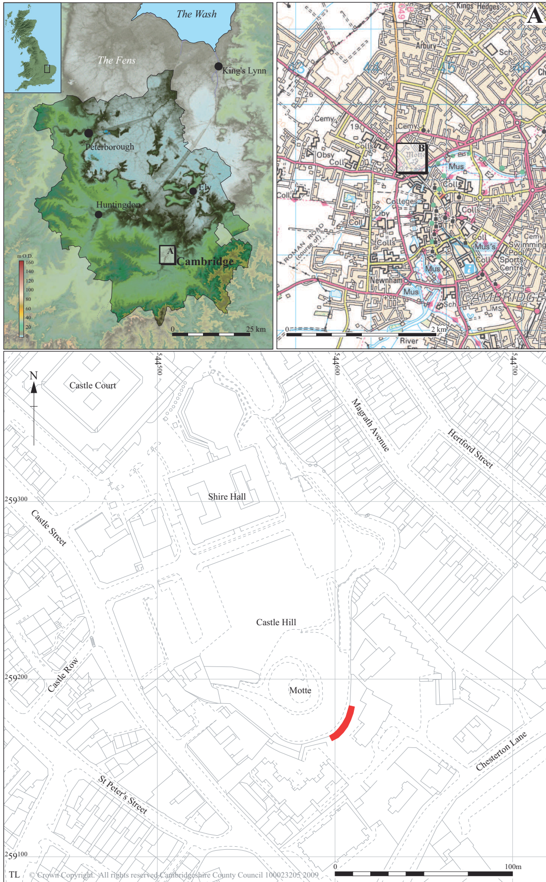
Figure 1 Location of the watching brief area (red)